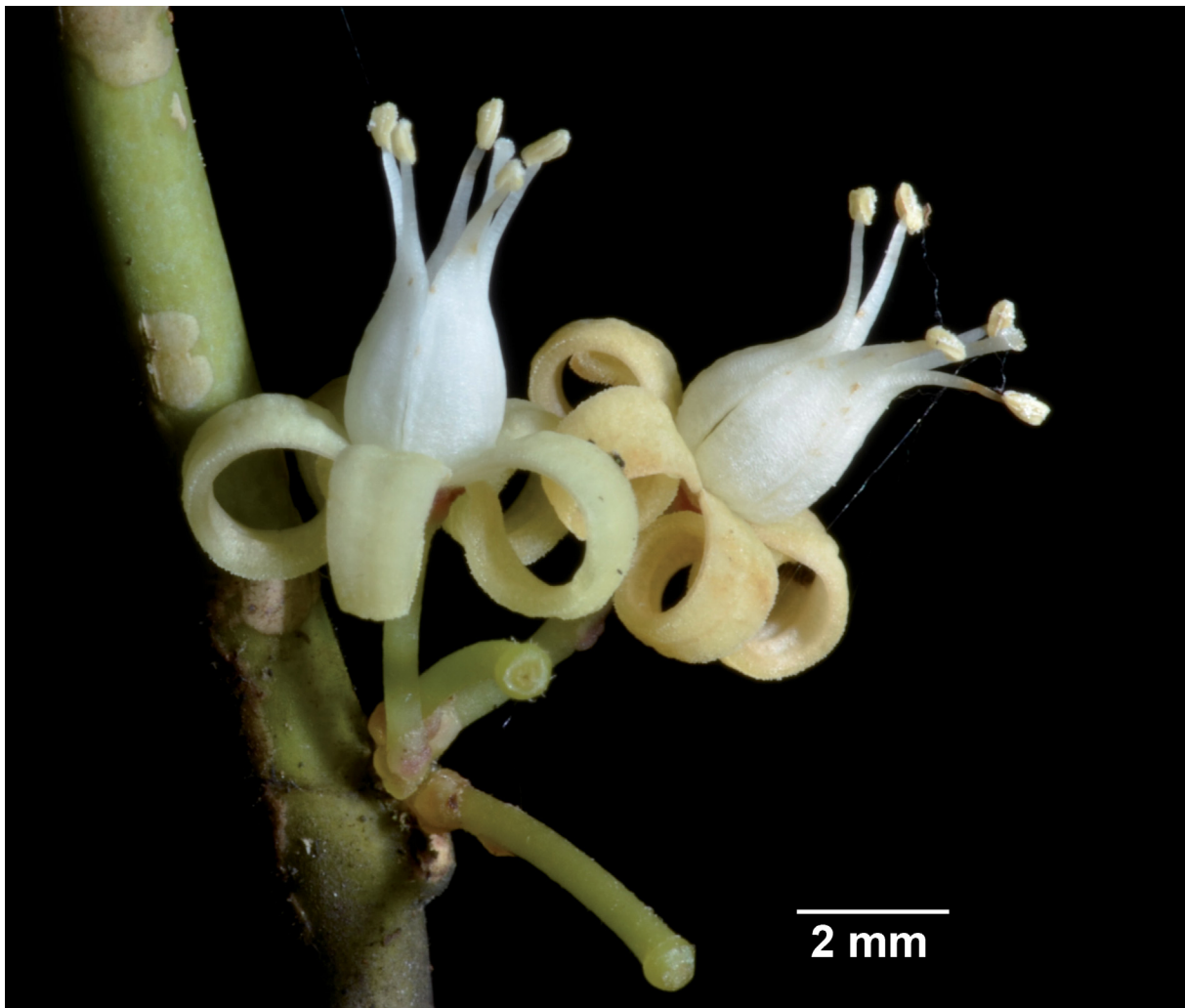
Fig. 2. Rhaphiostylis preussii Engl. showing flowers with the flattened filaments closing around the ovary while the petals are bending down. Photograph by Ehoarn Bidault (Missouri Botanical Garden) from Bidault 786 (MO) from Gabon.