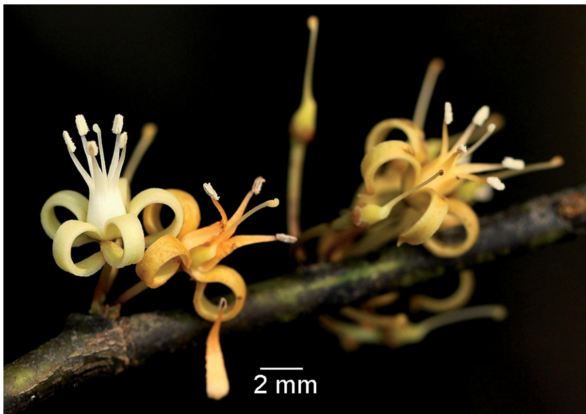
Fig. 3. Rhaphiostylis beninensis (Hook.f. ex Planch.) Planch. ex Benth., like Fig. 2, but also showing ovary and style in older flowers. from Boyekoli Ebale Botany 785 (BR) from Congo Kinshasa.

part of Liberia, and while it is not sure that the species grows in a protected area, “Vulnerable” should be the correct status for the moment (B1 & B2 ab(iii), IUCN 2015).