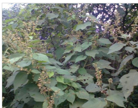
Figure 39: Triumfetta pentandra A. rich (Tiliaceae)