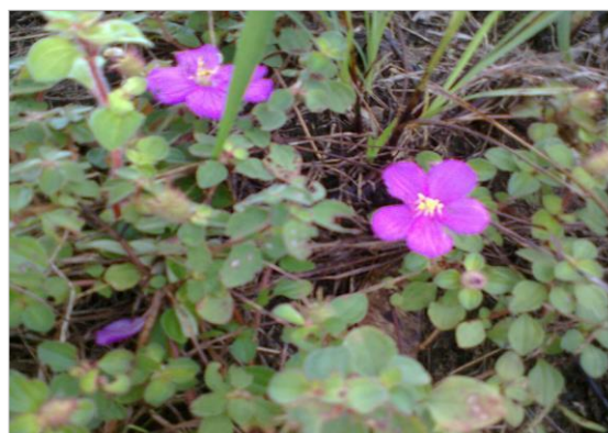
Figure 6: Heterotis rotundifolia (sm) Jac.-Fel (Melastomataceae)