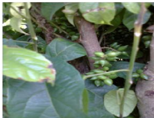
Figure 14: Maesobotrya barteri (Baill.) Hutch (Euporbiaceae )