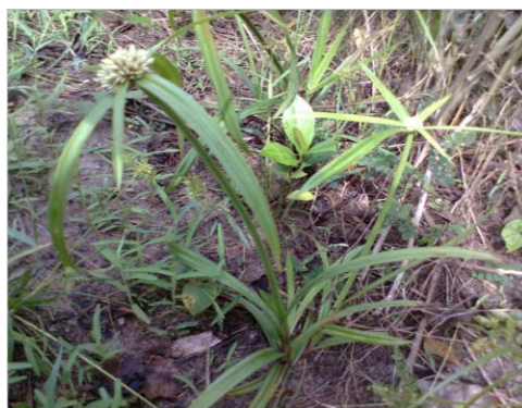
Figure 12: Cyperus mapaniodes C. B. Cl (Cyperaceae)