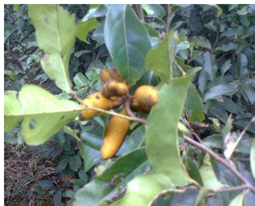
Figure 18: Uvaria chamae P. Beauv. (Annonaceae)