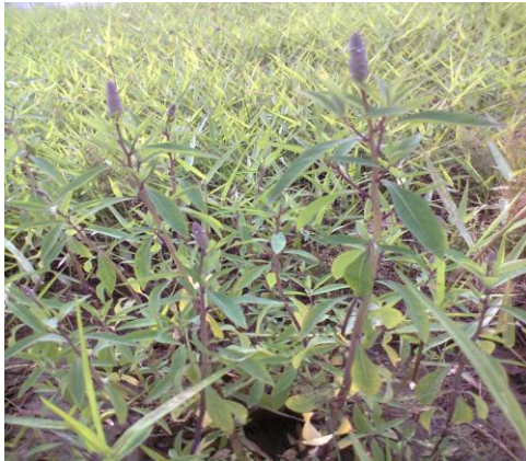
Figure 35: Sphenoclea zeylanica Geartn.