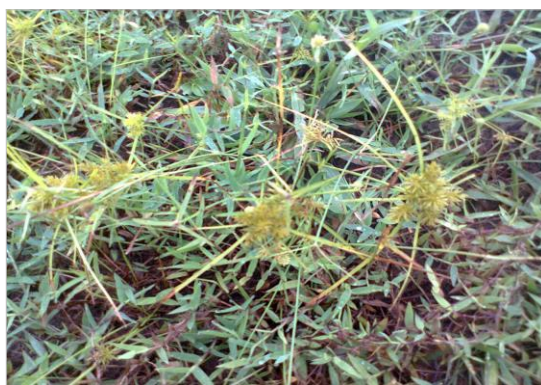
Figure 4: Mariscus longibracteatus Cherm. (Cyperaceae)