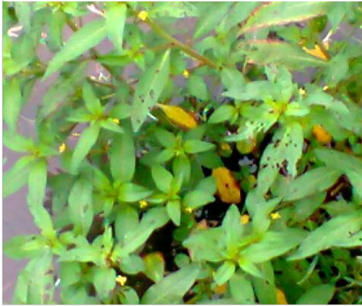
Figure 21: Ludwigia erecta (L.) H. Hara