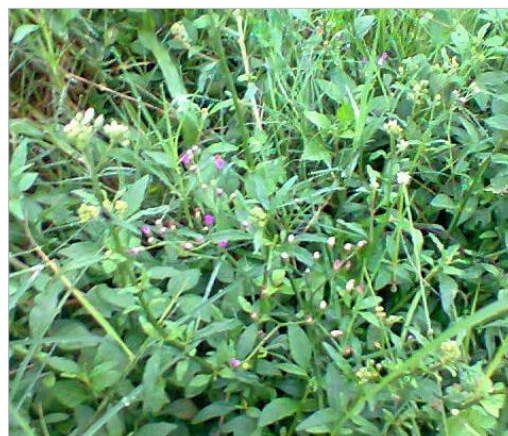
Figure 29: Solenostemon monostachyus (P. Beauv) Brig (Lamiaceae)