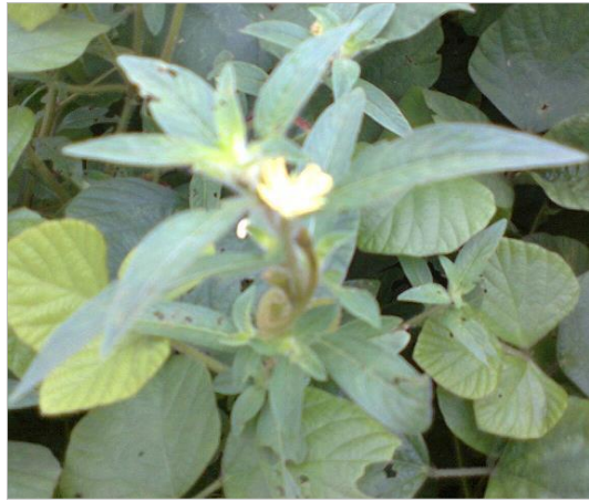
Figure 22: Ludwigia suffruticosa (Willd.) Oliv. ex O. Ktze.