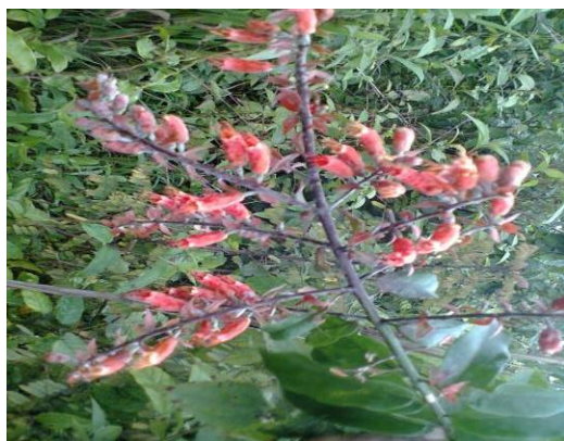
Figure 13: Combretum bracteosum P. Beauv (Combretaceae)