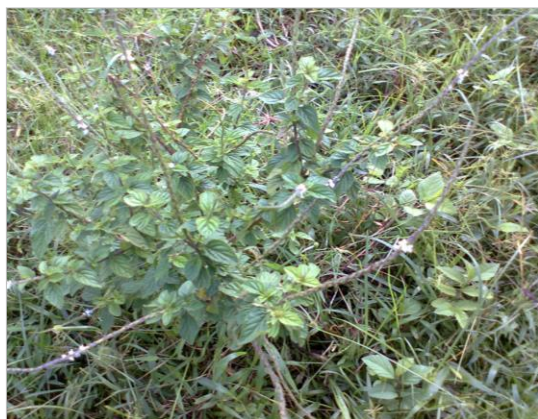
Figure 7: Stachytarpheta cayenensis (L. C. Rich) Schau (Verbenaceae)