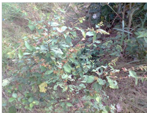
Figure 37: Trriumfetta rhomboideae Jacq (Tiliaceae)