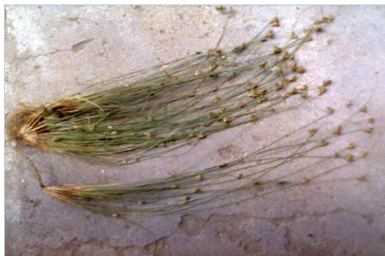
Figure 9: Pycreus lanceolatus (Poir) C. D. CL. (Cyperaceae)