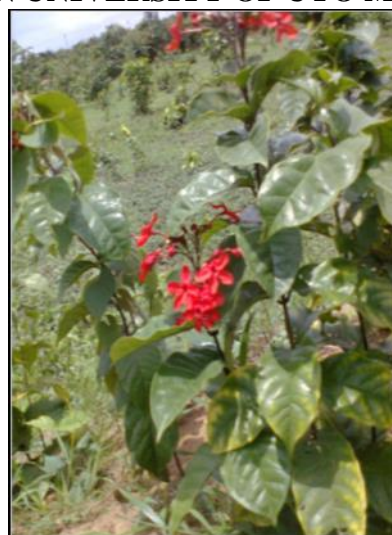
Figure 1: Anthonotha macrophylla P. Beauv.