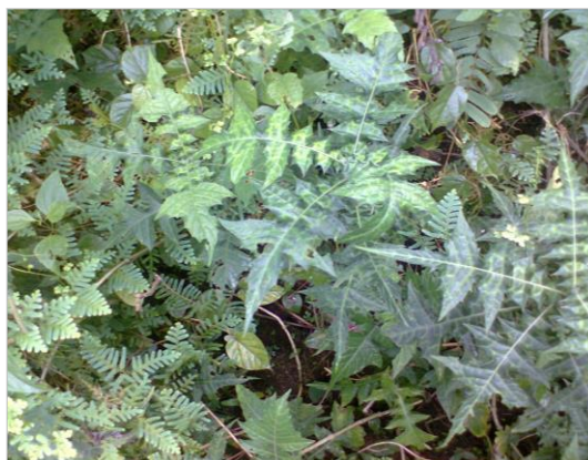
Figure 20: Acanthus montanus (Nees) T. Anders