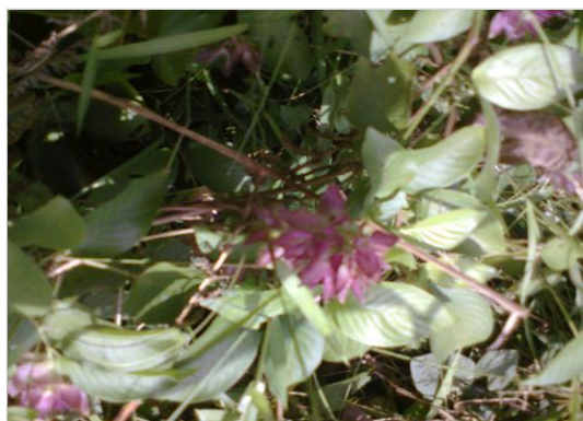
Figure 3: Sabicea efulenensis (Hutch.) Hepper (Rubiaceae)