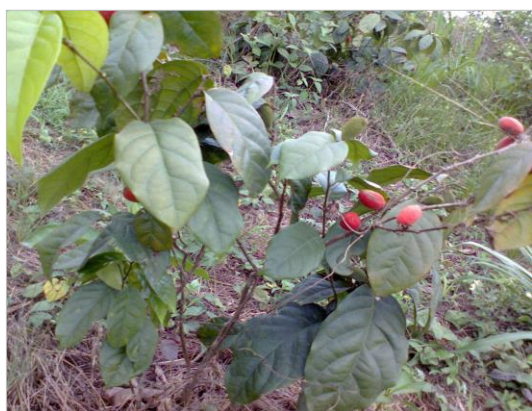
Figure 19: Icacina trichantha Oliv.