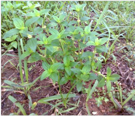
Figure 33: Mitracarpus villosus (sw) D C.