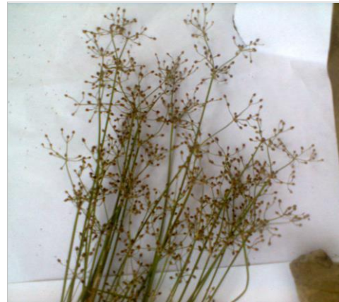
Figure 36: Fimbristylis littoralis Gaudich