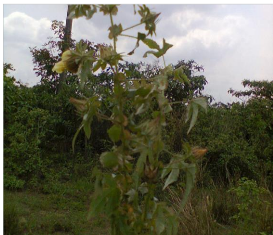
Figure 15: Hibiscus surattensis L. (Malvaceae)