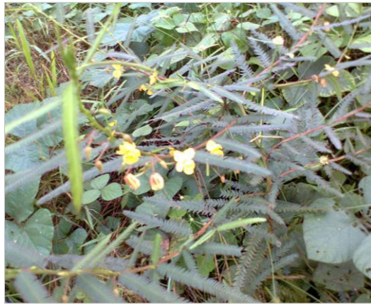
Figure 24: Cassia mimosioides L.