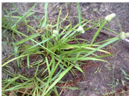
Figure 11: Kyllinga pumila . Michx (Cyperaceae)