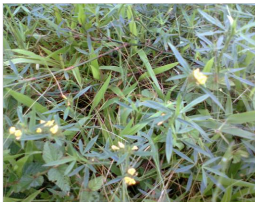
Figure 30: Vernonia cinerea (L.) Less (Asteraceae)