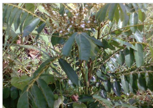
Figure 8: Manotes longiflora (Connaraceae)