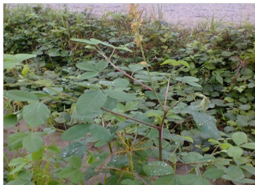
Figure 25: Gomphrena celosioides Mart (Amaranthaceae)