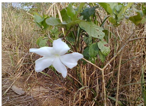
Figure 10: Callichilia stenosepala (Apocynaceae)