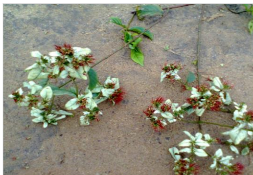
Figure 26: Platostoma africanum P. Beauv. (Lamiaceae)