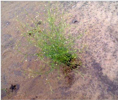
Figure 23: Oldenlandia herbacea L.