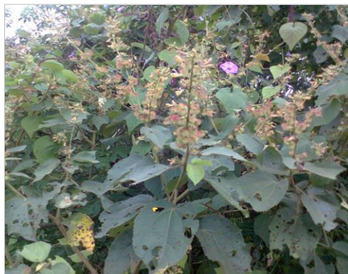
Figure 38 Triumfetta tomentosa Boj (Tiliaceae)