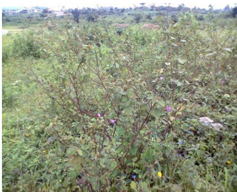
Figure 41: Triumfetta heudelotii Planch ex mast. (Tiliaceae)