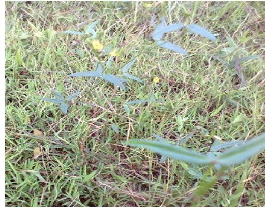
Figure 34: Zornia latifolia sm