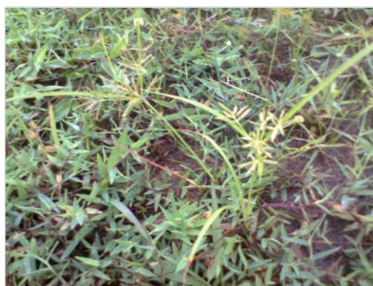
Figure 5: Cyperus procerus Rottb (Cyperaceae)