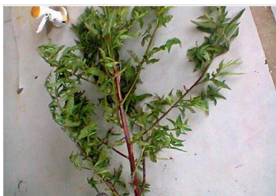
Figure 7: Ludwigia hyssopifolia (G. Don)Exell (Onagraceae)