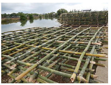
Bamboo is used formussels breeding and propagation (Abucay, Bataan, Philippines).