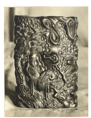
Photo of carved Chinese bamboo wall vase. 1918.

Bamboo, one of the "Four Gentlemen" (bamboo, orchid, plum blossom and chrysanthemum), plays such an important role in traditional Chinese culture that it is even regarded as a behavior model of the gentleman. As bamboo has features such as uprightness, tenacity, and hollow heart, people endow bamboo with integrity, elegance, and plainness, though it is not physically strong. Countless poems praising bamboo written by ancient Chinese poets are actually metaphorically about people who exhibited these characteristics. According to laws, an ancient poet, Bai Juyi (772–846), thought that to be a gentleman, a man does not need to be physically strong, but he must be mentally strong, upright, and perseverant. Just as a bamboo is hollow-hearted, he should open his heart to accept anything of benefit and never have arrogance or prejudice. Bamboo is not only a symbol of a gentleman, but also plays an important role in Buddhism, which was introduced into China in the first century. As canons of Buddhism forbids cruelty to animals, flesh and egg were not allowed in the diet. The tender bamboo shoot (sǔn筍 in Chinese) thus became a nutritious alternative. Preparation methods developed over thousands of years have come to be incorporated into Asian cuisines, especially for monks. A Buddhist monk, Zan Ning, wrote a manual of the bamboo shoot called "Sǔn Pǔ筍譜" offering