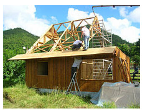
House made entirely of bamboo

Various structural shapes may be made by training the bamboo to assume them as it grows. Squared sections of bamboo are created by compressing the growing stalk within a square form. Arches may similarly be created by forcing the bamboo's growth into the desired form, costing much less than it would to obtain the same shape with regular wood timber. More