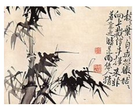
Bamboo, by Xu Wei, Ming Dynasty.

In Chinese culture, the bamboo, plum blossom, orchid, and chrysanthemum (often known as méi lán zhú jú 梅兰竹菊) are collectively referred to as the Four Gentlemen. These four plants also represent the four seasons and, in Confucian ideology, four aspects of