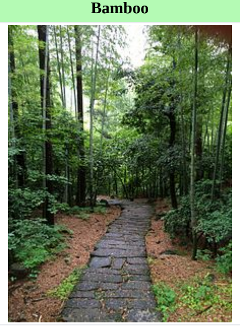
Bamboo forest at Huangshan, China