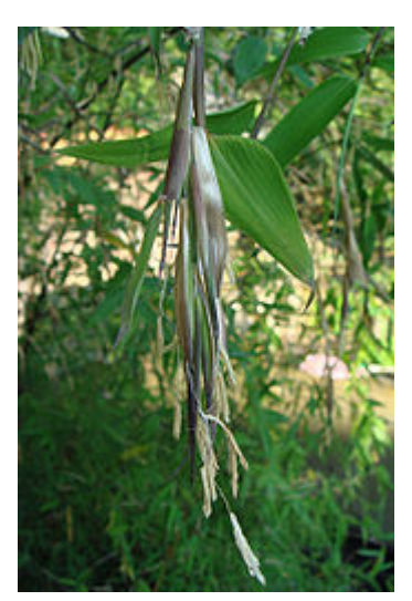
Phyllostachys glauca 'Yunzhu' in flower

Several bamboo species are never known to set seed even when sporadically flowering has been reported. Bambusa vulgaris, Bambusa balcooa, and Dendrocalamus stocksii are common examples of such bamboo.<sup>[27]</sup>