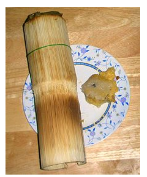
Khao lam (Thai: ข้าวหลาม) is glutinous rice with sugar and coconut cream cooked in specially prepared bamboo sections of different diameters and lengths

The empty hollow in the stalks of larger bamboo is often used to cook food in many Asian cultures. Soups are boiled and rice is cooked in the hollows of fresh stalks of bamboo directly over a flame. Similarly, steamed tea is sometimes rammed into bamboo hollows to produce compressed forms of Pu-erh tea. Cooking food in bamboo is said to give the food a subtle but distinctive taste.