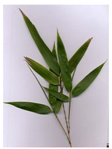
Bamboo foliage with yellow stems (probably Phyllostachys aurea )