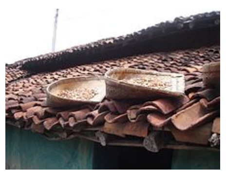
Sun drying of Mahua (Madhuca) using Traditional Supa prepared from Bamboo in Chhattisgarh Village, India