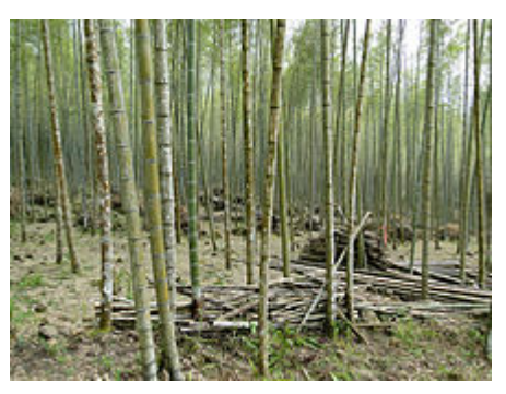
Bamboo forest in Taiwan