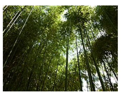
Bamboo forest in France

Regular observations at ground level indicate major growth directions and locations of rhizomes. In dry and hard soil conditions extending rhizomes will cause cracks in the soil surface. To facilitate rhizome maintenance it's best to dig a furrow around the bamboo planting and/or plant in araised mound or bottomless lumber frame box. During "root pruning" of running bamboo the cut rhizomes are typically removed; however, rhizomes take a number of months to mature, and an immature, severed rhizome usually ceases growing if left in-ground. If any bamboo shoots come up outside of the bamboo area afterwards, their presence indicates the precise location of the removed rhizome. The fibrous roots that radiate from the rhizomes do not produce more bamboo.