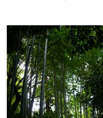
Phyllostachys pubescens in Batumi Botanical Garden