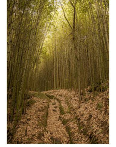
Trail through bamboo forest at the Serra dos Órgãos National Park, Brazil

More recently, a mathematical explanation for the extreme length of the flowering cycles has been offered, involving both the stabilizing selection implied by the predator satiation hypothesis and others, and the fact that plants that flower at longer intervals tend to release more seeds.<sup>[24][25]</sup> The hypothesis claims that bamboo flowering intervals grew by integer