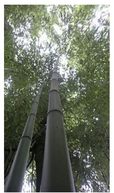
Phyllostachys stalk, Bamboo forest in Isère / France