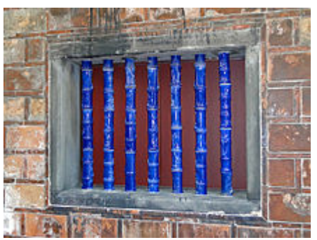
Bamboo-style barred window inLin An Tai Historical House, Taipei

A cylindrical bamboo brush holder or holder of poems on scrolls, created by Zhang Xihuang in the 17th century late Ming or early Qing Dynasty – in the calligraphy of Zhang's style, the poem Returning to My Farm in the Field by the fourth-century poetTao Yuanming is incised on the holder