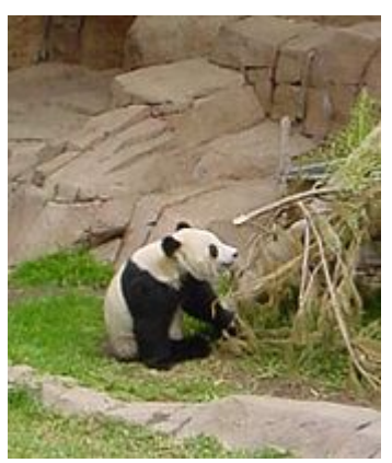
Bamboo is the main food of the giant panda, making up 99% of its diet.

Leaching is the removal of sap after harvest. In many areas of the world, the sap levels in harvested bamboo are reduced either through leaching or postharvest photosynthesis. Examples of this practice include: