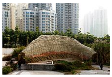
Bamboo pavilion in the Shenzhen Biennale