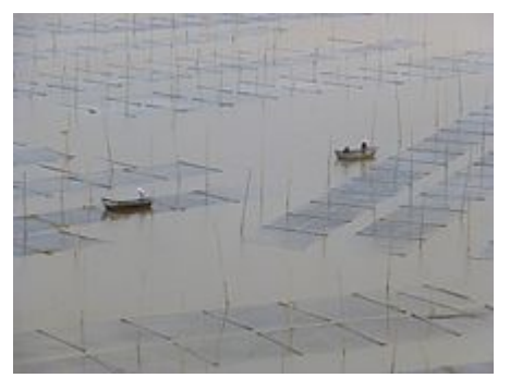
Bamboo is extensively used for fishing and aquaculture applications on the Dayu Bay in Cangnan County, Zhejiang

In parts of India, bamboo is used for drying clothes indoors, both as a rod high up near the ceiling to hang clothes on, and as a stick wielded with acquired expert skill to hoist, spread, and to take down the clothes when dry. It is also commonly used to make ladders, which apart from their normal function, are also used for carrying bodies in funerals. In Maharashtra, the bamboo groves and forests are called Veluvana , the name velu for bamboo is most likely from Sanskrit, while vana means forest.