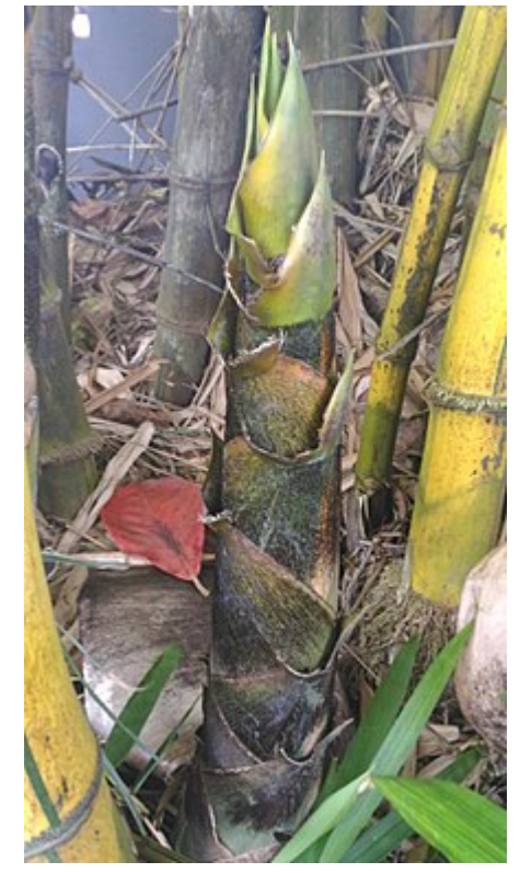
Seedling of Bamboo

Qiongzhuea, Semiarundinaria (Brachystachyum), Shibataea, Sinobambusa, Temburongia (incertae sedis).