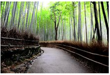
Bamboo forest in Arashiyama