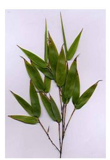
Bamboo foliage with black stems (probably Phyllostachys nigra )

Durability of bamboo in construction is directly related to how well it is handled from the moment of planting through harvesting, transportation, storage, design, construction, and maintenance. Bamboo harvested at the correct time of year and then exposed to ground contact or rain will break down just as quickly as incorrectly harvested material.<sup>[28]</sup>