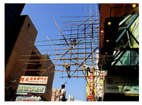
Bamboo has long been used as an assembly material inHong Kong because of its versatility

In its natural form, bamboo as a construction material is traditionally associated with the cultures of South Asia, East Asia, and the South Pacific, to some extent in Central and South America, and by extension in the aesthetic of Tiki culture. In China and India, bamboo was used to hold up simple suspension bridges, either by making cables of split bamboo or twisting whole culms of sufficiently pliable bamboo together. One such bridge in the area of Qian-Xian is referenced in writings dating back to 960 AD and may have stood since as far back as the third century BC, due largely to continuous maintenance.