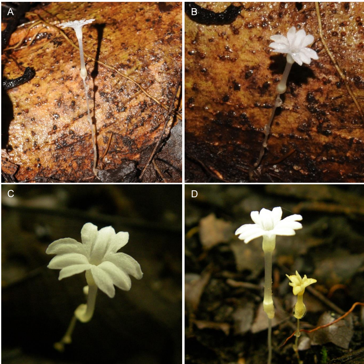
Fig. 1. Gymnosiphon fonensis . A. side view of inflorescence, note cylindrical distal portion of perianth tube. B. flower, three-quarter view; C. flower showing outer perianth lobes with equal lateral and median portions; D. Gymnosiphon fonensis (left) with Gymnosiphon samouritoureanus (right); A & B photo of Cheek 19334 (HNG, K); C & D from van der Burgt 1274 (HNG, K)

The number of species described as new to science each year regularly exceeds 2000, adding to the estimated 369 000 already known (Nic Lughadha et al. 2016; Cheek et al. 2020b). Only about 7% of plant species have been assessed and included on the redlist using the IUCN (2012) standard (Bachman et al. 2019), but this number rises to 21–26% when additional evidence-based assessments are considered, and 30–44% of these assess the species as threatened (Bachman et al. 2018).