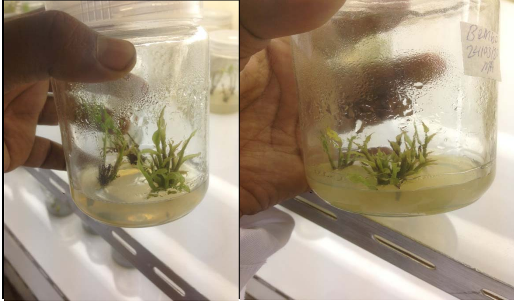
Figure 5. Multiplication of new leaf from initiated seed at 0.004 g /L BAP hormone.