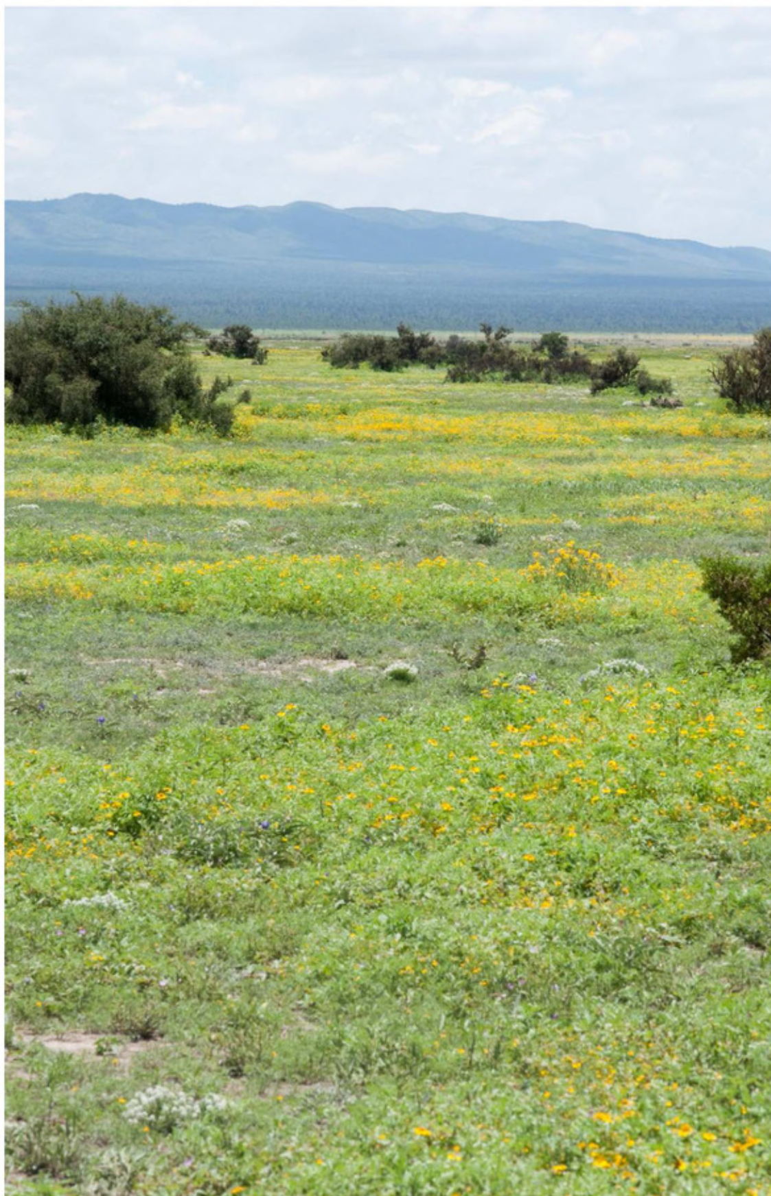
Figure 5. Habitat of Plateilema palmeri at 14560 collection site, looking east from edge of Coahuila into Nuevo Leon, Mexico. Shrubs are mostly Koeberlinia and Larrea ; yellow flowers are mostly Heliopsis .