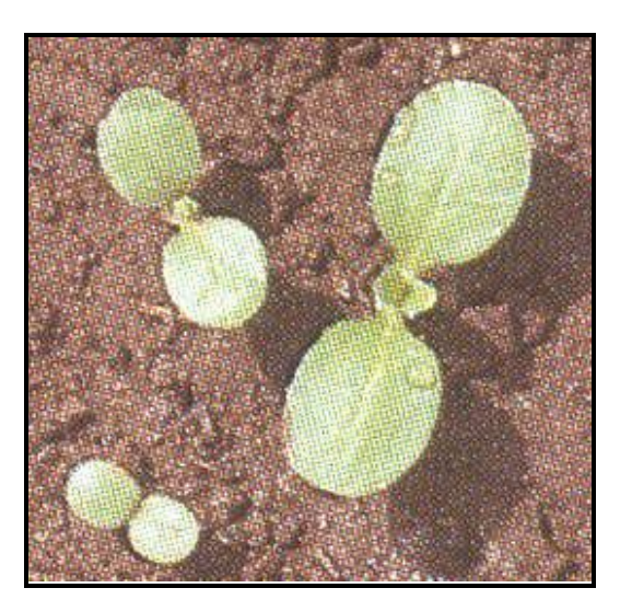
Figure 2. Trichodesma zeylanicum seedling from Vernon (1983)