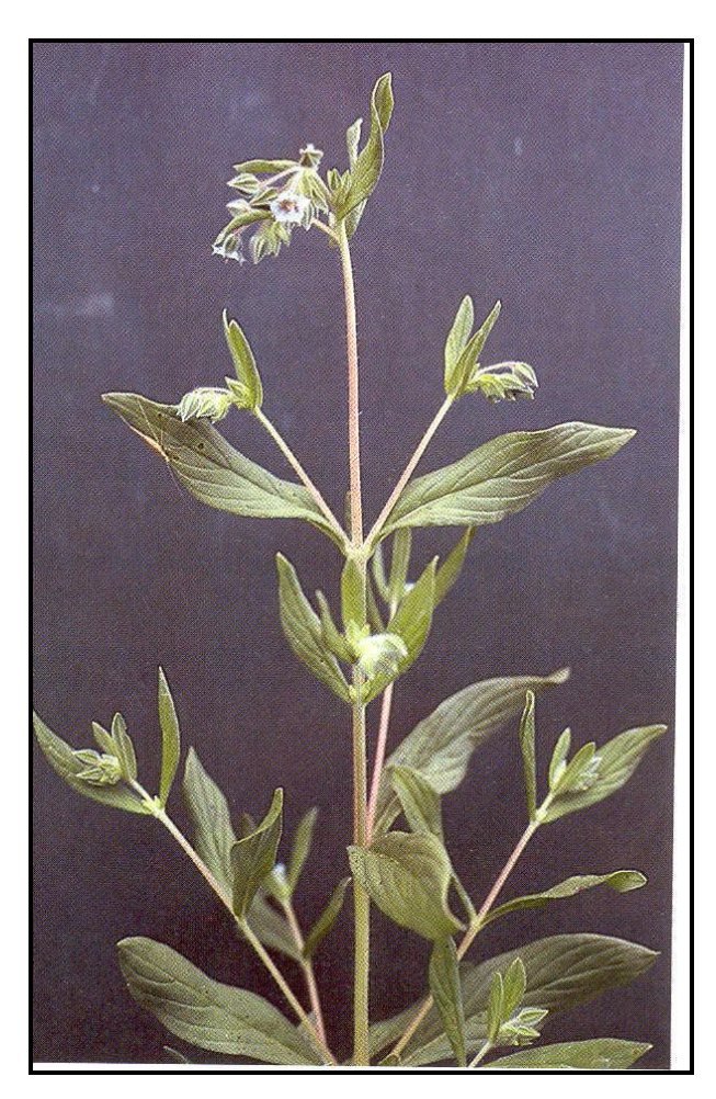
Figure 3. Trichodesma zeylanicum from Vernon (1983)

Distribution: Trichodesma zeylanicum is native to Africa (Ethiopia, Kenya, Madagascar, Malawi, Mozambique, Namibia, South Africa, Sudan, Swaziland, Tanzania, Uganda, Zaire, Zambia, Zimbabwe), Asia (India, the Philippines, Malaysia), and Australasia