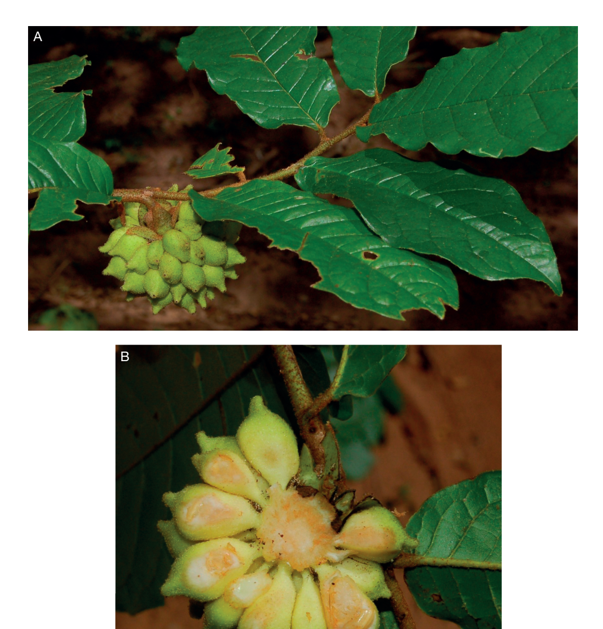
Fig. 5. – Uvaria rovumae Deroin & Lötter, sp. nov.: details of fruit. A, fruiting twig; B, cross section of the pseudosyncarp, Lötter & Turpin 1763.