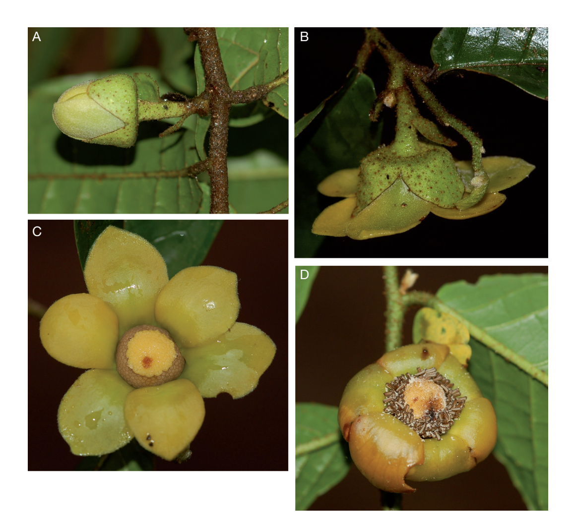
FIG. 3. – Uvaria rovumae Deroin & Lötter, sp. nov., flower morphology: A , floral bud, note the leaf-opposed position; B , C , flower at the 9 stage, by side and above, petals are spread out; D , flower at the \sigma stage, petals are strongly reflexed, pollen (white) is released by browning dislocating stamens.

The current site is dependent on the shade from a single large Newtonia paucijuga tree. The logging of this tree would allow light and fire to penetrate this biogeographically important forest patch. A large road running southwards from Nangade to Mueda cuts through part of this once larger forest patch. We suspect that more plants of Uvaria rovumae Deroin & Lötter, sp. nov., may eventually be found in the Rovuma River valley, or even in southern Tanzania. However it is currently only known from less than 5 individuals