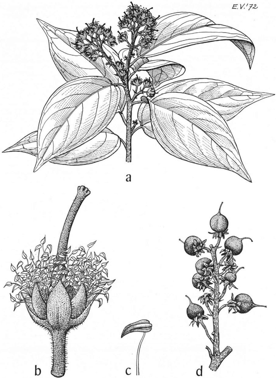
Fig. 2. Scolopia steenisiana . — a: habit, with inflorescence, \times 2/3 ; b: flower, \times 10 ; c: anther, \times 18 ; d: infructescence, \times 2/3 . (a—c: FRI 5580, type; d: 'Unesco Limestone Exp. 1962' n. 127).