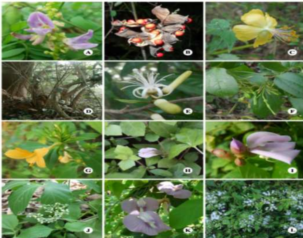
Figure 2:- Colour photographs of species. A. & B. Abrus precatorius ; C. Abutilon persicum ; D. Alangium salvifolium ssp. hexapetalum ; E. Aristolochia indica ; F. Barleria prionitis ; G. Blepharis maderaspatensis ; H. Canavalia gladiata ; I. Cayratia pedata ; J. Centrosema molle ; K. Chromolaena odorata .