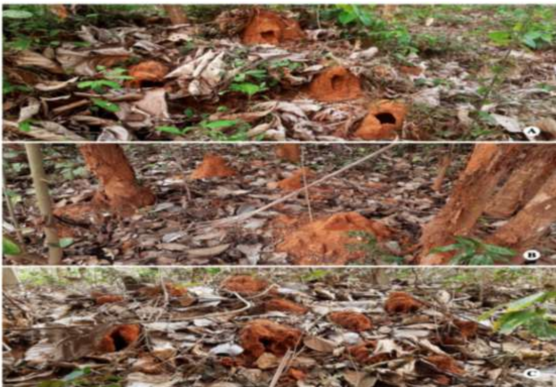
Figure 5:- A.- C. Different termite nests observed in Sreedharan Chumarath Mana Sacred grove.