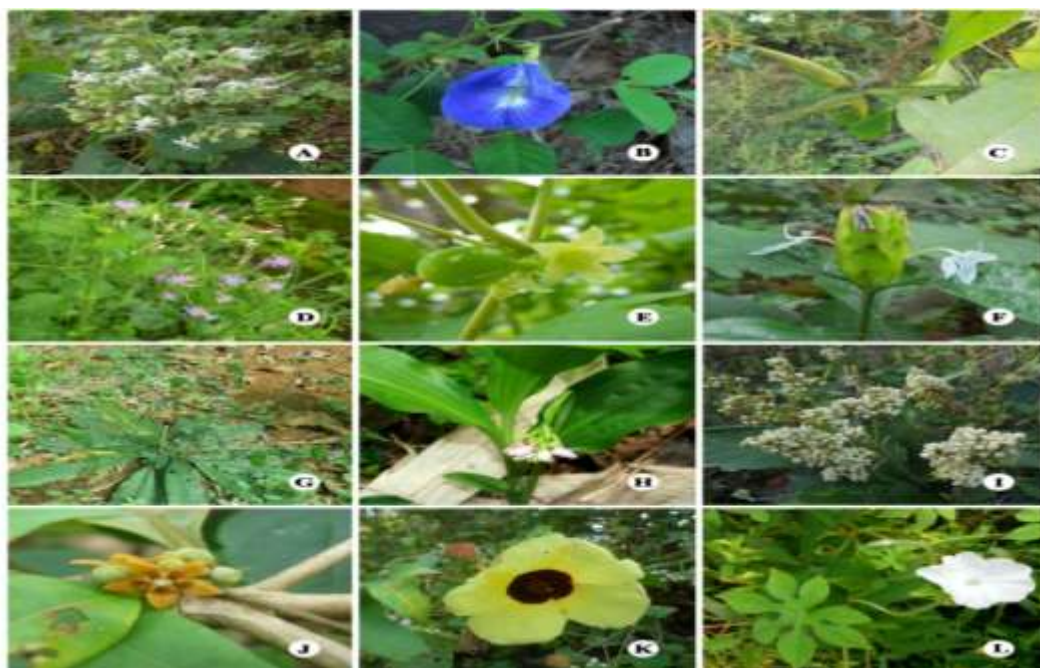
Figure 3:- Colour photographs of species. A. Clerodendrum infortunatum ; B. Clitoria ternatea ; C. Cryptolepis buchananii ; D. Cyathillium cinereum ; E. Diplocyclos palmatus ; F. Ecbolium viride ; G. Elephantopus scaber ; H. Geodorum densiflorum ; I. Glycosmis pentaphylla ; J. Hemidesmus indicus ; K. Hibiscus hispidissmus ; L. Ipomoea pes-tigridis .