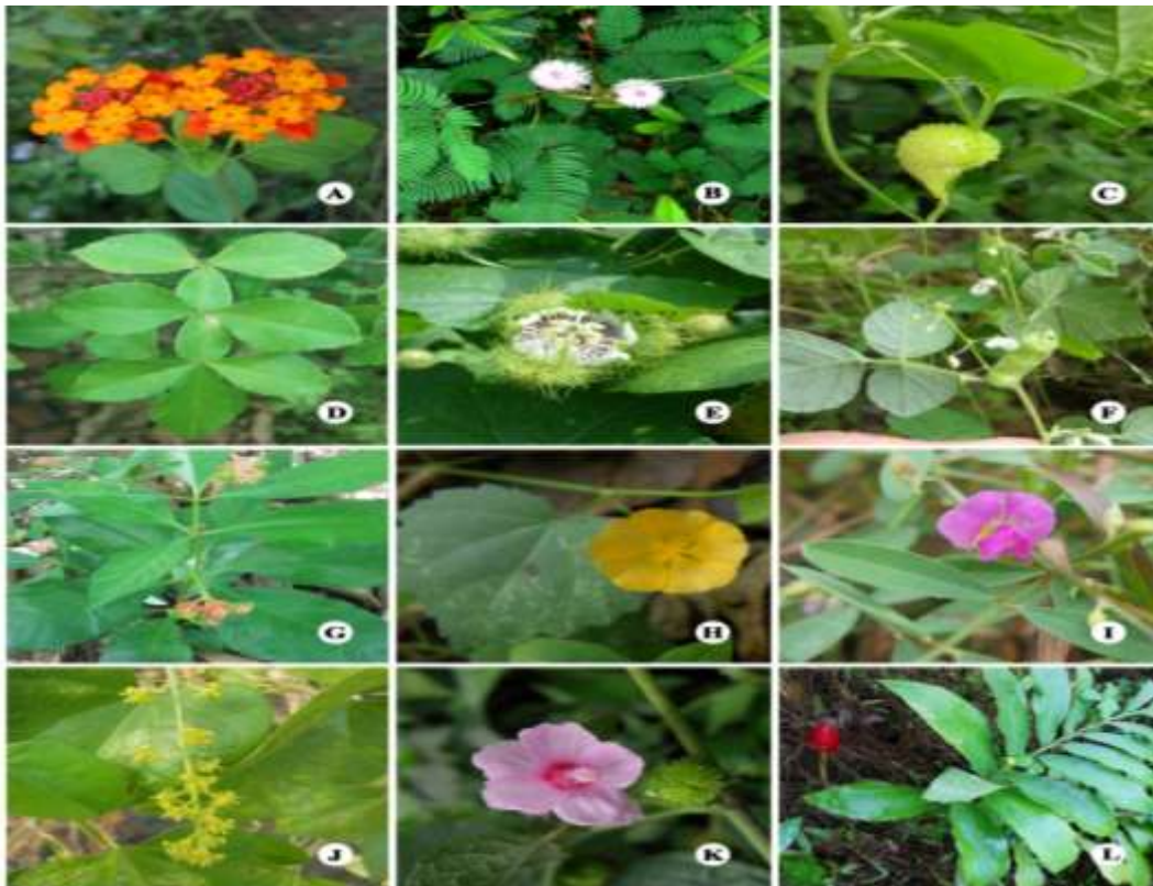
Figure 4:- Colour photographs of species. A. Lantana camara ; B. Mimosa pudica ; C. Momordica dioica ; D. Naregamia alata ; E. Passiflora foetida ; F. Pseudarthria viscida ; G. Rauvolfia serpentina ; H. Sida cordata ; I. Tephrosia purpurea ; J. Tinospora cordifolia ; K. Urena lobata ; L. Zingiber zerumbet .