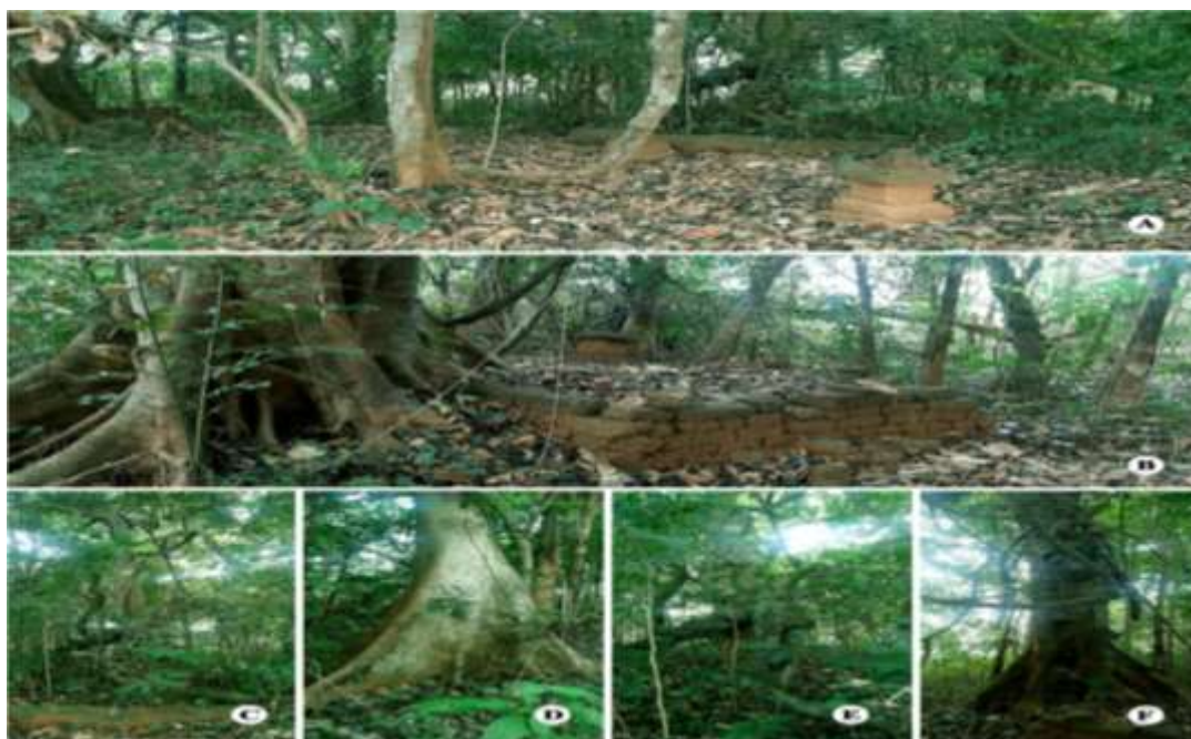
Figure 1:- Sreedharan Chumarath Mana Sacred grove. A.- F. Different views of interior region.