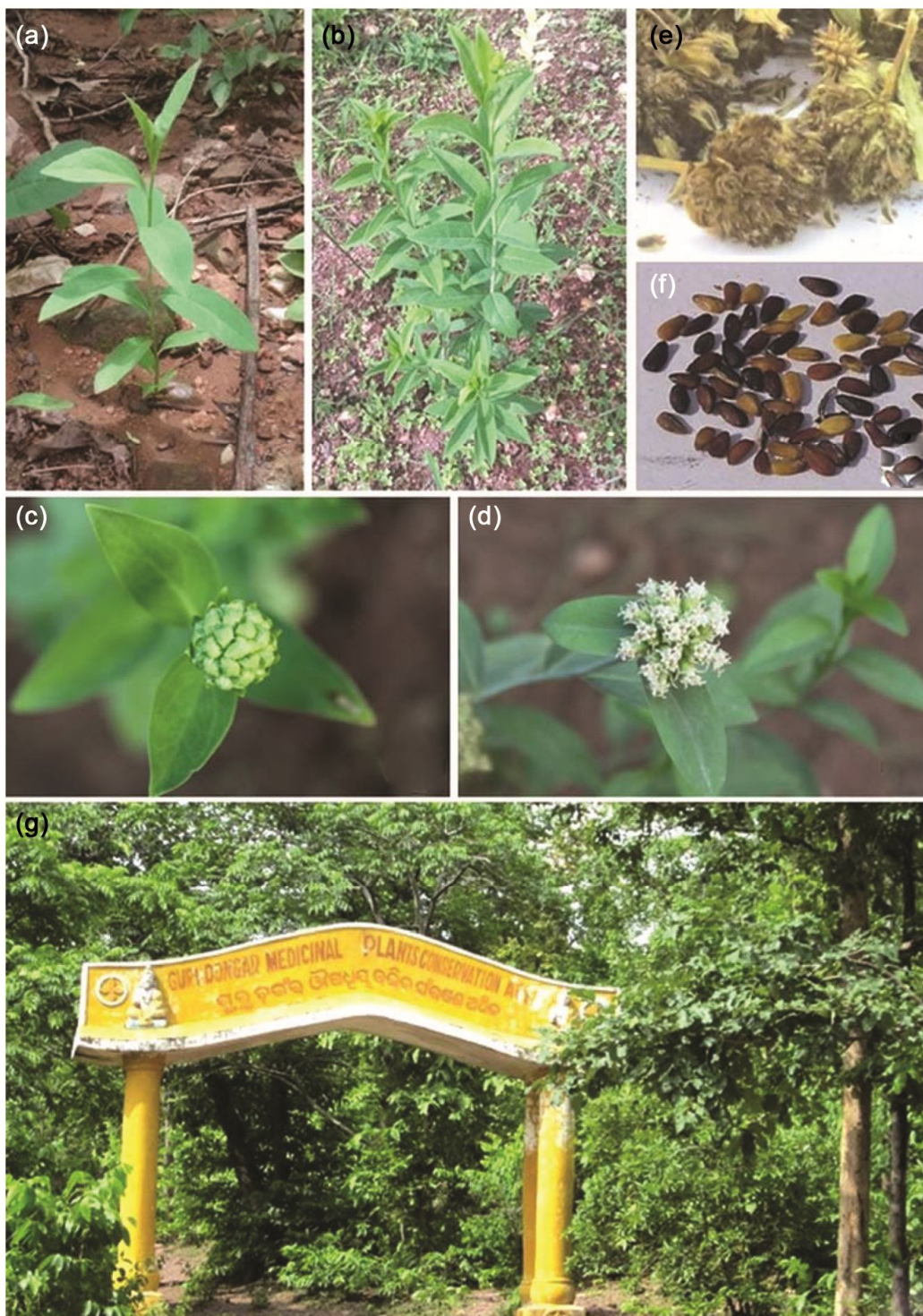
Fig. 1 — Blepharispermum subsessile (a) a seedling plant in forest floor, (b) a mature plant with multiple branches arising from root stock, (c) flower head before opening of florets, (d) flower head with florets, (e) mature heads, (f) seeds, (g) entrance gate of Gurudongar Medicinal Plant Conservation Area (MPCA), Odisha, India.

dimethylchromene; desmethylisoencecalin; 5-hydroxy-6-acetyl-2-hydroxymethyl-2-methylchromene; (-)-artemesinol] as well as a known chromene,