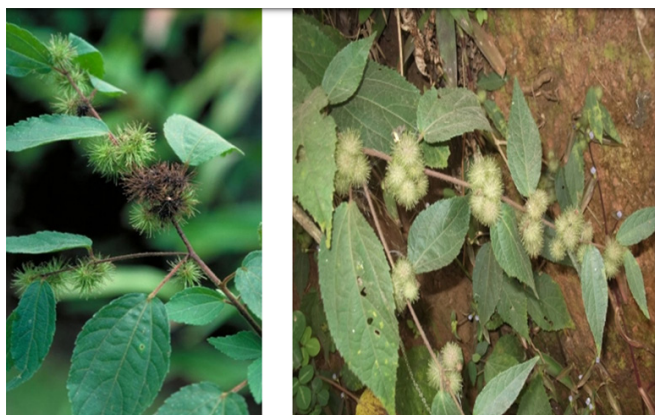
Figure 2: Ripening fruits and fruiting stem of Triumfetta pilosa plant.

Figure 2 indicates Triumfetta pilosa plant fruits (ripened) and fruiting stem which has been utilized for the treatment of various health ailments.