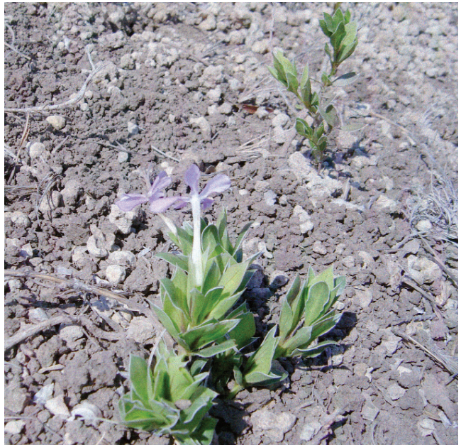
Figure 4: Shed corolla in B. argillicola promoting contact between anthers and stigma