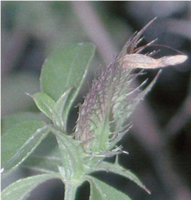
Figure 5: Barleria saxatilis cleistogamous flower, in which self-fertilisation occurs in the unopened flower, in the greenhouse

the occurrence of two different floral displays in B. argillicola to determine if there will be any differences in flowers in which both anthers and stigma are at the same level, and those in which the stigmas are above the anthers using one way ANOVA. Results revealed significant differences ( P = 0.016 ) in flower size ( n = 38 ) with more variance in flowers in which stigmas are above anthers (21.728) compared to 4.589 of flowers in which both anthers and stigmas are at the same level. However, there was no significant difference ( P = 0.775 ) in corolla tube length ( n = 38 ). Thus flower size but not corolla tube length could be used to differentiate between different floral displays in B. argillicola , with flowers in which both the anthers and stigmas are at the same level having smaller flower size (than the ones in which anthers and stigmas are spatially separated).