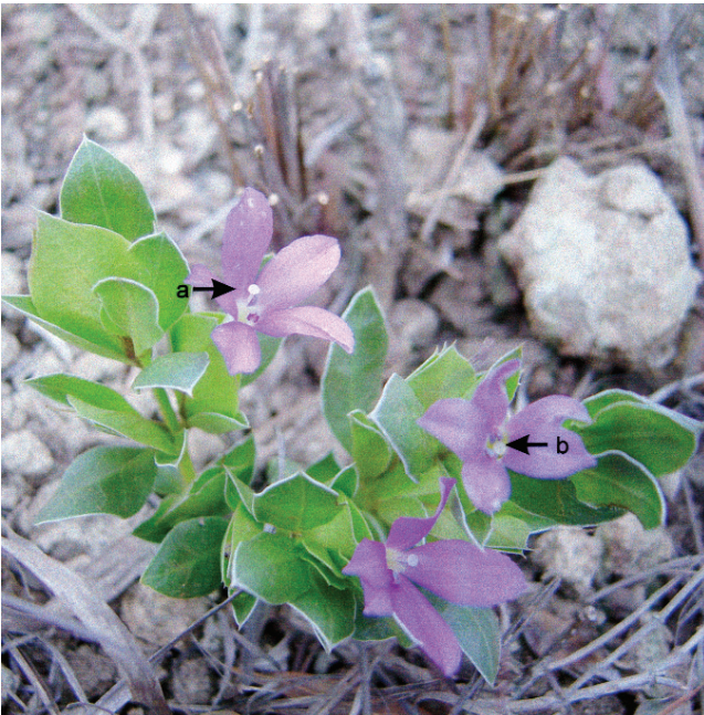
Figure 3: Barleria argillicola flowers in which the anthers and stigma are at different levels (a) and anthers and stigma at the same level (b)