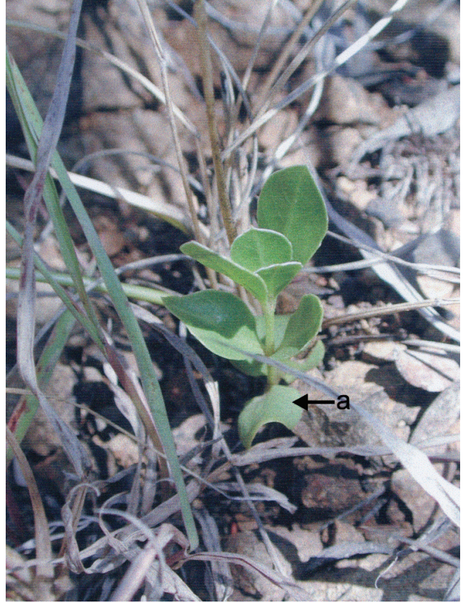
Figure 2: Seedling amongst plants in Population 3 of B. argillicola ; cotyledon (a)