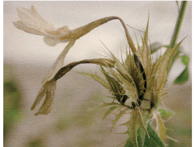
Figure 6: Barleria saxatilis chasmogamous flowers below which fruits are developing despite pollinators being excluded from the phytotron

In a review of 38 studies that directly compare the ecological and demographic attributes of a rare species with those of a closely related more common species, little consistency and almost no comparability among studies was found (Bevill and Louda 1999). For example, of 71 response variables compared between rare species and their common relatives, 60 (85%) were reported in less than four comparisons. Only seven variables (10%) were reported in more than four of the 38 comparisons: pollination biology, seed set, seed size, seed bank, competitive ability, phenotypic variation and genetic variation. These comparisons suggest that a set of variables should be collected, and should include parameters critical in determining and comparing changes in population size and persistence, specially birth and death rates (Bevill and Louda 1999). Fielder (1987) indicated that differences in density and distribution might be intrinsic and species-specific. Alternatively, density and dis-