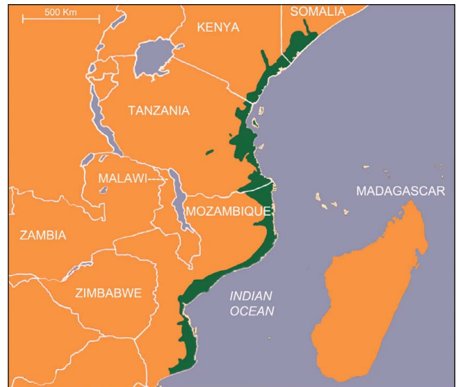
Figure 1 – Area with coastal forests in Eastern Africa (adapted from Burgess et al. 2004b).

More recently, on the basis of species richness and composition, Clarke (1998) has split White's Zanzibar–Inhambane