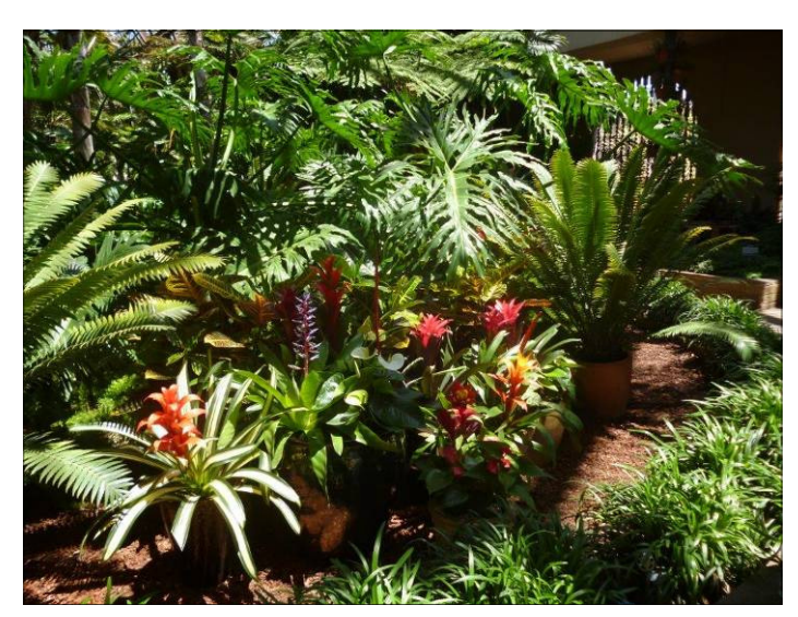
Balboa Park tropical house.