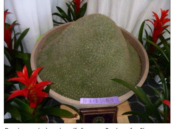
Deuterocohnia brevifolia - Best of Show - Horticulture.

in 1981 and has spent more than half her life on these plants and bromeliads too. She mentioned how she is