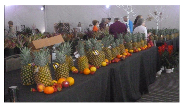
Pineapples galore used as a room divider.