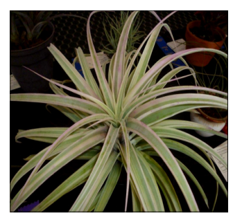
Tillandsia capitata variegata - Award of Merit