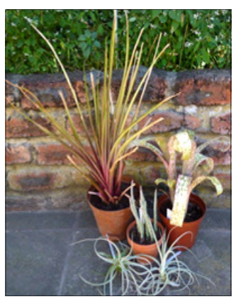
My purchases from the sales tent and auction.