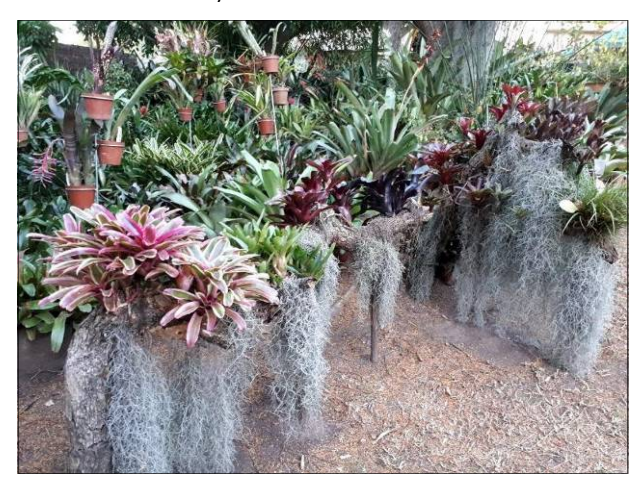
Horizontal branches, laden with clumps of mounted Neoreaelia varieties.

feature nice mounted Neoregelia horizontal branches in the front garden. - [ have watched them develop over the last few years, they are really looking stunning right now, getting just the right amount of light and development of pups to make a pleasing display. Pete's 'squatter