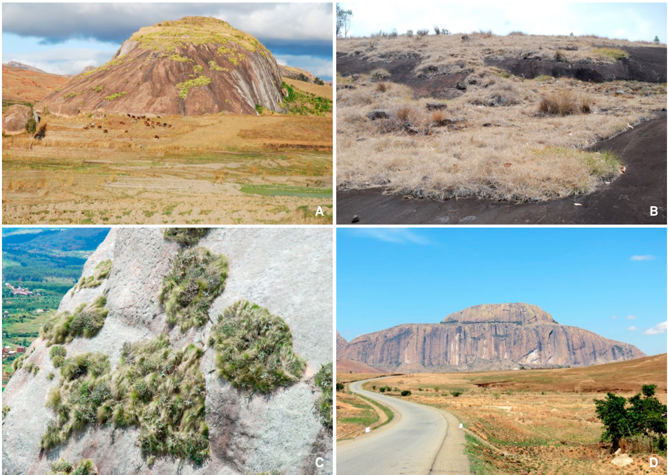
Fig. 6. – A. Inselberg, south of Anja Park (Tangorika) covered with Furcraea foetida (L.) Haw. (Asparagaceae); B. Mat with Styppeiochloa hitchcockii (A. Camus) Cope (Poaceae) near Angavokely; C. Mats formed by Coleochloa setifera (Ridl.) Gilly (Cyperaceae) and steep slopes, south of Fianarantsoa; D. General overview of "Bonnet du Pape, at Voatavo (Fig. 3: n° 26).

exceptions include those within certain National Parks such as Andringitra and Marojejy. In unprotected areas globally, inselbergs often support the last remnants of natural vegetation in a given area. While certain types of human use of inselbergs have occurred for generations and do not seem to have caused severe damage, in recent times human impact appears to have become by far more destructive resulting in steadily growing pressure on these areas, and today most inselbergs in Madagascar exhibit detrimental human impacts. These include: the over-collection of certain useful species which impacts local populations or even threatens local endemics with extinction; use of inselbergs for grazing cattle and goats; uncontrolled bush-fires, usually resulting from the widespread burning of grasslands for agriculture, that may significantly impact the population of individual species and which are also responsible for habitat degradation or destruction as a whole (see WHITMAN et al., 2011 for a study of the influence of fire and water availability