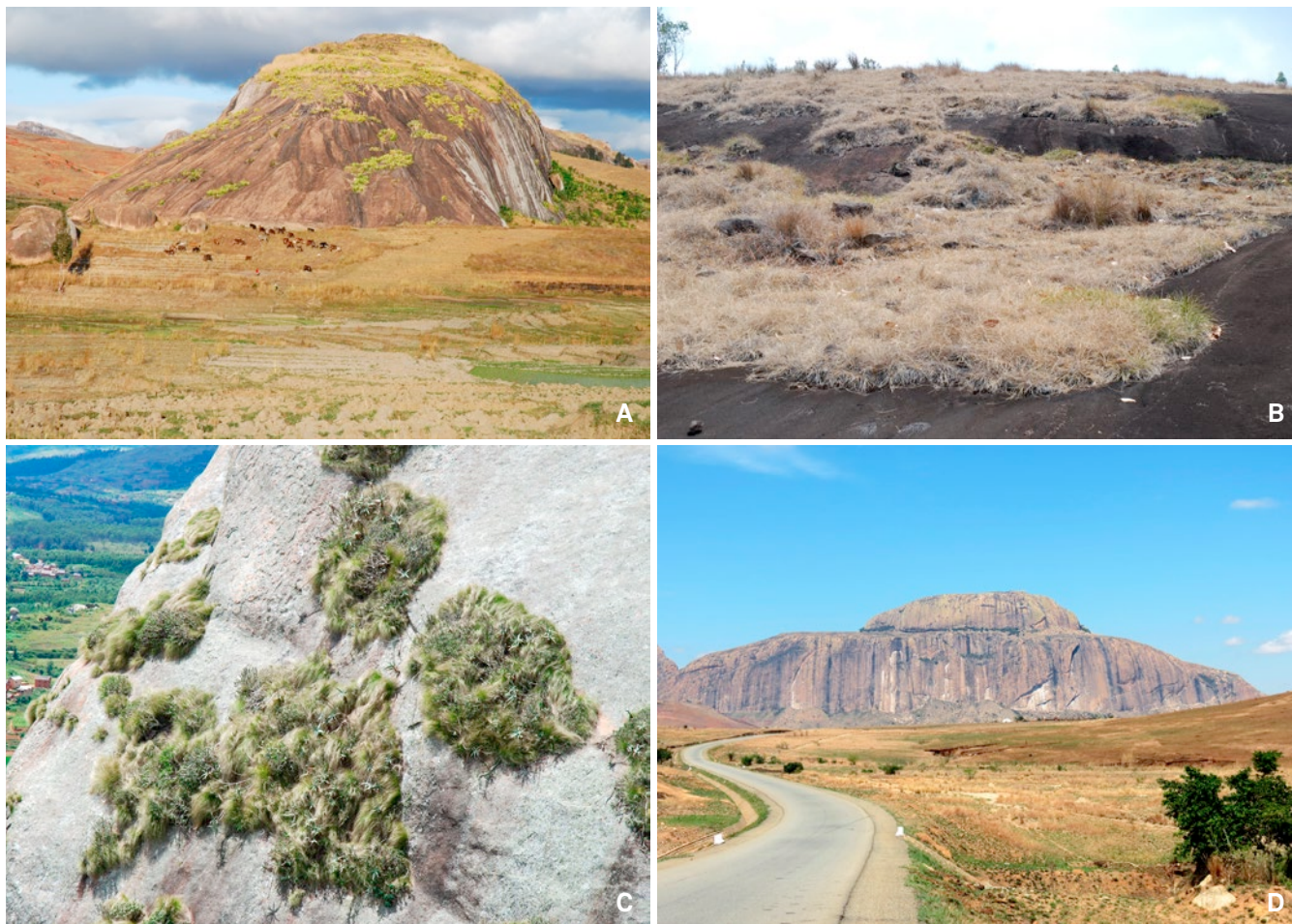
Fig. 6. – A. Inselberg, south of Anja Park (Tangorika) covered with Furcraea foetida (L.) Haw. (Asparagaceae); B. Mat with Styppeiochloa hitchcockii (A. Camus) Cope (Poaceae) near Angavokely; C. Mats formed by Coleochloa setifera (Ridl.) Gilly (Cyperaceae) and steep slopes, south of Fianarantsoa; D. General overview of “Bonnet du Pape, at Voatavo (Fig. 3: n° 26).

exceptions include those within certain National Parks such as Andringitra and Marojejy. In unprotected areas globally, inselbergs often support the last remnants of natural vegetation in a given area. While certain types of human use of inselbergs have occurred for generations and do not seem to have caused severe damage, in recent times human impact appears to have become by far more destructive resulting in steadily growing pressure on these areas, and today most inselbergs in Madagascar exhibit detrimental human impacts. These include: the over-collection of certain useful species which impacts local populations or even threatens local endemics with extinction; use of inselbergs for grazing cattle and goats; uncontrolled bush-fires, usually resulting from the widespread burning of grasslands for agriculture, that may significantly impact the population of individual species and which are also responsible for habitat degradation or destruction as a whole (see WHITMAN et al., 2011 for a study of the influence of fire and water availability