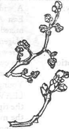
male and female flower spikes