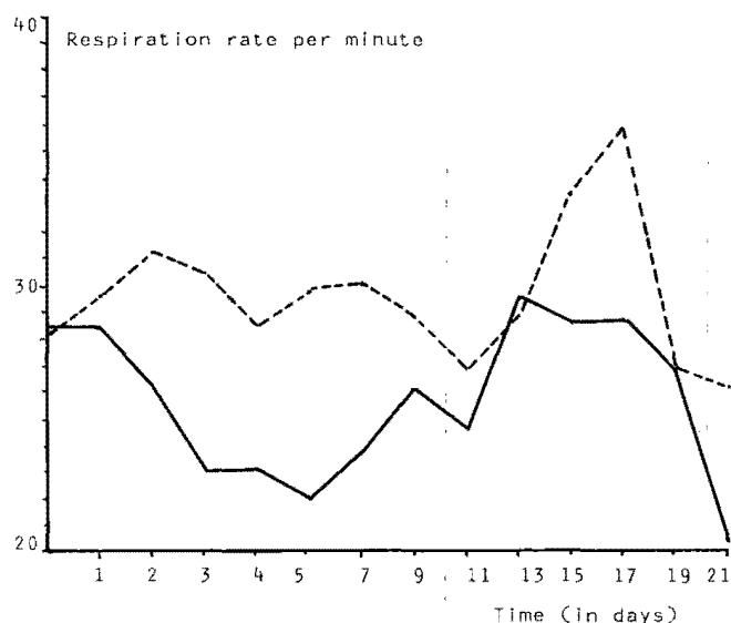
Fig. 3 : Respiration rate per minute in goats during the chronic intoxication with T. yototacolla at a rate of 100 mg/kg liveweight daily for three weeks. Control ---- Treated —.

slightly lower for treated ones in most of the days and finally had shown significant lowering (Fig. 2) (mean for treated = 25.5 \pm mean for control = 29.5). There is a slightly decrease of rectal temperature for treated ones at the beginning of the experiment (significant at P < 0.05 ) but the difference is not significant after one week (mean of treated = 39.07^\circ\text{C} – mean for control = 39.35^\circ\text{C} ) (Fig. 3).