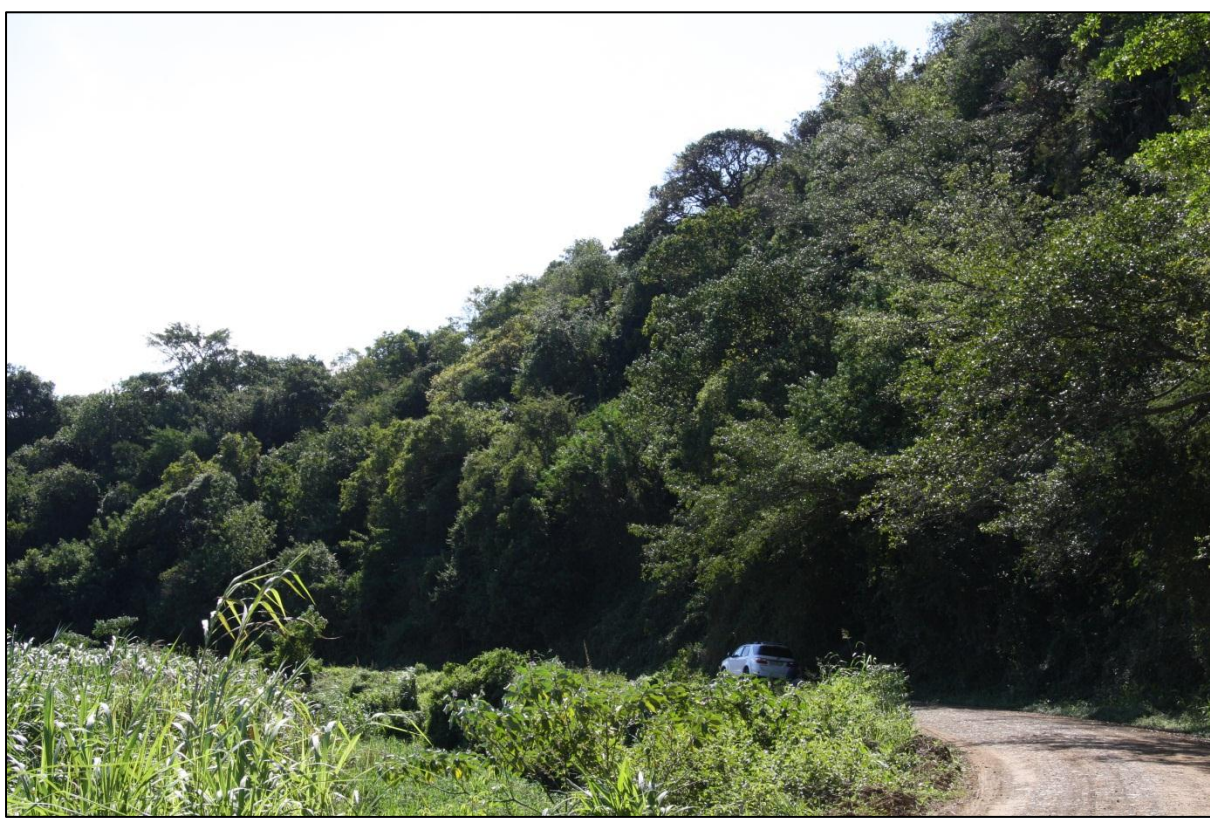
Plate 14. The forest area which is less steep and has higher levels of aliens that the steepest sections.

fall or a runaway fire that has been able to penetrate through the ecotone and enter the core of the forest. The other area which exhibits higher levels of alien invasive species occupies the most western portion of the forest which is less steep and thus the receiving environment is likely more susceptible to invasion as the conditions are more suited to alien invasive species. Alien species are well adapted to respond rapidly to any changes in the immediate environment.