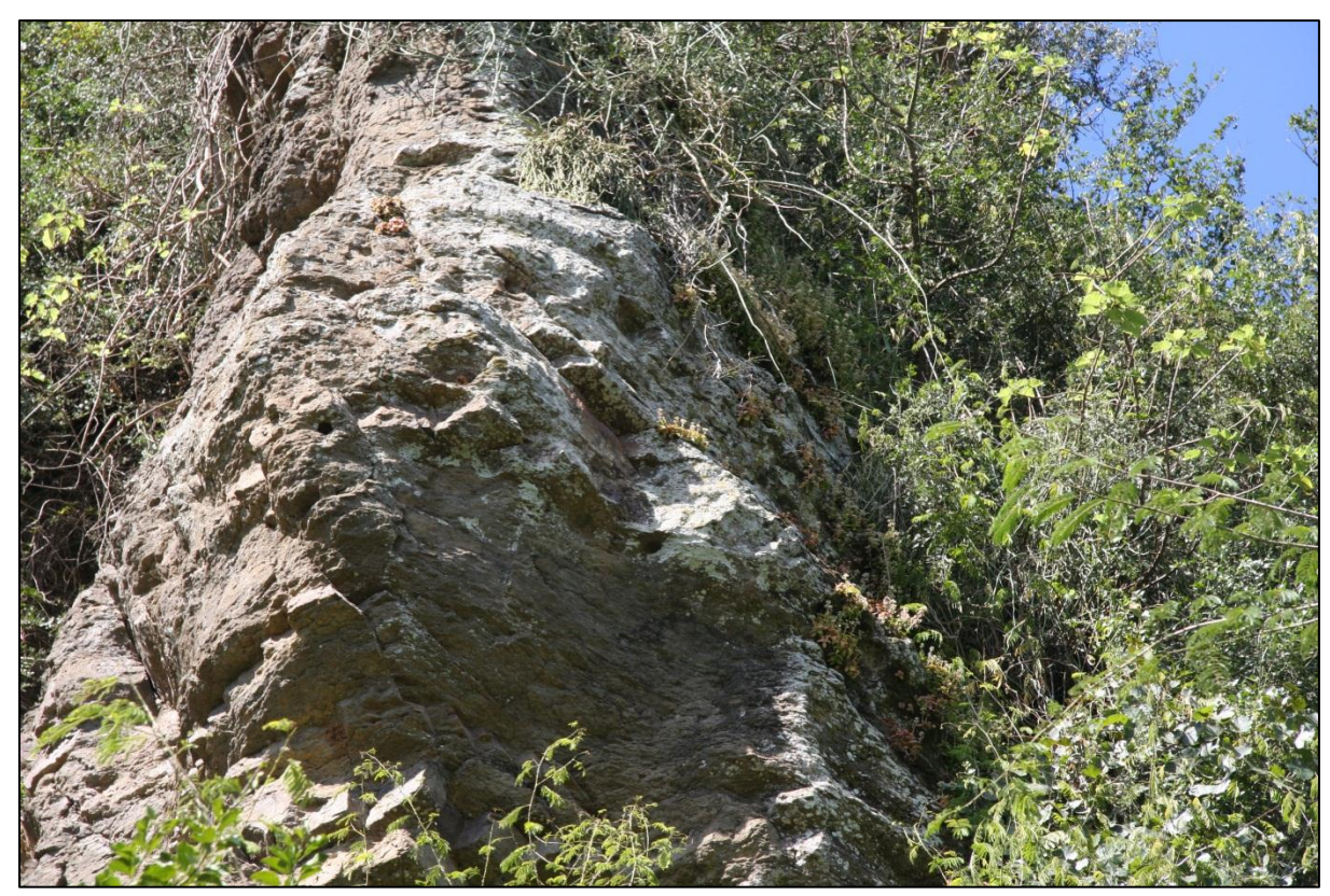
Plate 17. Typical exposed cliff face on which C. foveata was growing.

In terms of the under-storey numerous woody herbaceous plant species, creepers and herbaceous plants were quite common. The following notable species were seen; Petopentia natalensis, Dietes iridoides, Dicliptera heterostegia, Justicia campylostemon and Justicia petiolaris . In many portions across the steeper portions of the area Acacia schweinfurthii (a creeping Acacia species) was prevalent and should be considered as an indigenous invasive species which is capable of smothering trees and diminish the diversity and conservation significance of these areas.