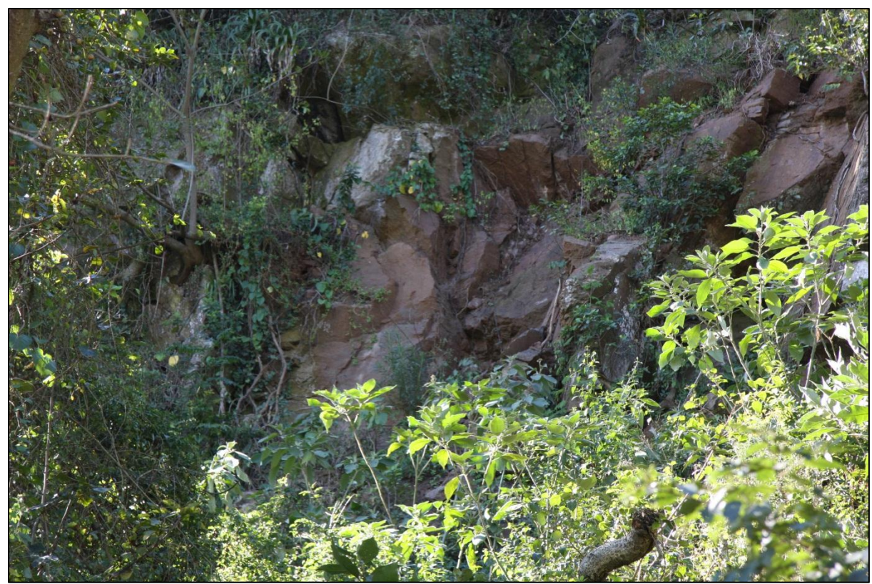
Plate 1. Issues around the ability to sample areas due to the sheer rock faces encountered and the scree slopes.

The vegetation that was sampled on site was typical of the vegetation that would be expected to occur on Dwyka Tillite soils, in particular dry steep and incised valley lines, which are often associated with rock faced cliffs. The vegetation for the most part in these areas remains relatively undisturbed as the accessibility onto these areas is highly restricted ( Plate 1 ). The receiving environment is also considered to be quite hostile for the establishment of plants which have not evolved to fill these niche environments. The soils are shallow and nutrient poor as they are recently derived from rock, the steep slopes don't support the development of any organic material layer for the sustained development of the vegetation. Further these areas were never transformed and therefore the plant species assemblage is relatively old with many large and well established trees. Portions of these areas remain relatively pristine, with the understory complementing the woody and shrubby vegetation component, but in other areas the under-storey is highly invaded by alien plant species.