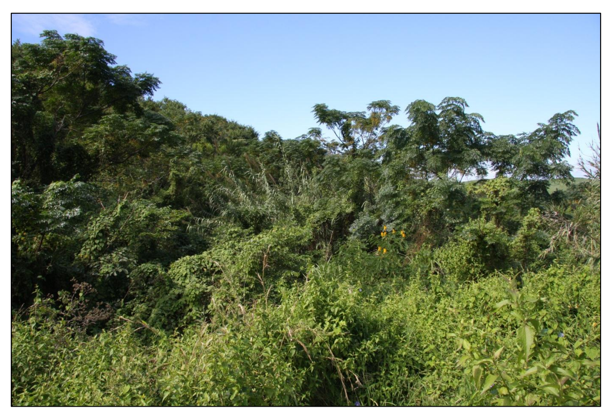
Plate 11. Typical view of the upper portion of the HGM Unit 3 vegetation assemblage.

The vegetation is generally dominated by alien invasive species. A number of indigenous species are present however; they are limited in their abundances and will not be of a significant quantity to form the basis for any rehabilitation process. The most commonly occurring indigenous species were Bridelia micrantha , Ficus natalensis and Protorhus longifolia . Less prevalent but tree species that were recorded were Apodytes dimidiata , Searsia chirindensis , Trema orientalis Ficus sur and Syzygium cordatum . One individual of Strychnos usambarensis was recorded. The remainder of the vegetation is dominated by Melia azedarach , Schinus terebinthifolius , Litsea glutinosa and Solanum mauritianum . The following species are abundant but not dominant; Leucaena leucocephala , Senna bicapsularis , Senna didymobotrya , Schinus terebinthifolius , Tithonia diversifolia , Montanoa hibiscifolia , Agave sisalana and Musa cultivar.