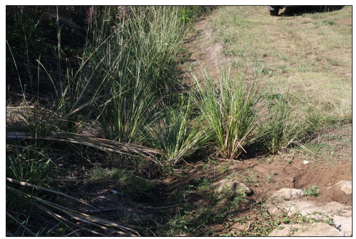
Plate 9. Chrysopogon zizanioides utilised to stabilise soils and collect dissolved particulate matter.

As one moves down the HGM Unit it becomes more canalized and has steep sided slopes associated with it. In these areas the woody vegetation is more dominant. The most prevalent species are alien invasive species most notably, Schinus terebinthifolius, Morus alba, Sesbania bispinosa, Psidium guajava and Melia azedarach . Very limited indigenous woody species were encountered along the riparian corridor. However, where the slopes adjacent the riparian zone were too steep to receive agriculture indigenous woody vegetation was more common. However, where the HGM Unit was highly incised and bank stabilization was required, Bamboo had been planted to protect the banks.