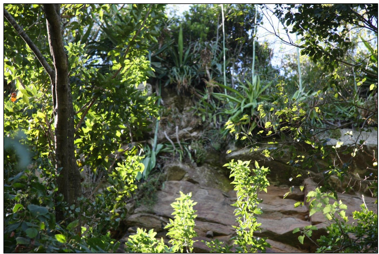
Plate 13. Xeric Riverine Thicket with Scarp Forest elements.

The vegetation in this area is classed from high quality undisturbed Scarp Forest with Xeric Riverine Thicket elements Plate 13 ) to relatively transformed vegetation ( Plate 14 ) which still exhibits elements of its former categorization. Finally an area, which bisects the woody vegetation which is dominated by alien invasive species ( Plate 15 ), retaining limited indigenous species.