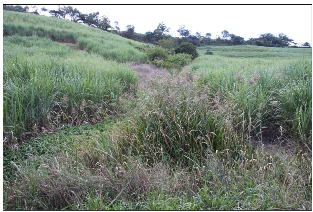
Plate 2. More Open and less woody wetland system at the head of a catchment. Sedges and Graminoid species are dominant. Note the isolated pocket of alien woody vegetation in the background, comprised predominantly of Schinus terebinthifolius .