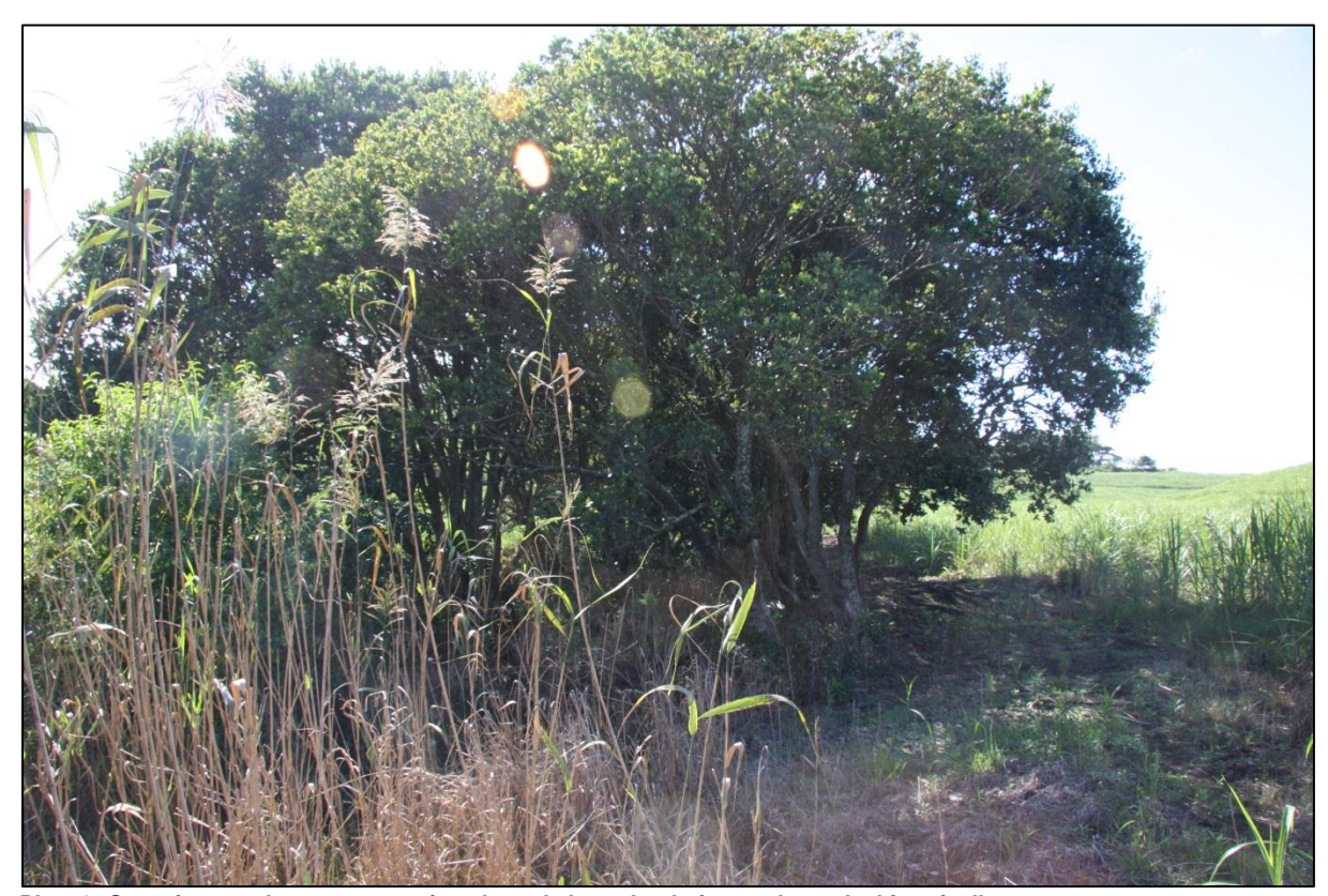
Plate 3. Syzygium cordatum tree species planted along the drainage channels, historically.