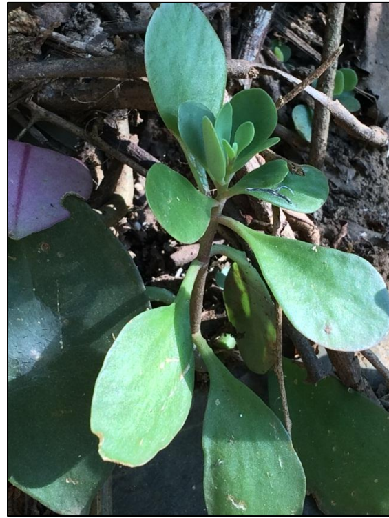
Plate 6. Haemanthus albiflos