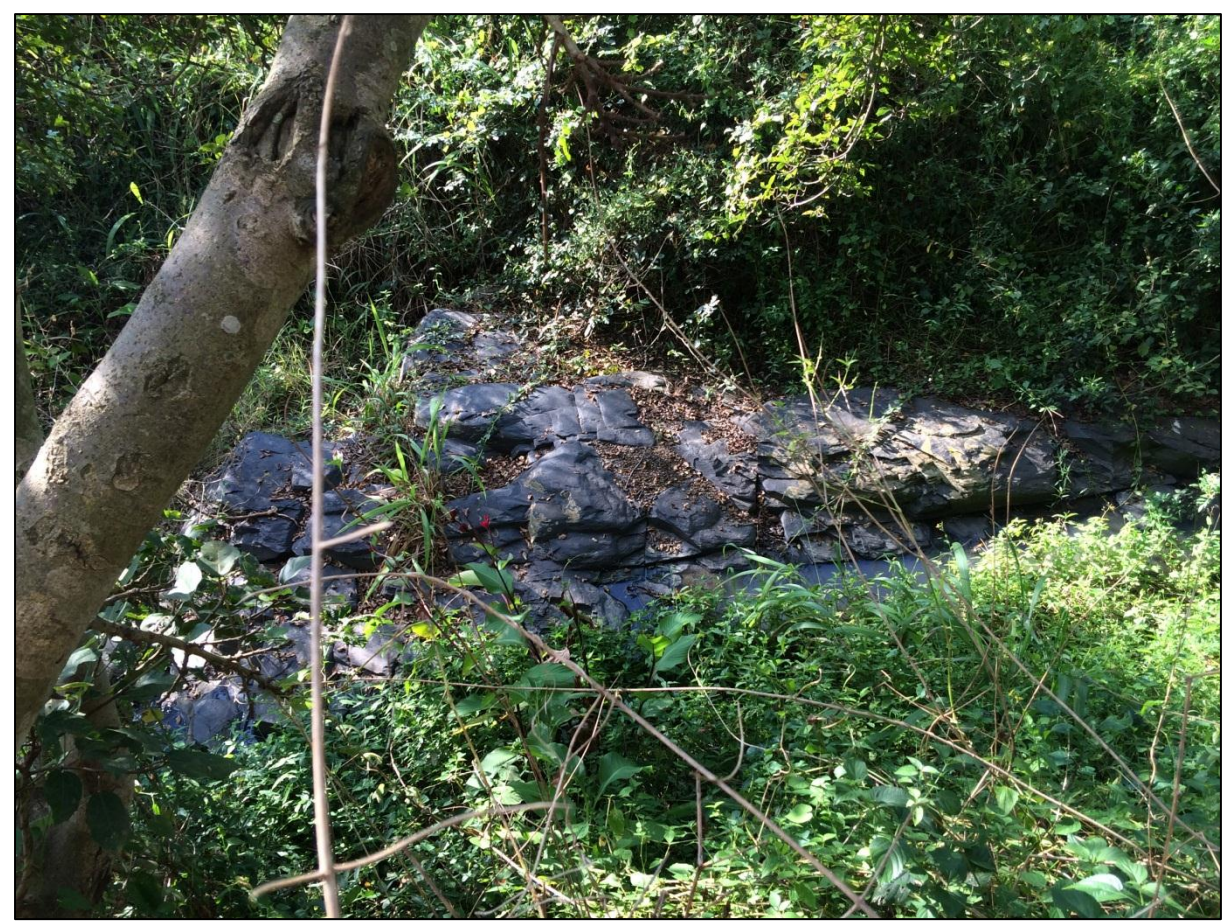
Plate 5. An igneous intrusion over which the stream flows, possibly Doleritic in nature.

As one approaches GPS PT. 335 (Map 2) the drainage line becomes far more canalized. In this area the drainage line is restricted to a rock shelve lined "stream" ( Plate 5 ). The vegetation reflected in this area is as a result of the steep slopes associated with the incised channel. The woody plant species have been able to relax the very defined and restricted boundary and expand outwards as a result of the inability for agriculture to be pursued on these slopes.