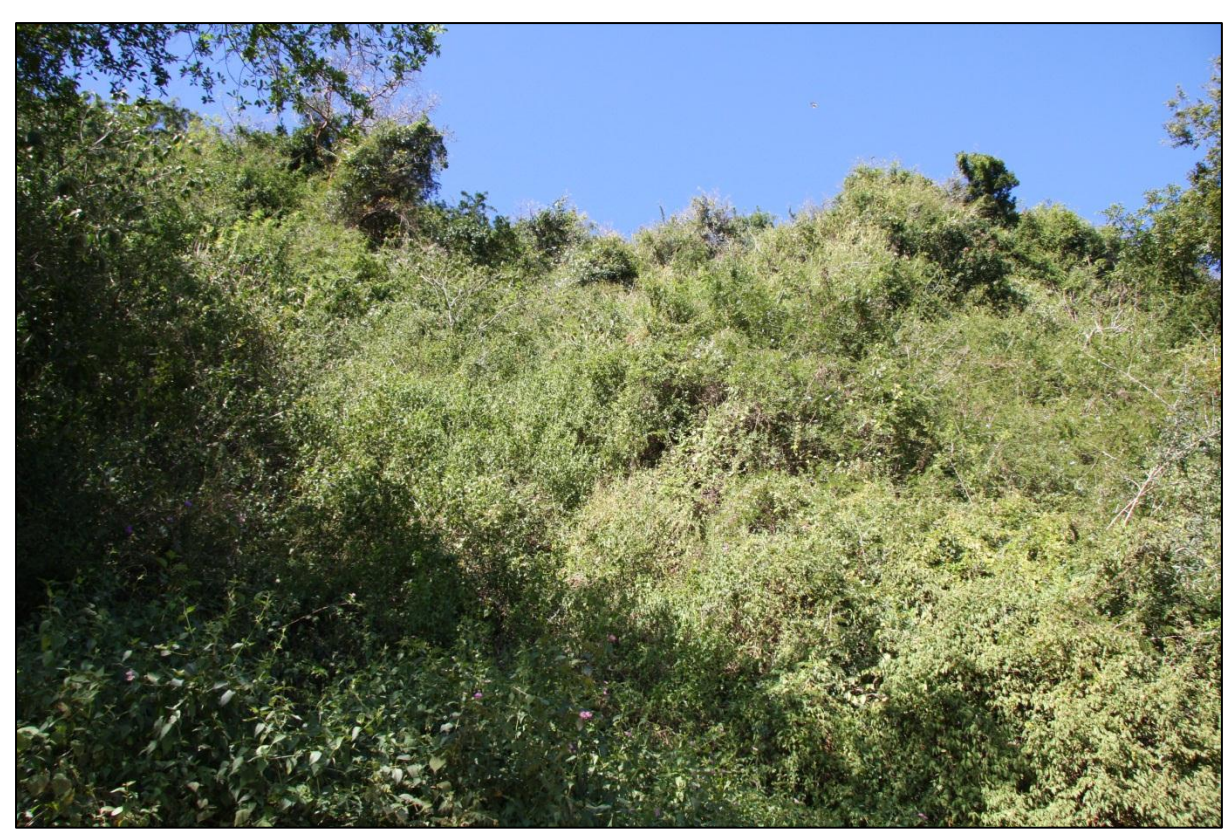
Plate 15. Alien vegetation that has established in an approximately 60 metre wide ribbon through the forest.