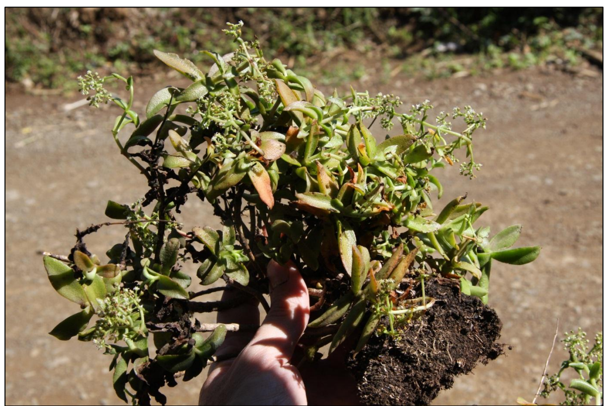
Plate 16. Crassula foveata found growing on Dwyka Tillite cliff faces.