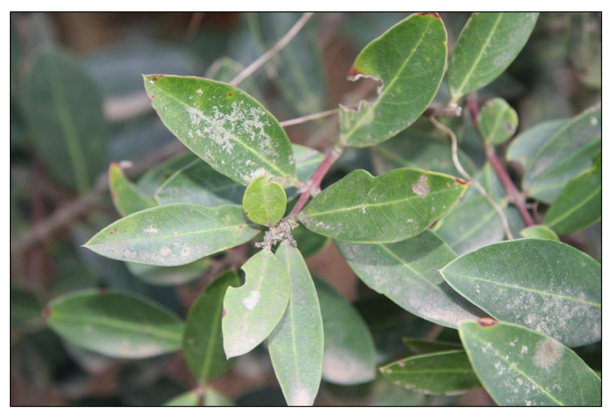
Plate 18. Acokanthera oppositifolia growing in amongst the other tree species.

Given this portion of the sites proximity to a relatively large road, litter and illegal dumping was prevalent. The impact of illegal dumping is significant particularly when it occurs within natural vegetation as it is often the facilitator for more dumping.