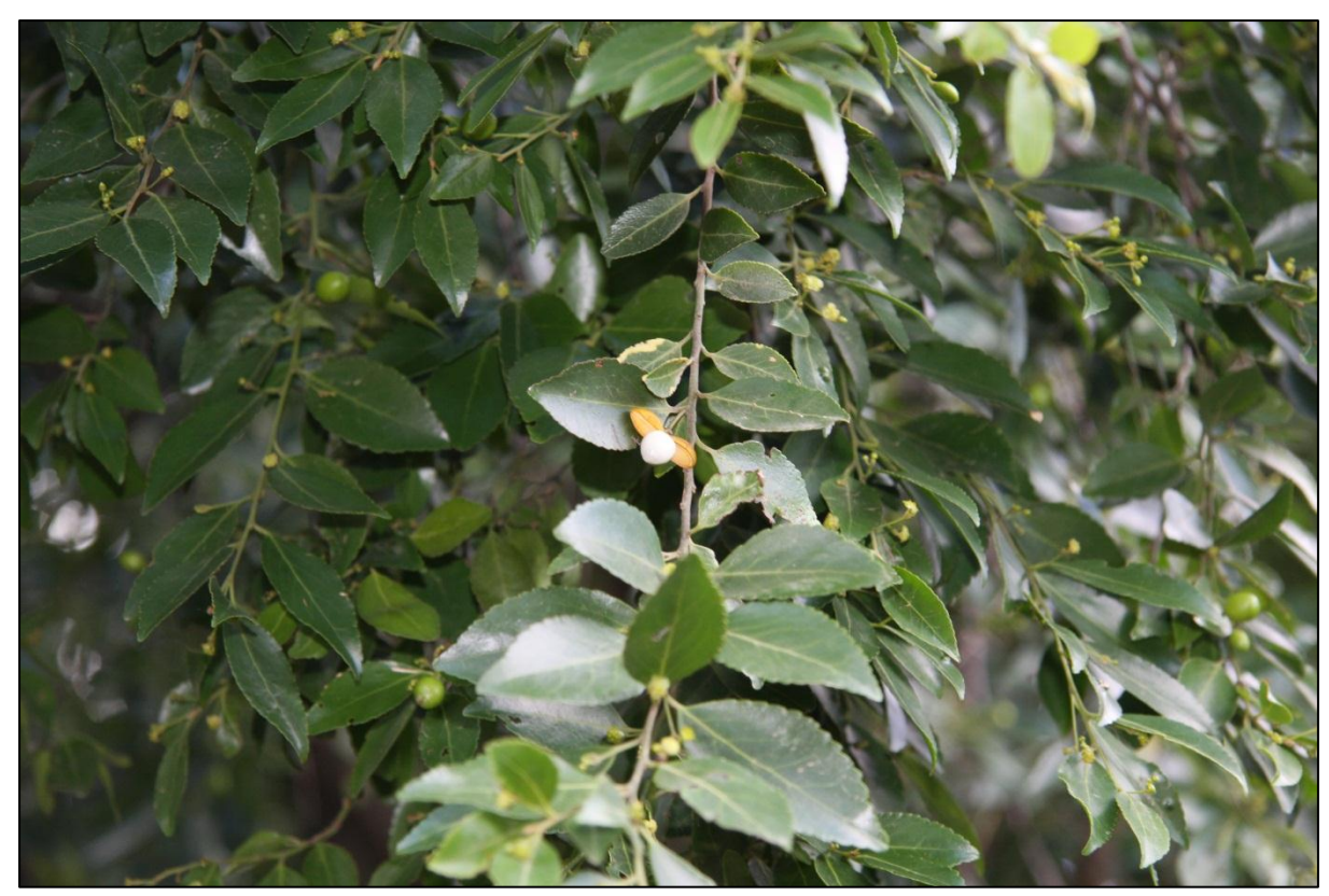
Plate 19. Maytenus peduncularis fruiting body.