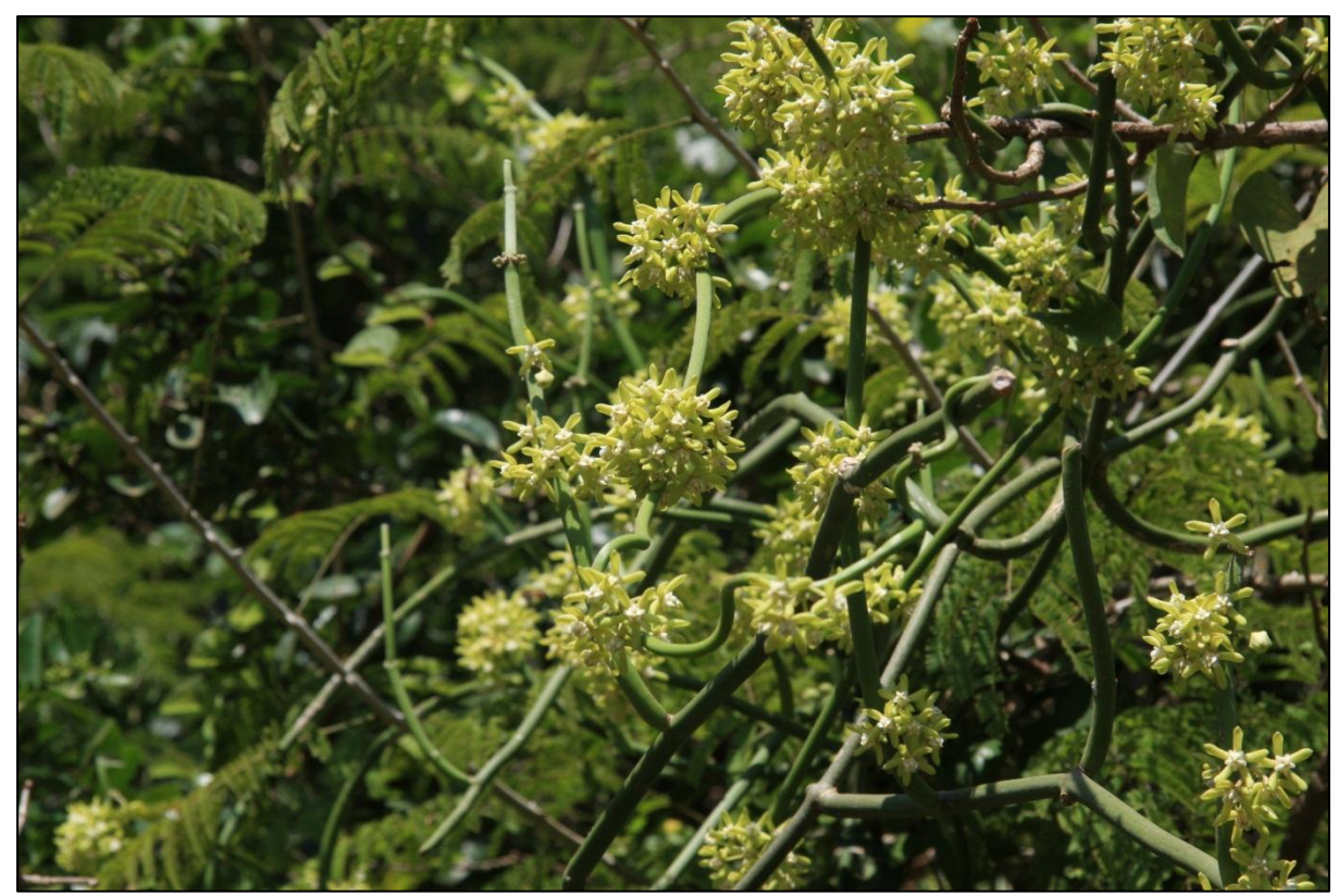
Plate 8. Sarcostemma viminale in flower.