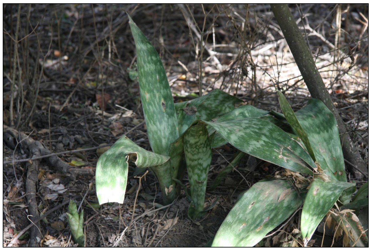
Plate 20. Sansevieria hyacinthoides (mother-inlaws-tongue).