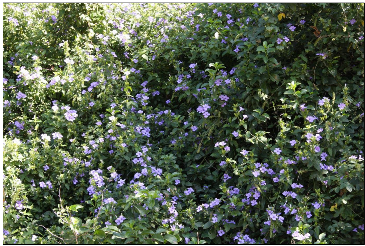
Plate 12. Barleria gueinzii growing and flowering in profusion.

unlike in areas where the canopy is denser was dominated by more woody herbs and shrubs. The most common species were Jasminum sp., Barleria gueinzii ( Plate 12 ), Pupalia lappacea, Asparagus laricinus , Rhinacanthus gracilis var. gracilis and Distephanus anisochaetoides .