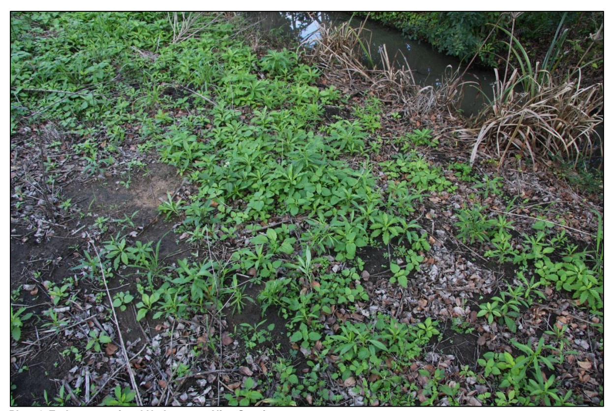
Plate 4. Early successional Herbaceous Alien Species.

The following indigenous species were encountered within the upper / northern section of the wetland system; Phoenix reclinata, Clerodendrum glabrum, Ficus sur, Erythrina lysistemon, Halleria lucida, Ficus burkei and Bridelia micrantha .