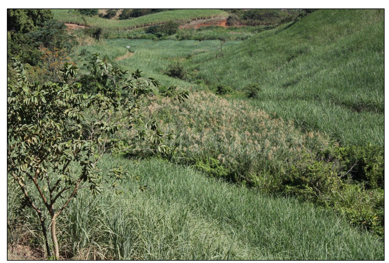
Plate 10. Wetland areas dominated by graminoid and sedge species, most notably Phragmites australis.

In terms of the indigenous vegetation and non-cultivated areas of the site, they separate from this point with the vegetation being restricted to the central incised channel of the HGM Unit and then to the steep sided slopes which are removed from the wetland area. In these areas the most common plant species are alien in nature, with Melia azedarach being abundant. To a lesser degree species such as Leucaena leucocephala, Arundo donax, Solanum mauritianum, Chromolaena odorata, Canna indica, Ricinus communis and Pisum guajava were also recorded in varying abundances. Two very large Syzygium cumini trees were recorded and are marked on Map 2 attached at Appendix 2 Where HGM Unit 2 feeds into the floodplain a small Barringtonia racemosa was recorded. This individual appears to have been planted, however this species is afforded protection under the National Forests Act.