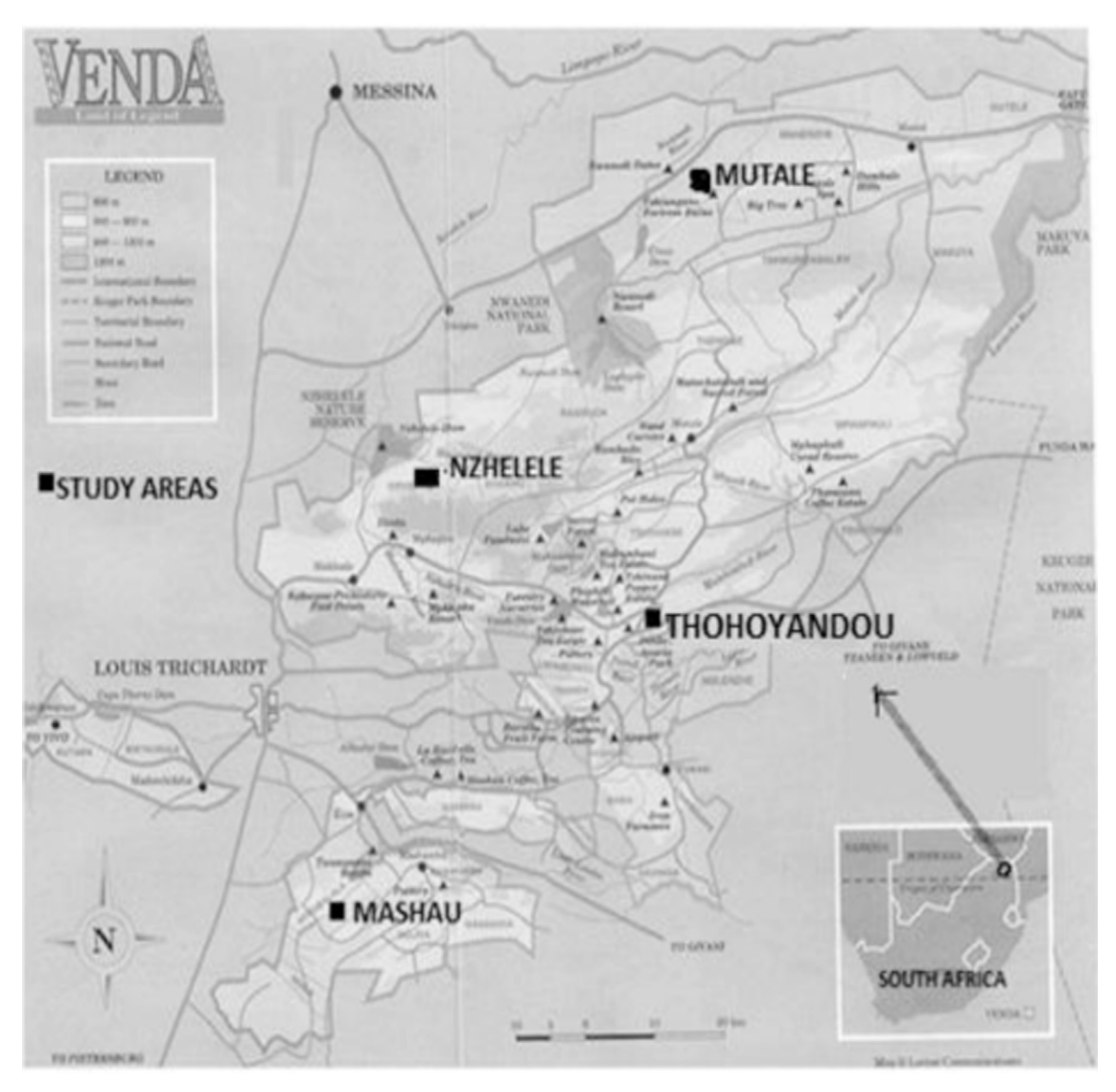
Fig. 1. Map of Venda region in Limpopo province, South Africa.

creamy white/red lesions on the angles of the mouth, tongue and also the palate, creamy white discharge and itching of genitals. We also showed pictures of patients suffering from the disease.