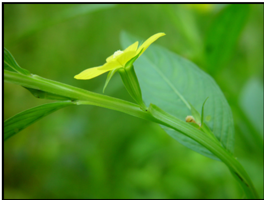
Ludwigia decurrens Walt. (Wing-Leaf Primrose-Willow)