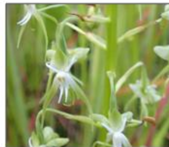
Sp.13 Habenaria sp.