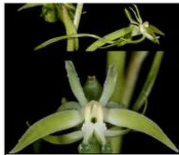
Sp.12 Habenaria humilior