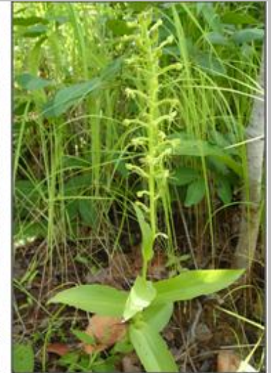
Sp.19 Habenaria sp.