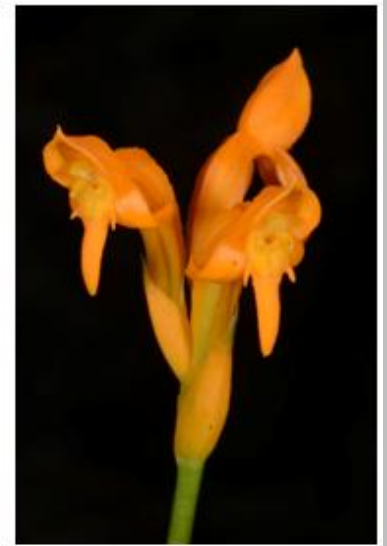
Sp.25 Platycoryne sp.