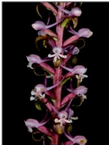
Sp.22 Satyrium anomalum