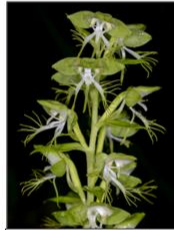
Sp. 8 Habenaria praestans var. umbrosa