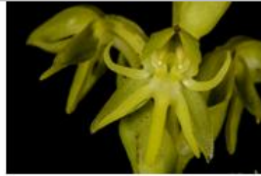
Sp.17 Habenaria sp.