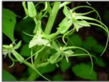
Sp.c Habenaria sp.