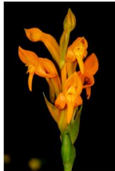
Sp.24 Platycoryne sp.