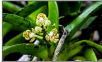
Sp.2 Acampe pachyglossa