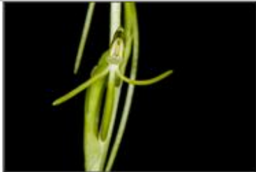
Sp.16 Habenaria filicornis