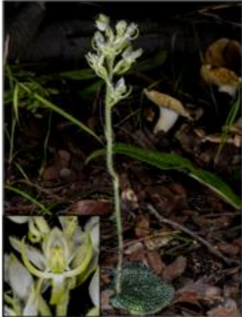
Sp.5 Habenaria leucotricha