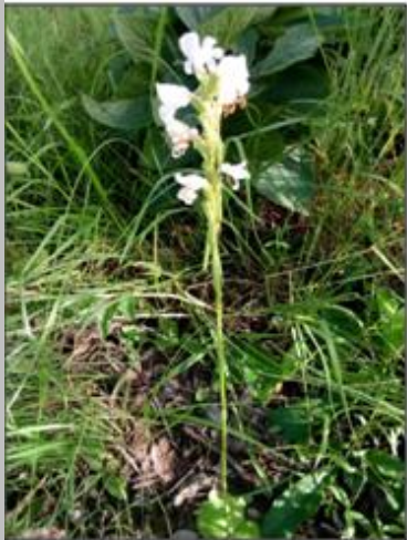
Sp.21 Satyrium sp.