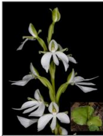
Sp.6 Habenaria debeerstiana