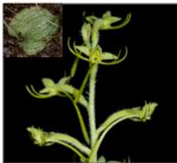
Sp.11 Habenaria pilosa