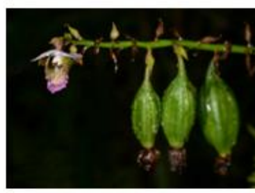
Sp.20 Eulophia horsfallii