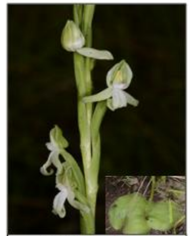
Sp.9 Habenaria sp.