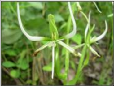
Sp.b Habenaria laurentii