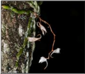
Sp.1 Microcoelia sp.