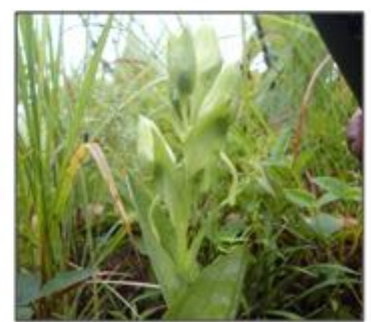
Sp.14 Habenaria sp.