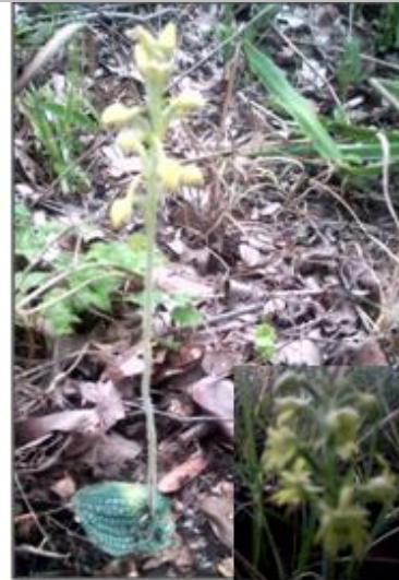
Sp.18 Habenaria sp.