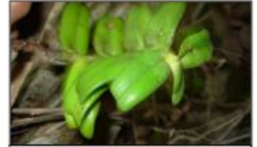
Sp. a Diaphanthe pulchella