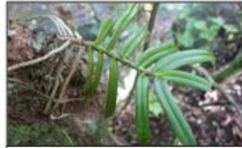
Sp.3 Calyptrochilum shabanensis