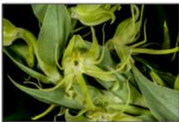
Sp.10 Habenaria sp.