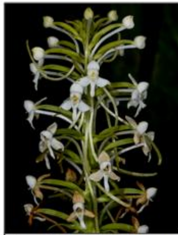
Sp.7 Habenaria zambesiana