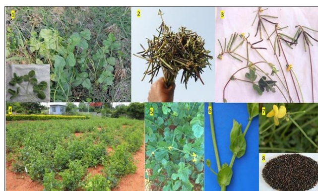
Plate 1: Vigna stipulacea in natural habitat (paddy field); inset: leaf variation; 2. Bunch of pods collected at exploration site; 3. Variation in pods and peduncle colour; 4. Crop in NBPGR experimental plot; 5. Close view of leaves, flowers and pods; 6. Stipule morphology; 7. Flower; 8. Seeds