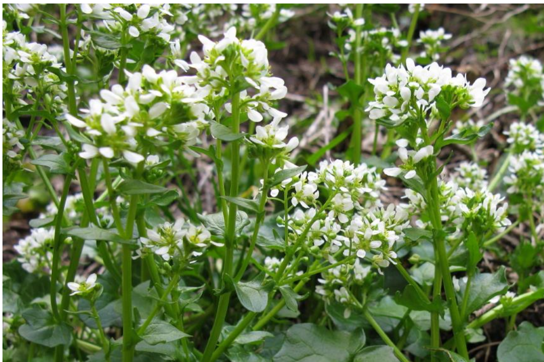
Cochlearia pyrenaica subsp. alpina at Cheddar Gorge (2009).