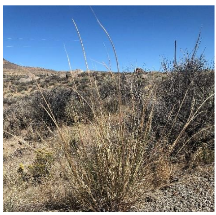
Sand dropseed.

Sand dropseed is an early successional, warm season grass commonly found growing on sandy to gravelly to loamy soils in the Intermountain West. It most commonly grows at lower elevations and dry coarse soils in the 7 to 12 inches annual precipitation zones. Sand dropseed has a low grazing preference by livestock and wildlife and is best utilized as winter forage when more palatable species are not available. This plant is a prolific seed producer. It can be used