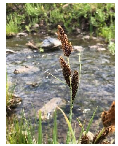
Nebraska sedge.

Water sedge is a medium sized, long-lived, perennial, moderately rhizomatous, native wetland plant found at mid to high elevations in saturated to shallow standing water conditions. It is adapted to moist loam to silt to sandy gravelly soils. Uses include food and cover for waterfowl and songbirds and increased biodiversity in