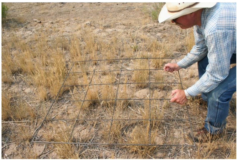
Figure 2. A density frame is used to measure plant density in a rangeland seeding.

Other needed management can include repair of fences and gates, and control of pests (weeds, grasshoppers, rabbits, rodents, etc.) as needed. Any control specified shall be in accordance with Pest Management (595). Additionally, stands not disturbed over long periods may become decadent, low in vigor, and accumulate excess plant residues (litter) resulting in poor stand health. Periodic treatment (every 5 to 7 years) including light tillage, mowing, prescribed burning or grazing is recommended.