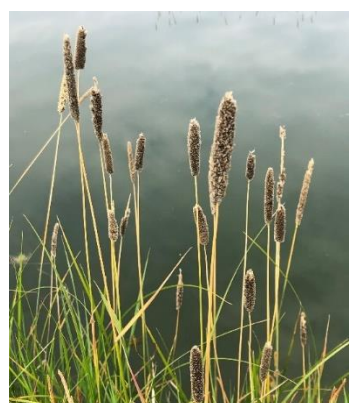
Creeping foxtail.

Creeping foxtail is a long-lived, cool-season, dense sod forming introduced grass that is adapted to wet, slightly saline, acidic and poorly drained sites with at least 18 inches annual precipitation. It has low seedling vigor, but once established spreads readily by rhizomes. It is palatable to all classes of livestock. Growth begins early in the spring. and leaves remain green until after hard frosts in the late fall. Creeping foxtail is very cold tolerant and can persist in areas where the frost-free period averages less than 30 days. It produces abundant, quality forage on wet sites (with proper fertility). It is usually superior to other wet area pasture grasses such as reed canarygrass and timothy. Creeping foxtail is similar in appearance to timothy, but seedheads are generally black and hairy. It can be invasive in wet areas. It is compatible with cicer milkvetch in a mixture. 'Garrison' and 'Retain' are well-adapted cultivars. The seed is very light and fluffy and difficult to plant without the use of cracked corn, rice hulls, or other carrier. The recommended full stand seeding rate is 3 lb/ac.