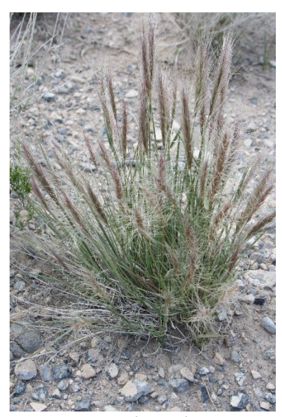
Bottlebrush squirreltail.