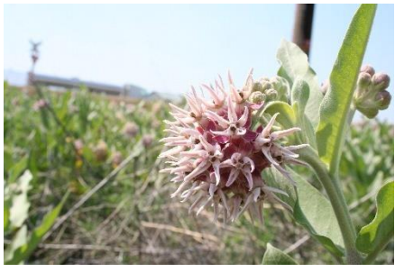
Showy milkweed.

Showy milkweed is a perennial native forb with erect to ascending stems common to field margins and disturbed areas receiving 16 to 30 inches annual precipitation. The flower is rose-purple with hoods elevated above the corolla in pink, aging yellow. Showy milkweed is host to a wide variety of butterflies and other insects including monarch butterflies which are specific to milkweeds. Plantings should be strictly limited to ungrazed pollinator habitat. Plants can be established by direct seeding or by transplanting nursery stock or rhizomes. Full stand seeding rate is 15 lb/ac.