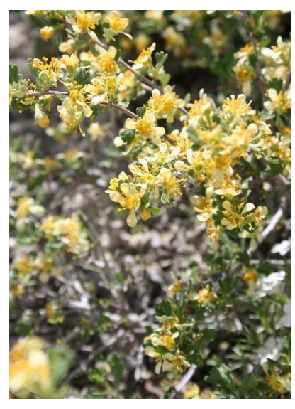
Antelope bitterbrush.

Apache plume is a native shrub 2 to 6 feet tall with grayish-white, pubescent branches, dark green leaves and white flowers. Fruit clusters with feathery, purplish tails said to resemble Apache headdress. In the Intermountain West it can be found growing in southern Utah and Nevada in areas receiving 8 to 20 inches annual precipitation and is adapted to gravelly, sandy soils on slopes, open woods and dry washes. It blooms from May to October. Establishment with nursery grown materials is recommended.