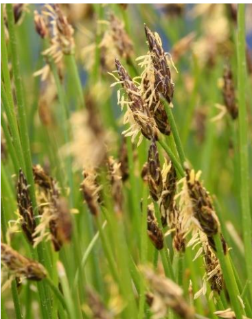
Creeping spikerush.

wetland communities. Due to poor seedling vigor, direct seeding usually results in marginal stands. Fluctuate water levels for establishment. Wildland seed collection and plug propagation for transplanting is recommended. Nursery-grown container plants may be available.