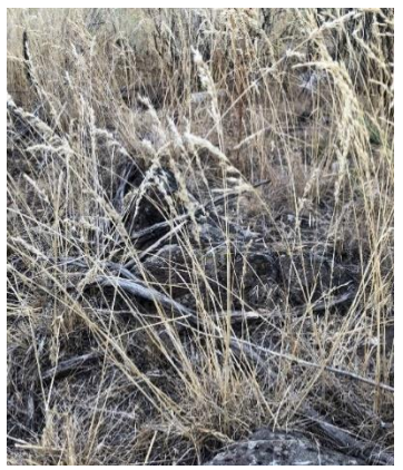
Sandberg bluegrass.

Nevada bluegrass is a medium to long lived native bunchgrass adapted for early to mid spring grazing, sometimes as much as 2 weeks ahead of crested wheatgrass but becomes less desirable early in summer. It has a similar maturity date to big bluegrass but is much later maturing than Sandberg bluegrass. It has poor seedling vigor and requires as much as 2 to 4 years to reach full productivity. Because young plants are easily pulled up, grazing should be deferred until roots are well anchored. Recommended sites include mountain foothill and mountain sites in sagebrush-grass sites at 2,000 to 8,000 feet elevation, sunny places on mountain brush and ponderosa pine ranges. It provides excellent nesting cover for upland birds. It is adapted to 10 to 20 inches annual precipitation. It will not tolerate early spring flooding, high water tables, or poor drainage. It tolerates weakly acidic to weakly saline conditions. It can also be used for ground cover and erosion control on cut or burned-over timberland. Use only in native seed mixtures due to its slow establishment. Adapted source is Opportunity Selected Germplasm. Recommended full stand seeding rate is 2 lb/ac.