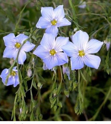
Lewis flax.