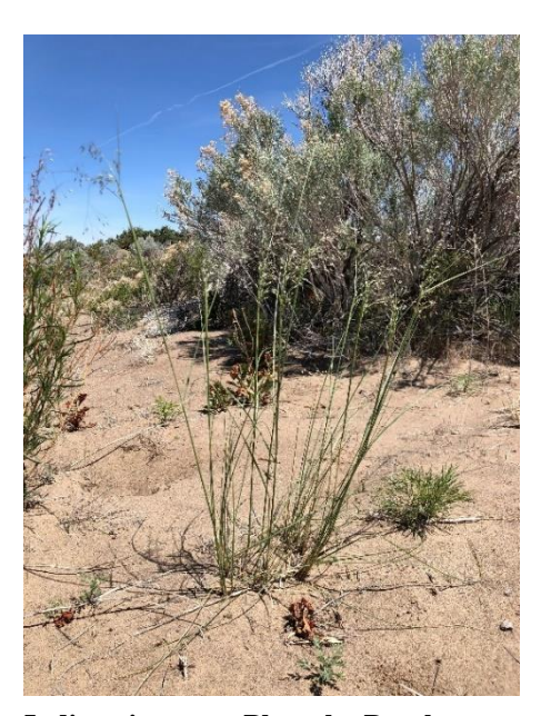
Indian ricegrass.