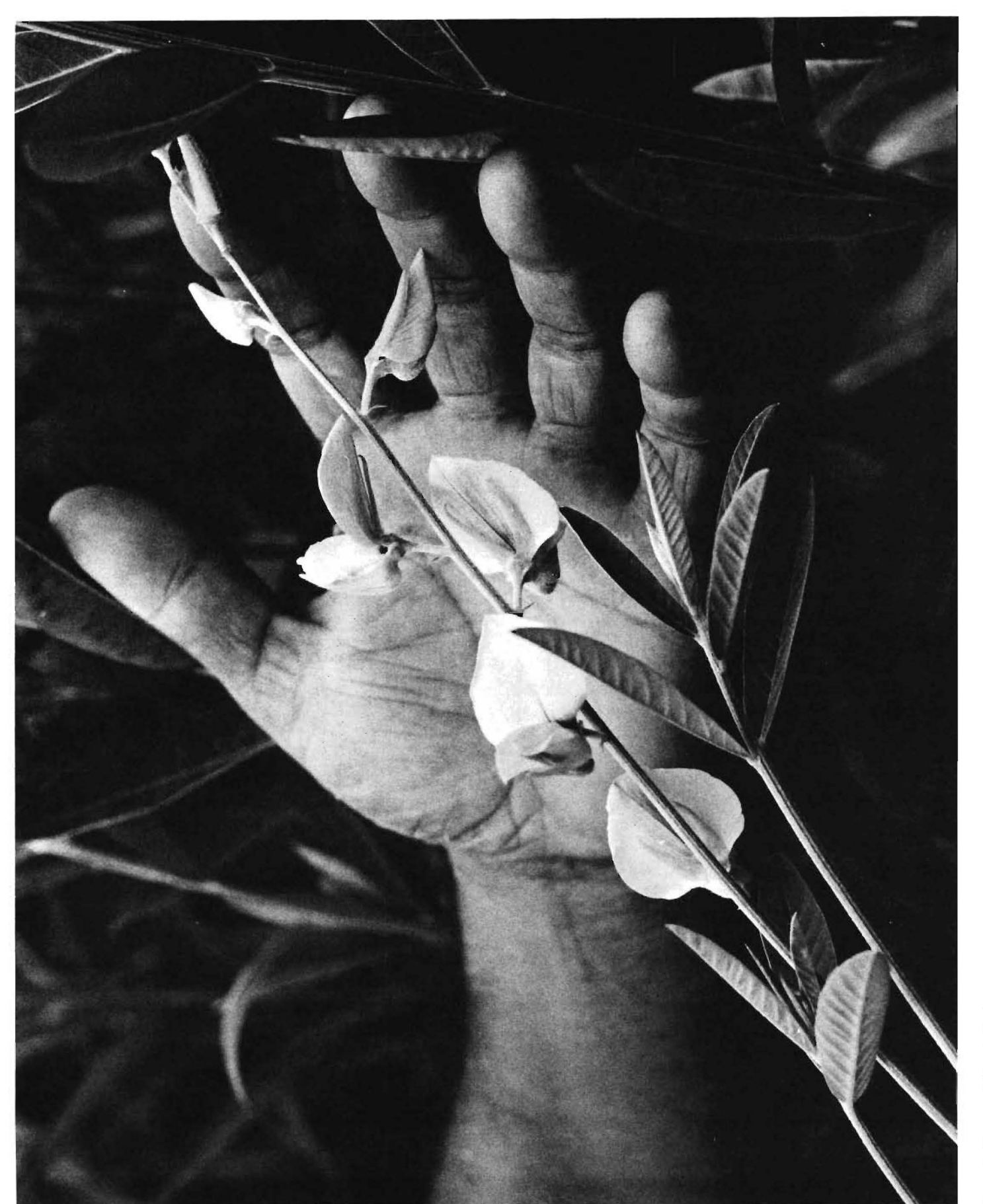
Figure 2. Flowers of 'Tropic Sun' sunn hemp.