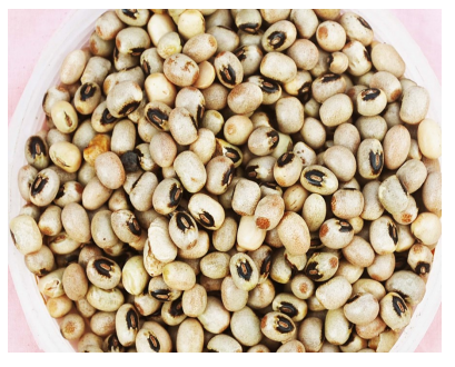
Figure 1. Vigna racemosa (Gbomagungi)

The seeds of V. racemosa (Figure 1) were purchased from a local market in Ago-Are (8.67°N, 3.40^{\circ} E), Atisbo Local Government Area of Oyo State, Nigeria. The seeds were winnowed to remove foreign and unwanted materials such as stones, stalks, immature and broken seeds. They were then packaged in a labelled plastic container. Some seeds were ground in a plate mill (Model No. 1A, Nulux Grinding Mill, India). The milled flour sample was packaged in an airtight polyethylene bag, labelled and kept at ambient temperature (25±3°C) prior to subsequent analysis.