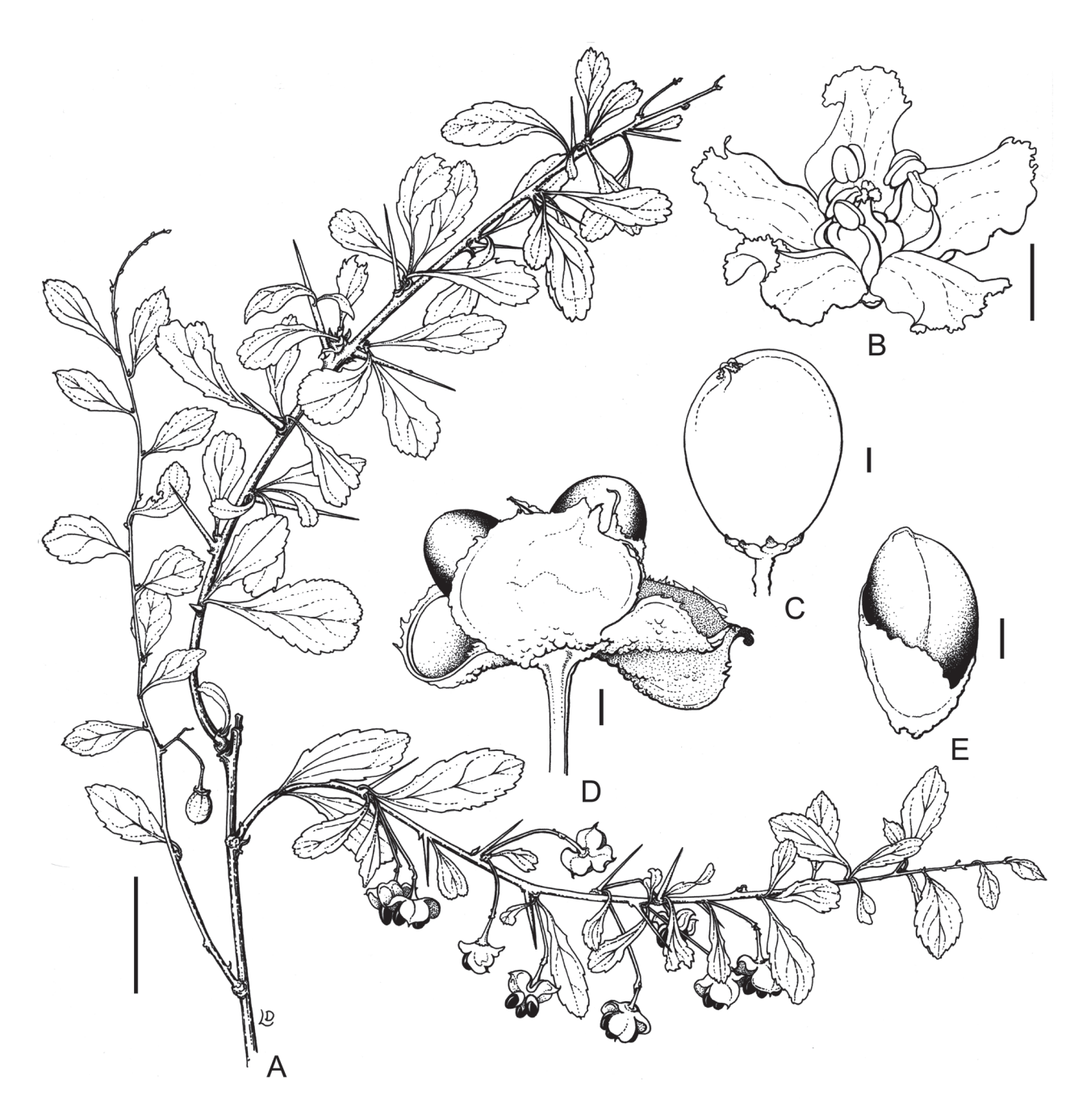
FIGURE 1. Gymnosporia swazica . A. Fruiting branch (from Jordaan 3845 ). B. Female flower (from Ward 1507 ). C. Open capsule (from Jordaan 3845 ). D. Closed capsule (from Jordaan 3712 ). E. Seed, partically covered by the aril (from Jordaan 3845 ). Drawings by Lesley Deysel. Scale bar: A = 20 mm, B–E = 1 mm.