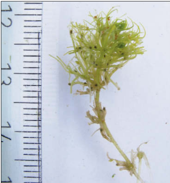
Fig. 10. The variety of Chara vulgaris .

This species has been found in one locality (loc. 8) in Samos. Plants are up to 15 cm long. Branchlets ecorticated or with cortex on the lowest internodes. Posterior bract-cells are long. Fertile.