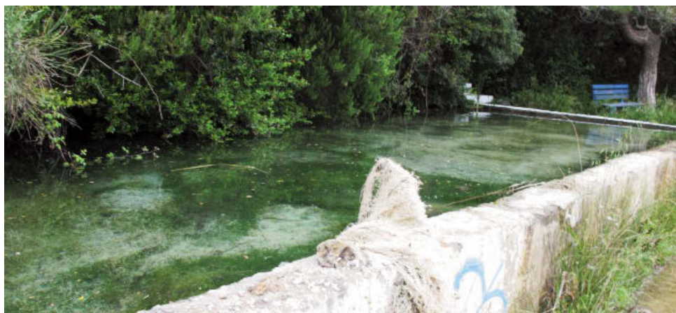
Fig. 7. The spring in Keramio is filled with charophytes. Photo 10.5.13.

Vramolimnis (loc. without charophytes, see Table 2) (Fig. 9).