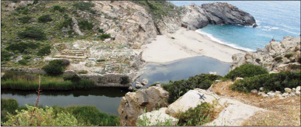
Fig. 8. The locality in Nas. Photo 10.5.13.