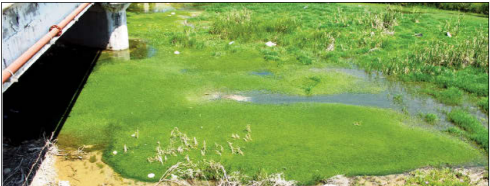
Fig. 5. Dense mat with Chara gymnophylla in the eastern river in Karlovassi. Photo 6.5.13.

This is a spring reservoir which recently has been emptied and cleaned, but still contains Chara vulgaris and the filamentous alga Cladophora on the bottom.