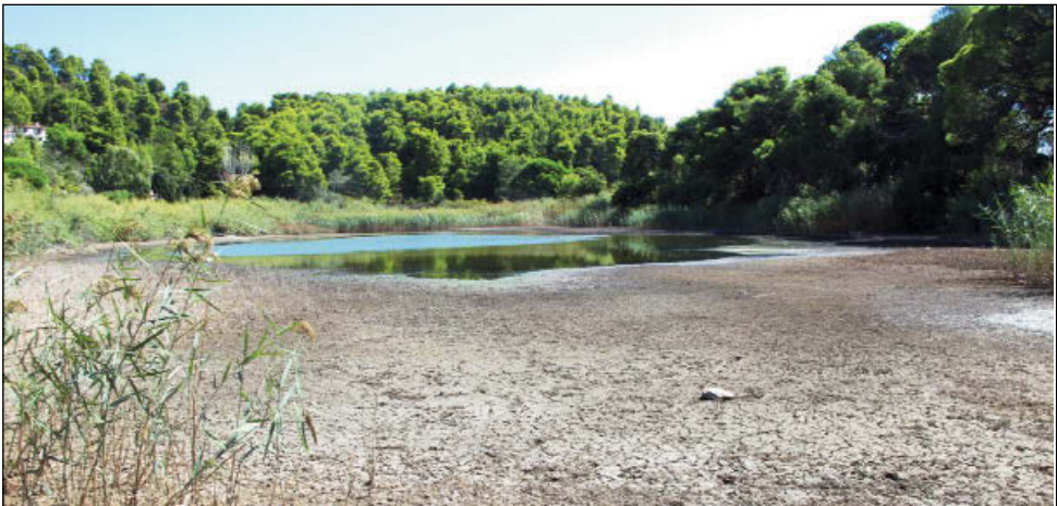
Fig. 9. Skiathos. Vramolimnis. Photo 18.9.2013.

This species has been found in eight localities on the two islands, Samos (loc 3, 5, 7, 8, 9) and Ikaria (loc. 10, 11, 12).