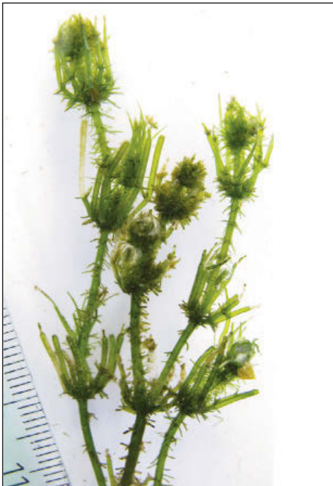
Fig. 11. Chara corfuensis .

This species has been found in one brackish-water locality in Samos, Mesokampos (loc. 3). In a canal here it was found mingled with a Chara canescens (dominating) and C. vulgaris . The specimens were up to 10 cm long, green, richly fertile with red antheridia and yellowish brown oogonia. Monoecious. Oogonia c. 500 \mu\text{m} long, antheridia 250-350 \mu\text{m} in diameter.