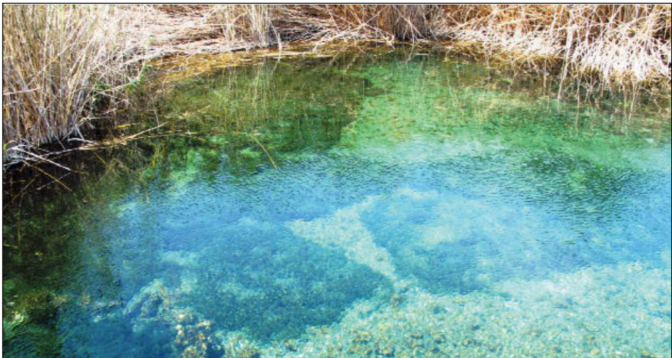
Fig. 2. Hidden lake in Mesokampos. The water is crystal clear with scattered stands of charophytes as can be seen here. Photo 4.5.13.

The species found here are Chara canescens (dominating), C. vulgaris and Tolypella nidifica . In the upper part the charophytes are partly covered with soil, in the lower parts it is not so (Fig. 3).