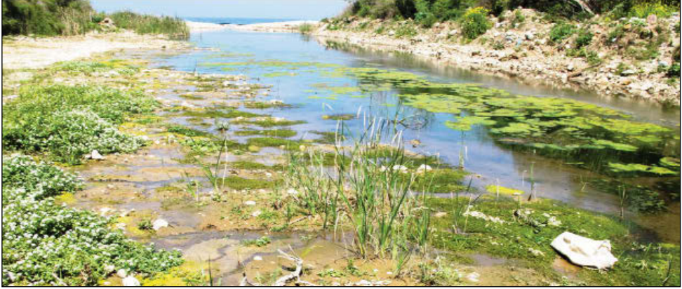
Fig. 4. Western river in Karlovassi, lower part. Photo 6.5.13.