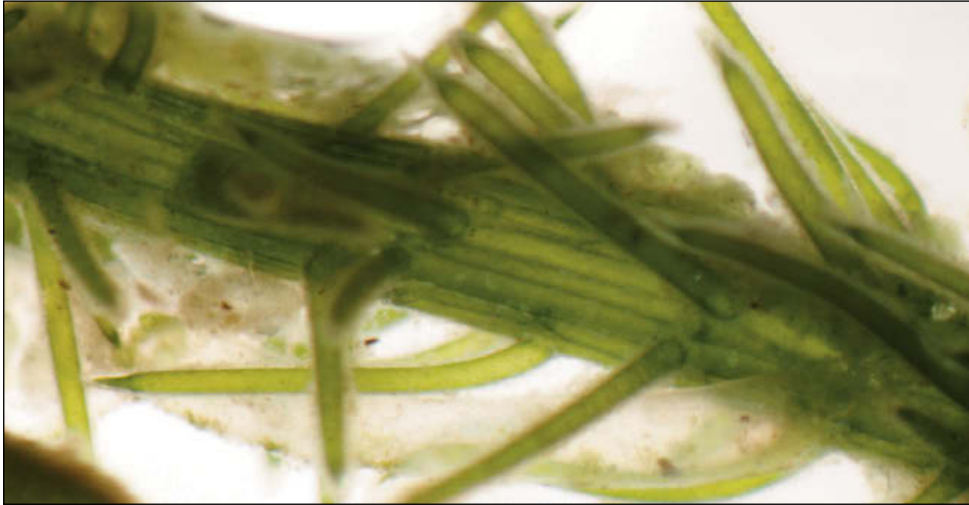
Fig. 12. Chara corfuensis . Details of cortex and spine-cells.