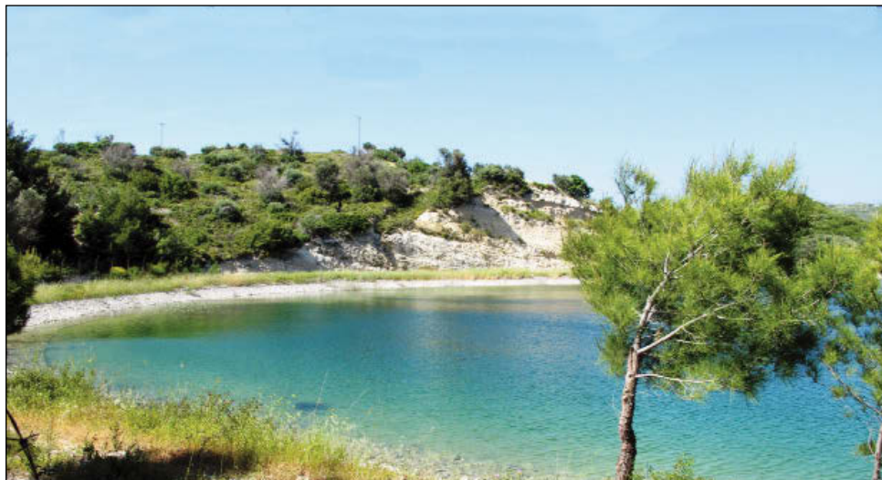
Fig. 6. Dam northeast of Mytilini. Photo 5.5.13.