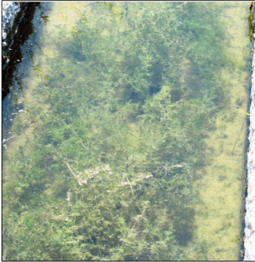
Fig. 3. Dense vegetation of charophytes in the canal. Photo 4.5.13.

Mesokampos. Small waterpool near the canal, 100 m from the shore (loc. 4).