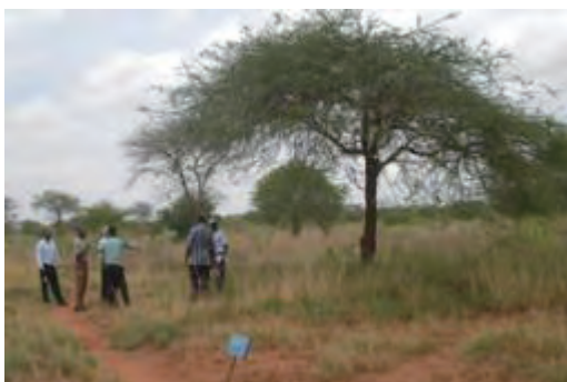
Photo 4. P. maximum under the Acacia tree at Kiboko exemplar field (Photo4, K2)