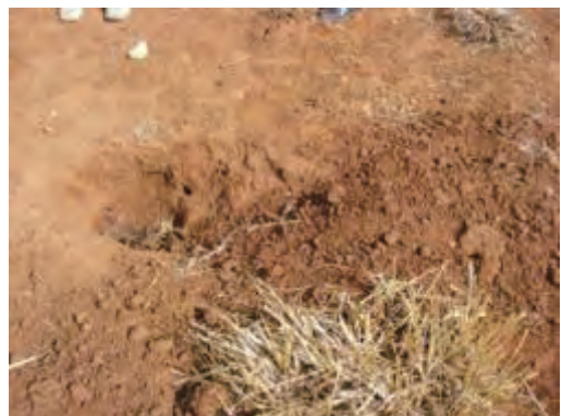
Photo 8. P. maximum test field at KARI-Katumani, attacked by deer (Photo8, K4)