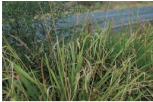
Photo 5. P. maximum in site K3, Mombasa Rd. at Kiboko (Photo5, K3)