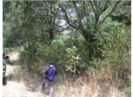
Photo 22. P. maximum on site K13, at a narrow margin between forest and road Kakuzi area (Photo22, K13)