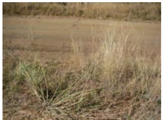
Photo 16. P. maximum on site K9, at Kirathe Farm Juja (Photo16, K9)