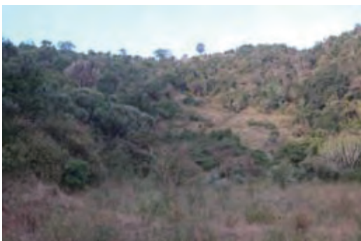
Photo 12. Natural vegetation Background of P. maximum at Nakuru to Nairobi (Photo12, K7)