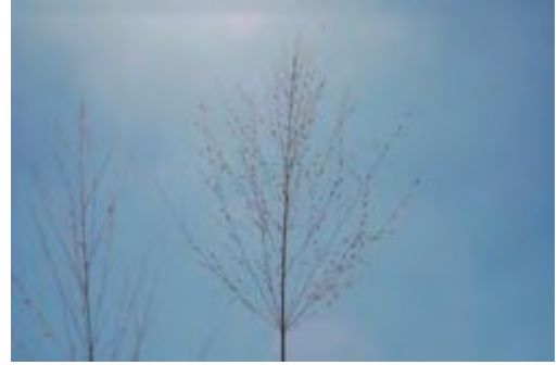
Photo 21. P. maximum at Road side small farm at Juja (Photo21, K12)