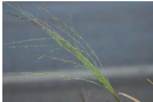
Photo 6. Inflorescence in site K3, Mombasa Rd. at Kiboko (Photo6, K3)