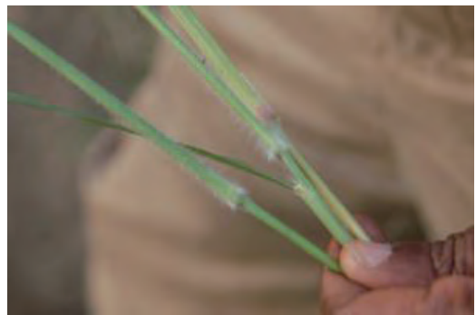
Photo 14. Pubescence and colors of node of three different types of P. maximum (Photo14, K7)