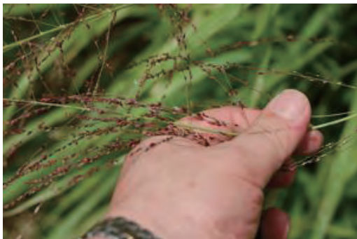
Photo 3. P. maximum ; purplish floweret type at KARI-Kiboko (Photo3, K1)