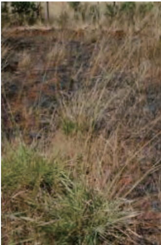
Photo 19. P. maximum on site K11, at the other remains of corn field Juja area (Photo19, K11)