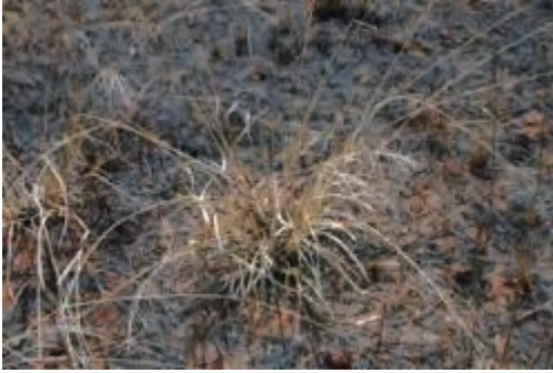
Photo 17. P. maximum on site K10, at remains of corn field in Juja farmer (Photo17, K10)