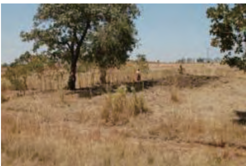
Photo 20. P. maximum at Road side small farm at Juja (Photo20, K12)