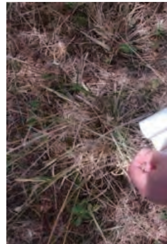
Photo 23. P. maximum on site K14, at same as and near site K13 (Photo23, K14)