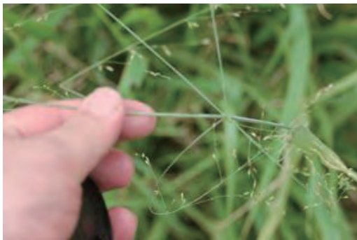
Photo 2. P. maximum ; greenish floweret type at KARI-Kiboko (Photo2, K1)