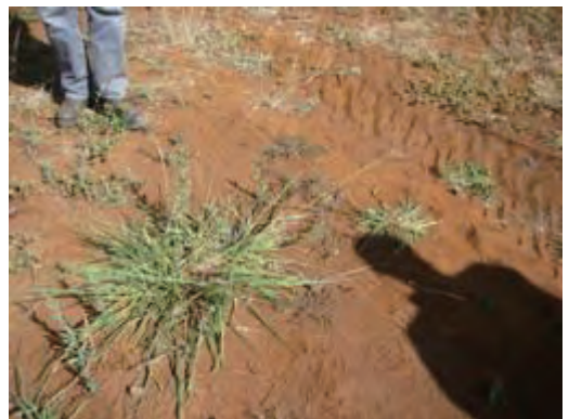
Photo 15. P. maximum on site K8, at Kirathe Farm Juja (Photo15, K8)