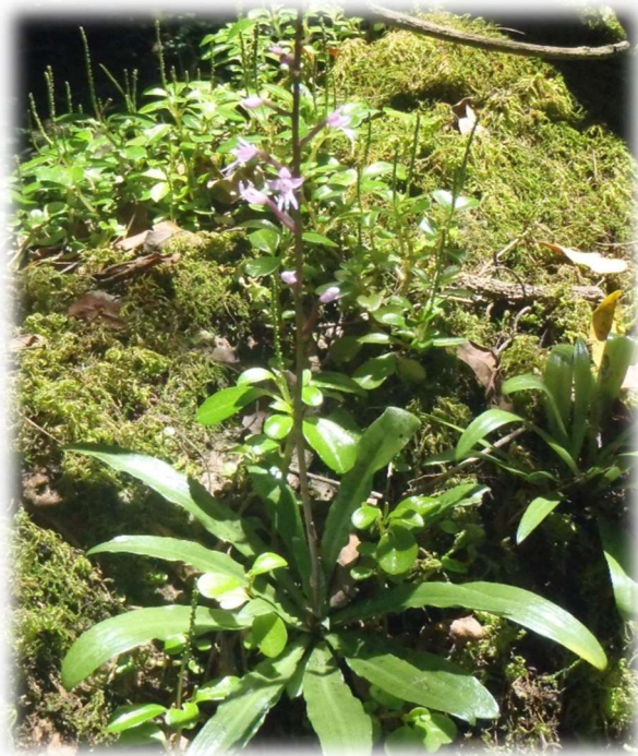
Stenoglottis fimbriata (Litophyte)