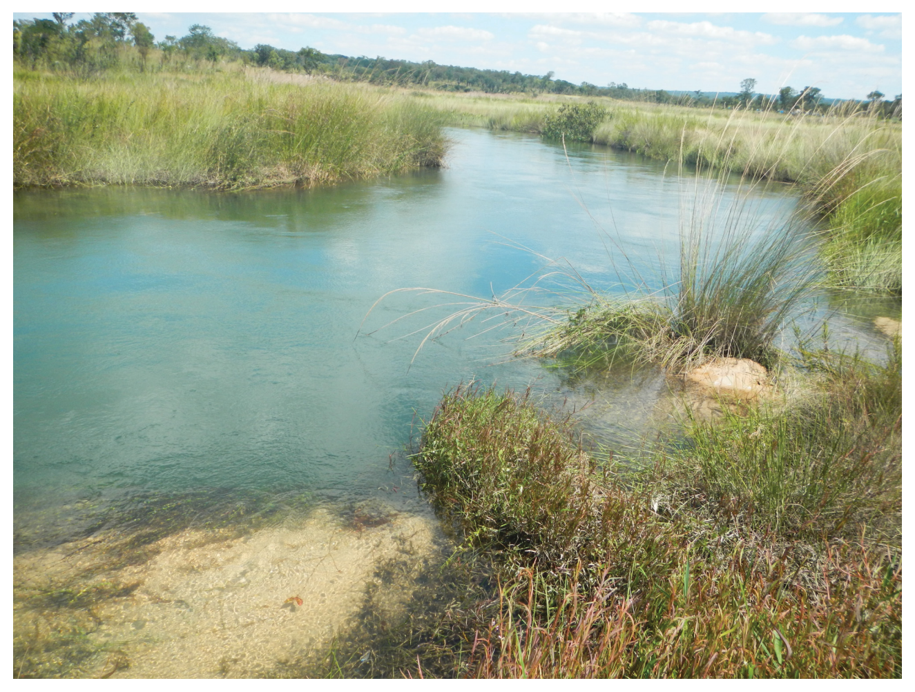
FIGURE 4. The Lungué-Bungo River, a fast flowing, often deep river with sandy substrate.

All specimens were preserved in 80% ethanol, labelled and given an Albany Museum CAW (Central African Waters) field catalogue number. Samples were sorted in the Albany Museum after the fieldtrips, further catalogued and identified to the lowest taxonomic rank possible for each group, for incorporation into the Albany Museum's Department of Freshwater Invertebrate collection. Some of the adults were associated with the aquatic stages in the laboratory, linked by the fact that they were collected at the same site, although further linking of life stages needs to be the done using DNA barcoding.