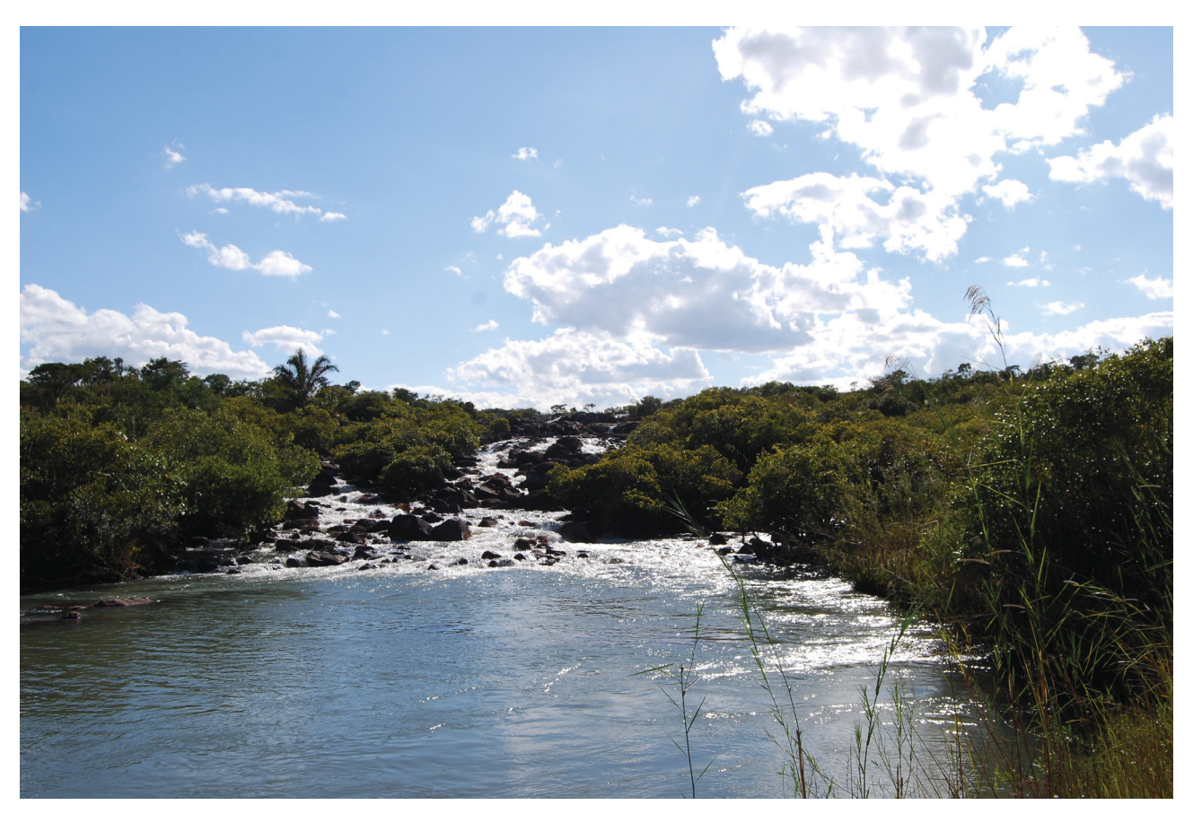
FIGURE 3. Section of Cubango River, showing a typical rapid over rocky substrate.

H. triaxialis is found in the Cubango and the Cuanza Rivers in Angola, and in the Luanza River in the DRC (Luanza to Kabiashia, Kasenga district). Typically, this plant provides specialised habitat for mayflies. Unlike the Cubango River, the other headwater rivers all flow over deep Kalahari sands. These sandy bottom rivers may also be swift flowing, and even the smaller tributaries can be deep (too deep to stand in places). They are all surrounded by waterlogged grass and sedge vegetation, often with a variety of densely growing rooted aquatic macrophytes living under water, which provide habitat for the invertebrates.