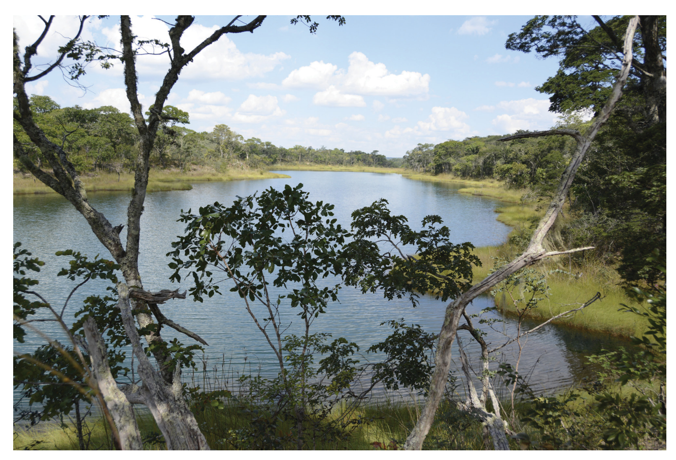
FIGURE 5. Lake Tchanssengwe, the source lake feeding the Lungué-Bungo River.