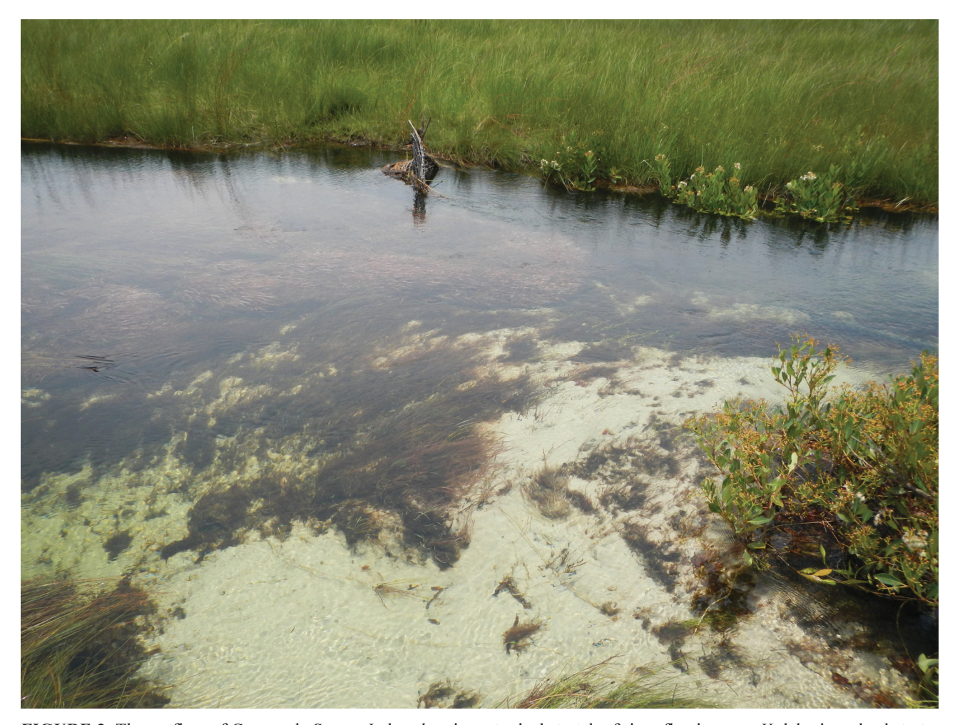
FIGURE 2. The outflow of Cuanavale Source Lake, showing a typical stretch of river flowing over Kalahari sand substrate, with aquatic macrophytes and riparian sedges and grasses.

Since 2015, several expeditions have been organised to this largely untouched region of source lakes, upland rivers, and miombo forests. The headwaters of these rivers lie at elevations between 1200 and 1500 masl. The Albany Museum joined three of the expeditions to assess the biodiversity of freshwater macroinvertebrates in this area, collecting at sites shown in Fig. 1. The first, the October–November 2016 Cuito-Cuando expedition, included the Cuito and Cuanavale Rivers and tributaries, which flow to the Okavango, and those flowing into the Zambezi River system. Specimens were collected from 23 sites across six river systems, Cuito (one site), Cuanavale (nine sites), Cuando (eight sites), Cuembo (three sites), Lungué-Bungo (one site) and Luanginga (one site). The Cubango River expedition followed in May 2017, with 23 sites along the upper Cubango River catchment, including mainstream river sites (Fig. 3), tributaries, isolated pools, wetlands and seeps. The Lungué-Bungo River (Fig. 4) and tributaries was the focus in April 2018, with 22 sites collected along the Lungué-Bungo, Comba and Cacau Rivers and the source lake, Lake Tchanssengwe (Fig. 5).