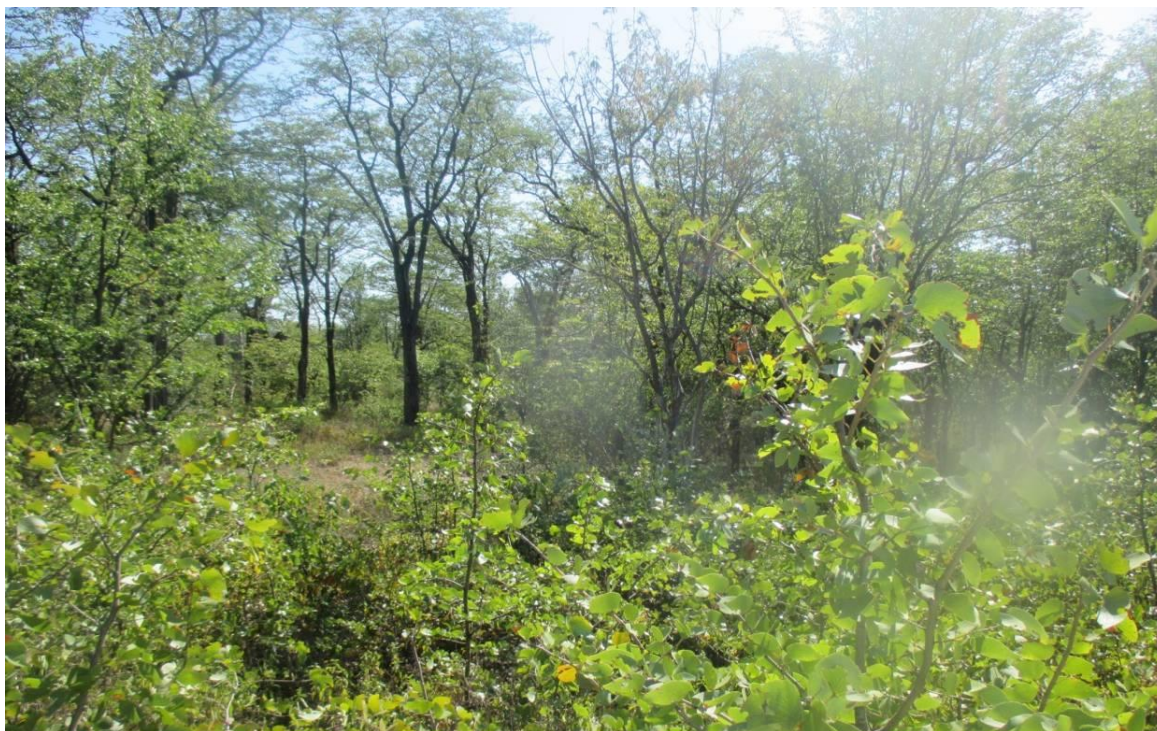
Figure 1. Mopane woodland

This is the dominant vegetation type within the Zambezi escarpment. Species identified within the mopane woodland areas include Colophospermum mopane , Julbernardia globiflora , Brachystegia boehmii , Adansonia digitata , Balanites maughamii , Baikiaea plurijuga , Acacia karroo , Dichrostachys cinerea , Euphorbia ingens and Acacia amythethophylla . The herbaceous cover was comprised of species like Hyparrhenia filipendula , Andropogon , Bidens pilosa , Eragrostis sp. , Bothriochloa bladhii , Themeda triandra , Tithonia rotundifolia and Sporobolus pyramidalis