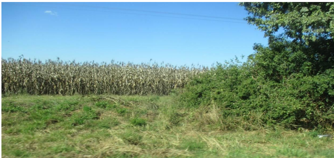
Figure 2. Maize field