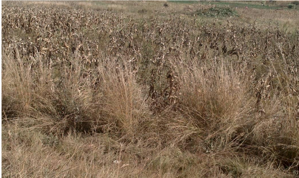
Figure 12: Maize crop in project area

hybridus , Euphorbia hirta , Ceratotheca sesamoides , Vernonia cinerea , Tagetes minuta , Richardia scabra , Bidens pilosa , Conyza sumatrensis and Bidens pilosa .