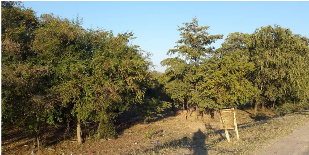
Figure 10: Terminalia woodland