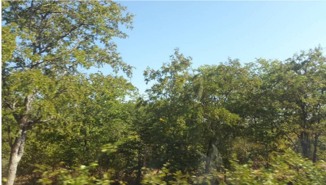
Figure 2: Dense Mopane woodland

species density of mopane in these areas is 70.8% as compared to other mopane woodland with 45.5% relative density. Adansonia digitata , Acacia mellifera and Acacia erubescens are typically common also. Other species noted in this vegetation type was Cissus quadrangularis , Acacia tortilis , and Commiphora pyracanthoides .