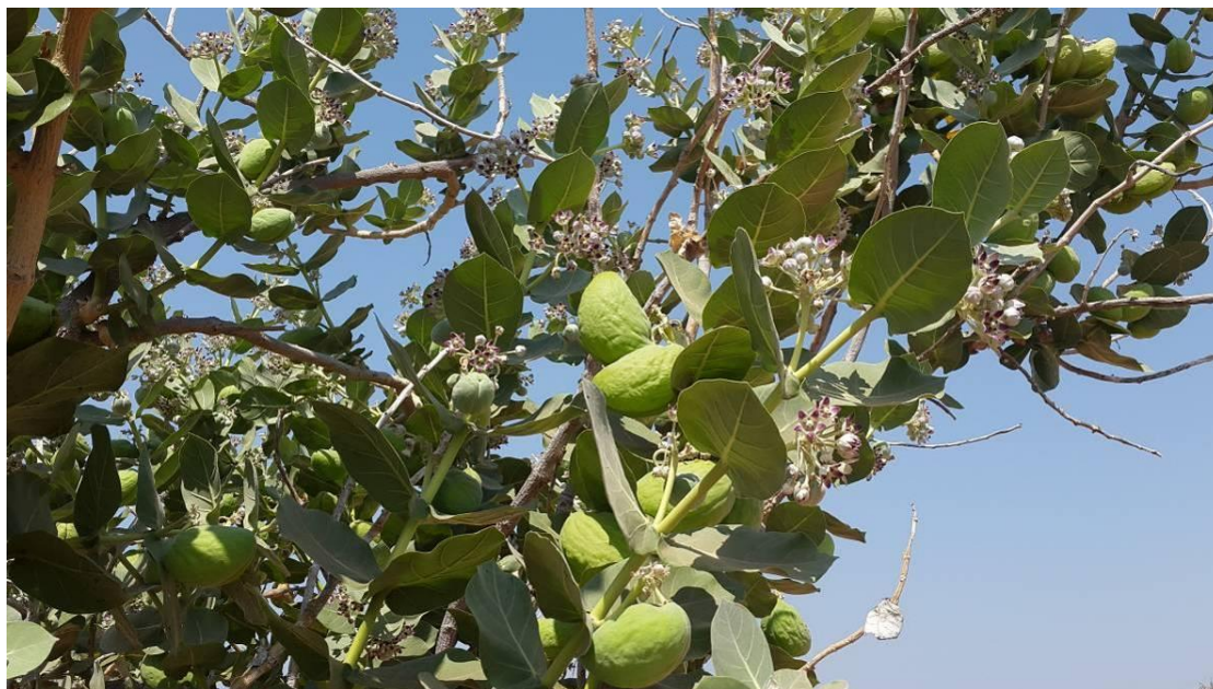
Figure 3.3 Calatropis procera outside the site at Headman's homestead

15. Calatropis procera is common along the Zambezi Valley and it was also identified at the Headman's homestead close to the site.