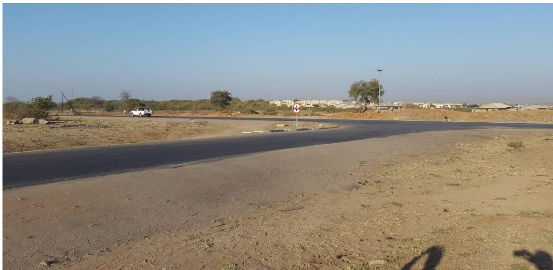
Figure 1: Junction of Beitbridge-Bulawayo and Harare road

This type of vegetation was recorded on a number of places especially close to settlement where mopane is valued for its use as firewood. Starting from the junction of Beitbridge-Bulawayo and Harare road, the vegetation is quite disturbed with small mopane trees identified. Species identified also includes Colophospermum mopane with 50% relative density and other species noted like Lannea schweinfurthii , Boscia salicifolia , Combretum imberbe , Acacia tortilis and Acacia rehmanniana had 8.3% each relative density.