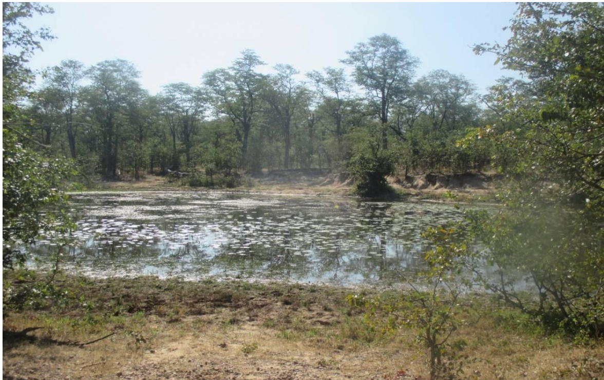
Figure 6. Floodpans found within the Zambezi escarpment.

bicolor , Combretum mossambicense and Cissus quadrangularis . The pools comprised of Nymphaea caerulea (Water lily).