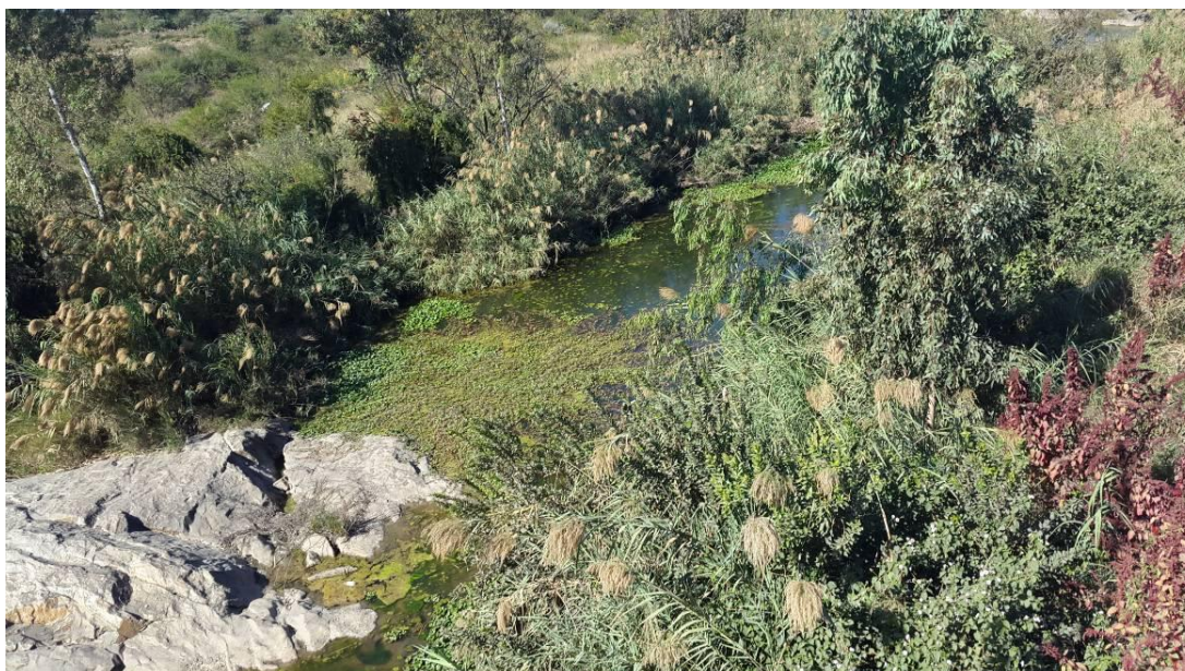
Figure 6: Aquatic plant species along Mucheke River

Along Mucheke River, the plant species noted include the aquatic species like Eichhornia crassipes , Spidorella sp , Ludwigia stolonifera , Phragmites australis and Typha latifolia .