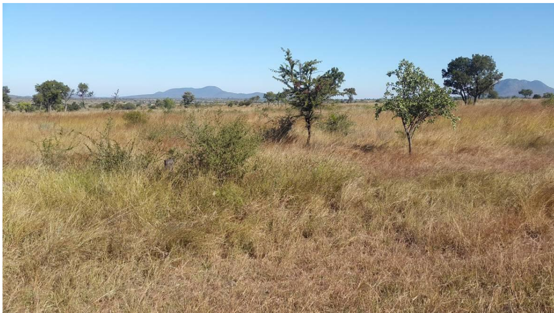
Figure 11: Wooded grassland

The wooded grassland was dotted along the way especially in areas previously cultivated and left to reestablish. Woody species were mainly secondary growth, with species like Combretum zeyheri , Diplorhynchus condylocarpon , Bolusanthes speciosa , Acacia nilotica , Lippia javanica , Peltophorum africanum and Gymnosporia senegalensis . The herbaceous layer was made up of grasses like Hyparrhenia filipendula , Hyparrhenia hirta , Sporobolus pyramidalis and Heteropogon contortus . In some places Aristida congesta was dominant with other species like Perotis patens and Urochloa mossambicensis .