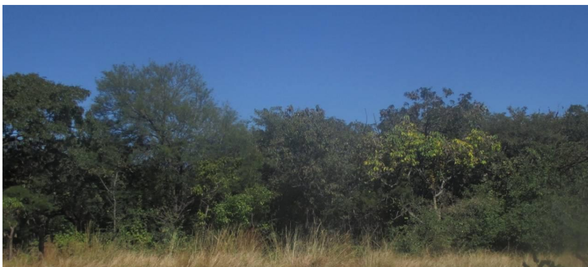
Figure 3. Miombo woodland along the Harare-Chirundu highway

(17.78655S 29.64382E; 17.65907S 30.74569E; 17.50351S 30.56119E)