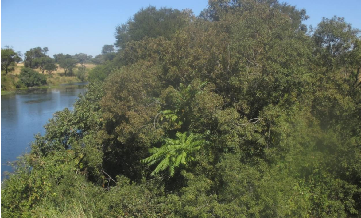
Figure 4. Riparian vegetation found along the banks of Manyame River

(17.61479S 30.69024E; 17.43823S 30.47432E; 17.38840S 30.36641E; 17.35756S 30.29395E; 17.23580S 29.99235E; 17.11205S 29.91343E; 16.92477S 29.77587E; 16.89035S 29.75237E; 16.78499S 29.64204E)