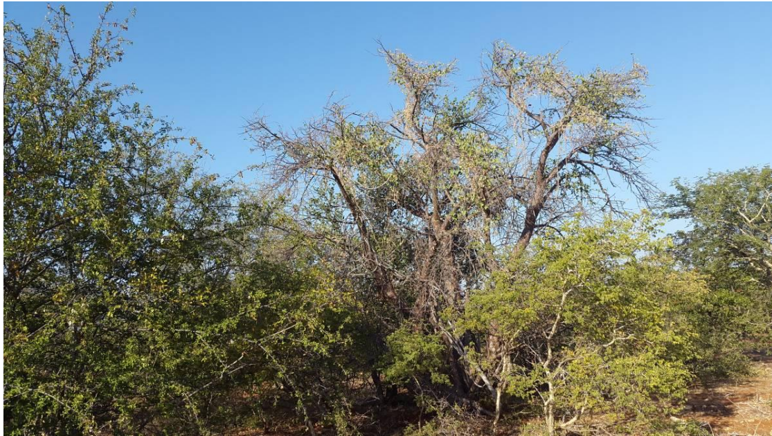
Figure 4: Acacia woodland.