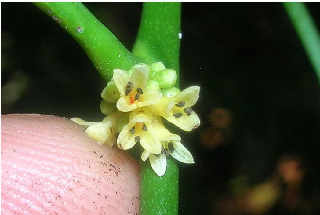
Fig. 5. Vepris robertsoniae Close up of male flowers, note the four stamens, cultivated plant in Base Titanium nursery 28 May 2021.