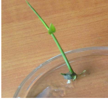
Figure 6. Root formation of Low land bamboo via IBA hormone after a week from single shoot.