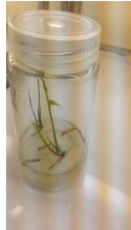
Figure 3. Cultured seed