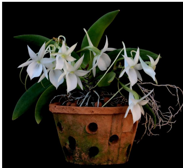
Angraecum leonis (picture from Tom's blog site www.angraecums.blogspot.com )

The program is beneficial to both the beginner as well as the experienced grower. It's all about the flowers!