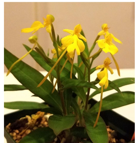
Blue – Habenaria rodocheila – David Mellard

Habenaria rodocheila was first described in 1866 and the species name means the Red or Rose Colored Lipped Habenaria. In 1896 a separate description was given for the populations with a yellow colored lip under the name Hab.