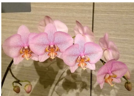
Blue – Phalaenopsis Miva

Smartissimo 'Firelli,' AM/AOS – Jon Crate