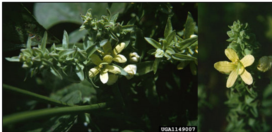
Alectra vogelii inflorescence.