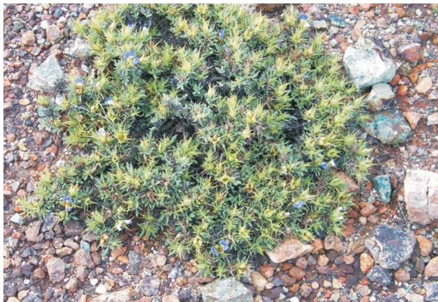
Fig. 1. Photograph of Blepharis aspera growing in its natural environment at Selkirk, Botswana.

Of the four sampling locations visited in Botswana (Selkirk, Thakadu, Malaka and Nakalakwana), B. aspera was found only at Selkirk, which had high soil Cu and Ni concentrations in the range 0.38–1.9% Cu and 0.17–0.37% Ni. Thus, the plant can be