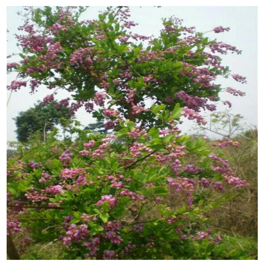
Plate I: Securidaca longipedunculata in its Natural Habitat

Although, S. longipedunculata is protected under provincial and national legislation in many countries, but it is still one of the most traded medicinal plants in African continent (Moeng, 2010; Tabuti et al. , 2012). This important medicinal plant is threatened by over harvesting; this may be due to the fact that the root is the most commonly used part, which makes the plant difficult to survive over harvesting. Other factors include urbanization, expansion of agricultural activities, anthropogenic and environmental conditions such bush fires, droughts etc. (Oni et al. , 2014; Abubakar et al. , 2018a). The Royal Botanic Gardens also listed the plant in their "adopt a seed, save a species campaign" in order to protect it from becoming endangered and/or extinct (KRBG, 2013).