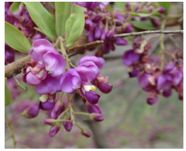
Plate II: Leaves and Flowers of Securidaca longipedunculata