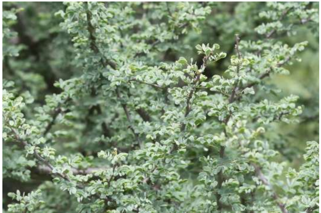
Photo 7 Foliage of Senegalia mellifera (Black Thorn). Areas at the site where dense covers of shrub-height Senegalia mellifera are present, represent some localized bush encroachment.