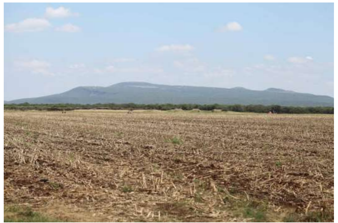
Photo 2 View of cultivated area at the study area.