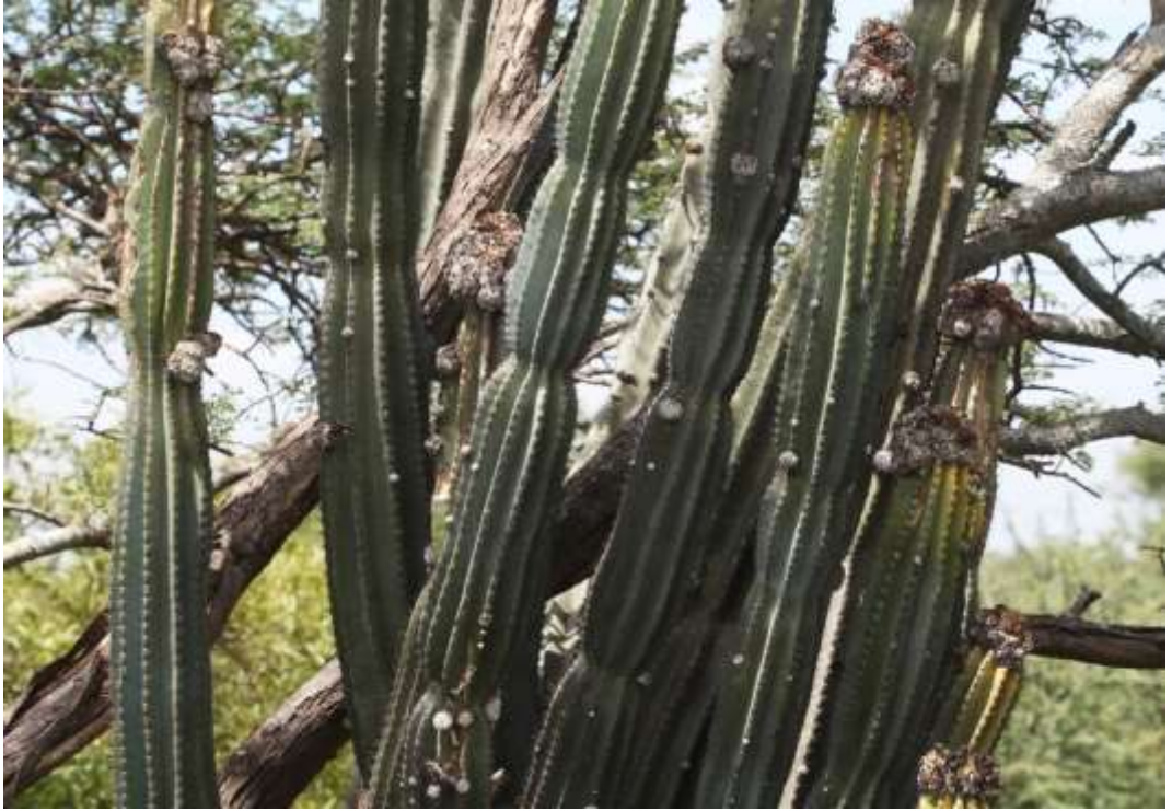
Photo 16 Alien invasive succulent tree, Cereus jamacaru, at the site.