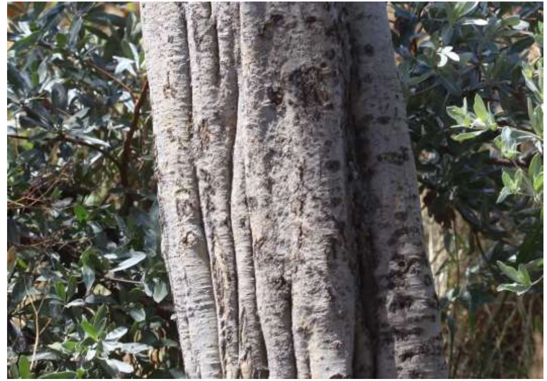
Photo 12 Trunk of the protected tree, Securidaca longepedunculata, at the site.