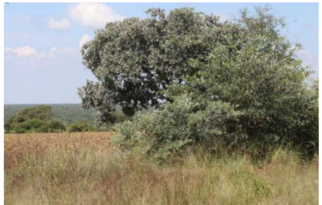
Photo 4 View of part of the western section of the site where Terminalia sericea (Silver Clusterleaf) trees are visibly abundant at a sandy area adjacent to a cultivated field.