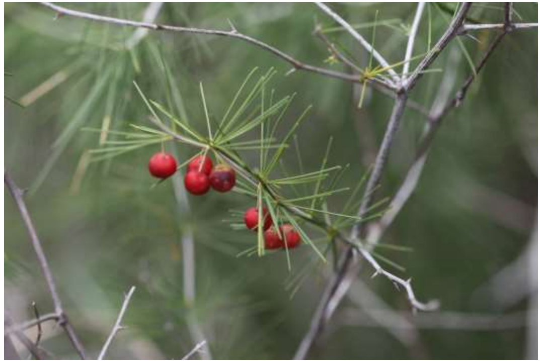
Photo 8 Asparagus laricinus, a widespread shrub often associated with bush encroachment, at the site.