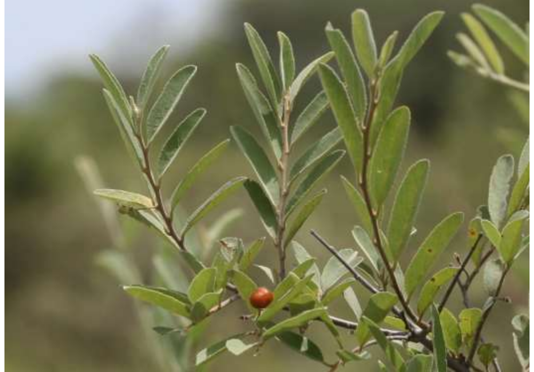
Photo 6 Foliage and fruit of Grewia flava (Velvet Raisin), a small indigenous tree, that is noticeable at many parts of the site.