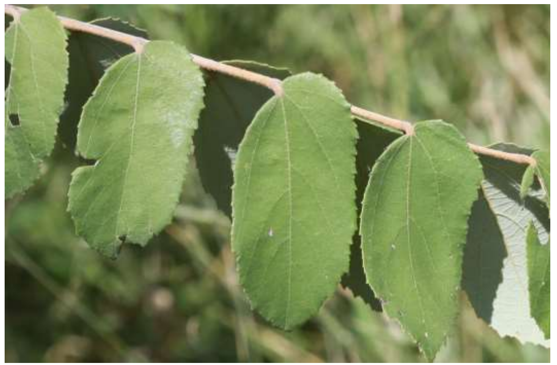
Photo 10 Characteristic leaves of Grewia monticola , at the site.