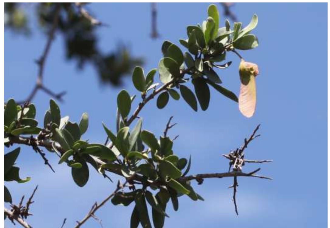
Photo 13 Foliage and fruit of the protected tree species, Securidaca longepedunculata , at the site.