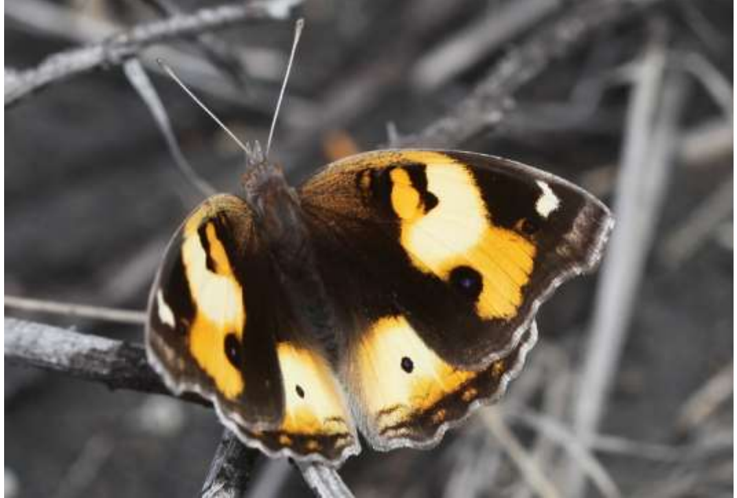
Photo 20 The widespread butterfly species Junonia hierta , at the site.