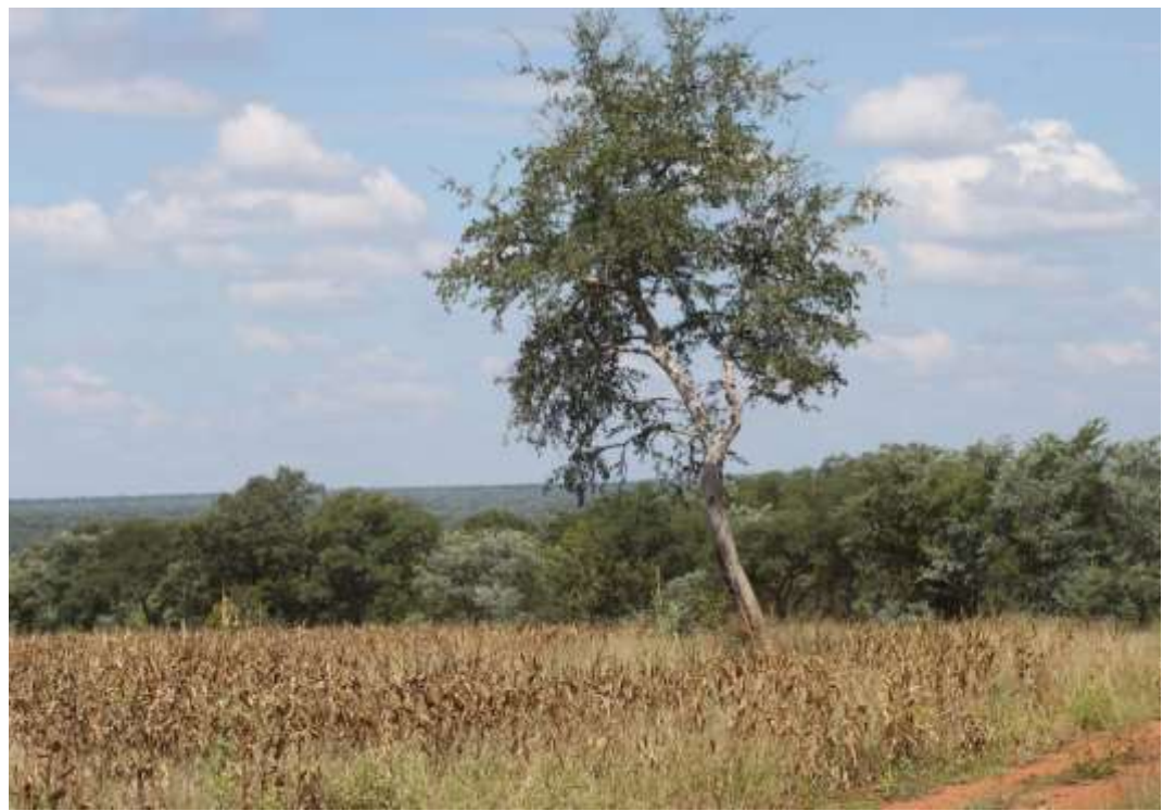
Photo 11 The protected tree Securidaca longepedunculata (Violet Tree, Krinkhout) that is conserved at a cultivated area, at the site.