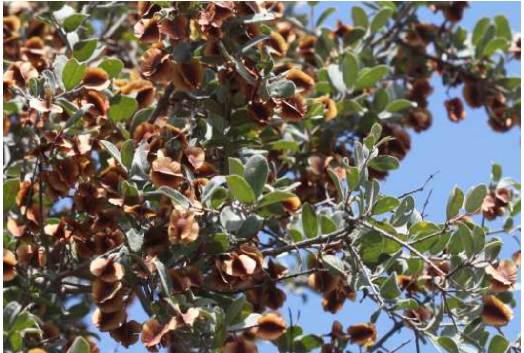
Photo 9 Combretum hereroense (Russet Bushwillow) at the site.