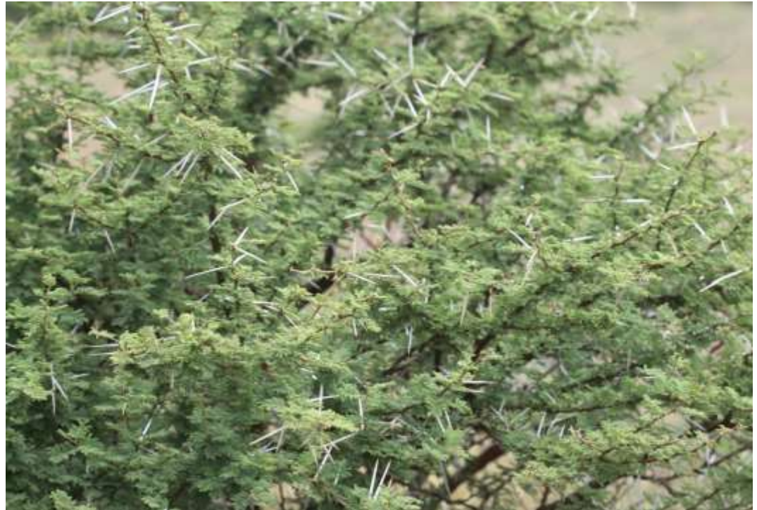
Photo 5 Vachellia tortilis (Umbrella Thorn) which is conspicuously abundant at parts of the site.