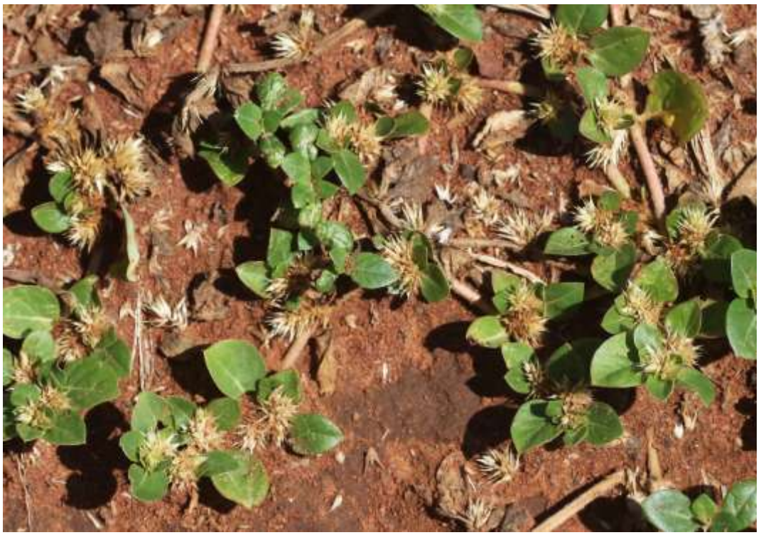
Photo 18 The alien invasive herbaceous weed, Alternanthera pungens , at the site.