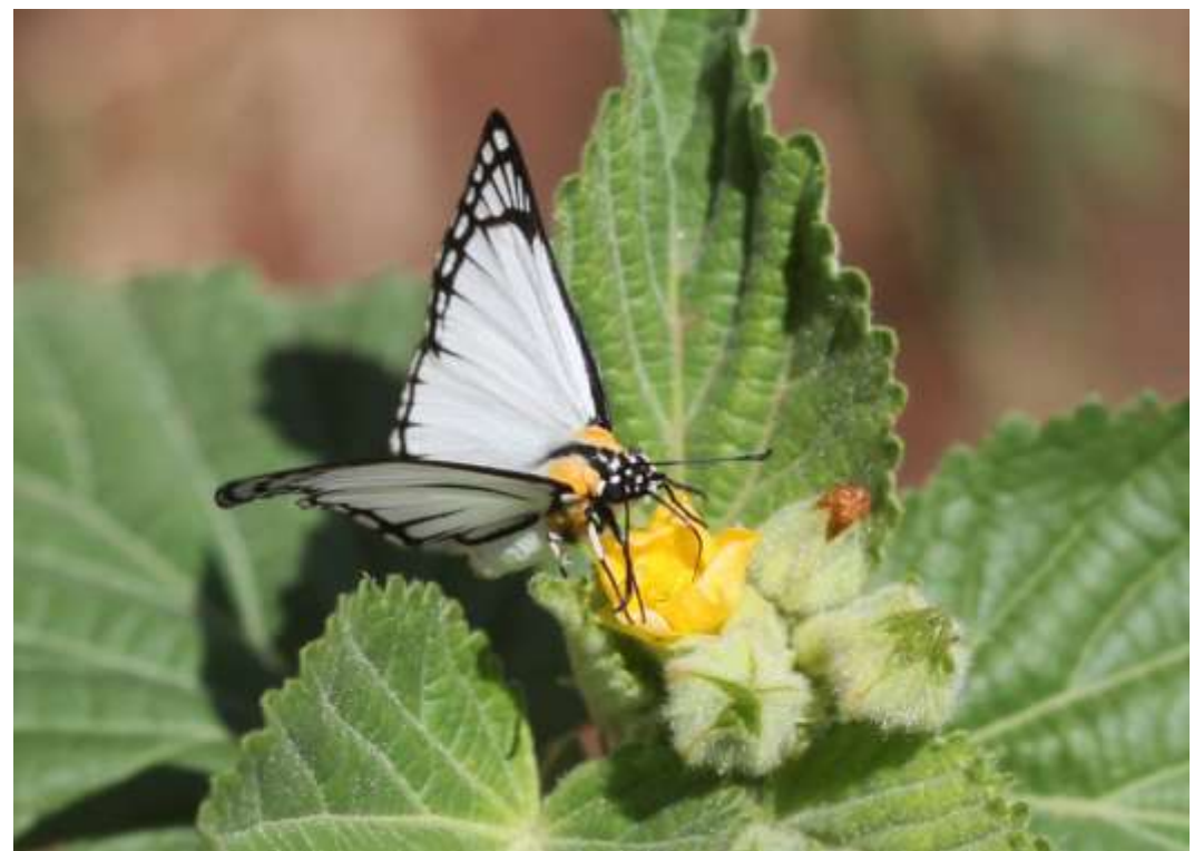
Photo 19 The butterfly species Leucochitonea levubu (widespread in savanna of the northern parts of South Africa) feeding on the nectar of a flower of Sida cordifolia at the study area.