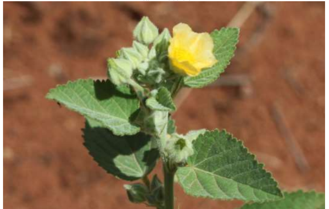
Photo 14 Sida cordifolia, a widespread herbaceous plant species, at the site.