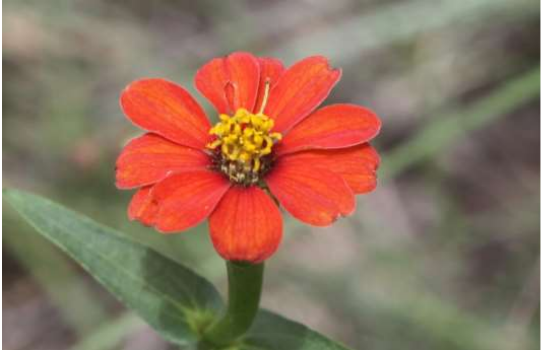
Photo 17 Flower of the alien invasive herbaceous weed, Zinnia peruviana, at the site.