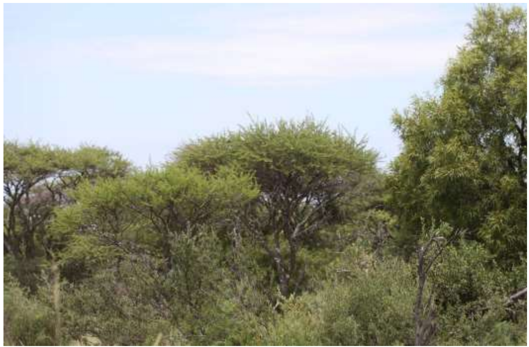
Photo 3 View of savanna at the eastern section of the site where the tree Vachellia tortilis (Umbrella Thorn) is conspicuous.