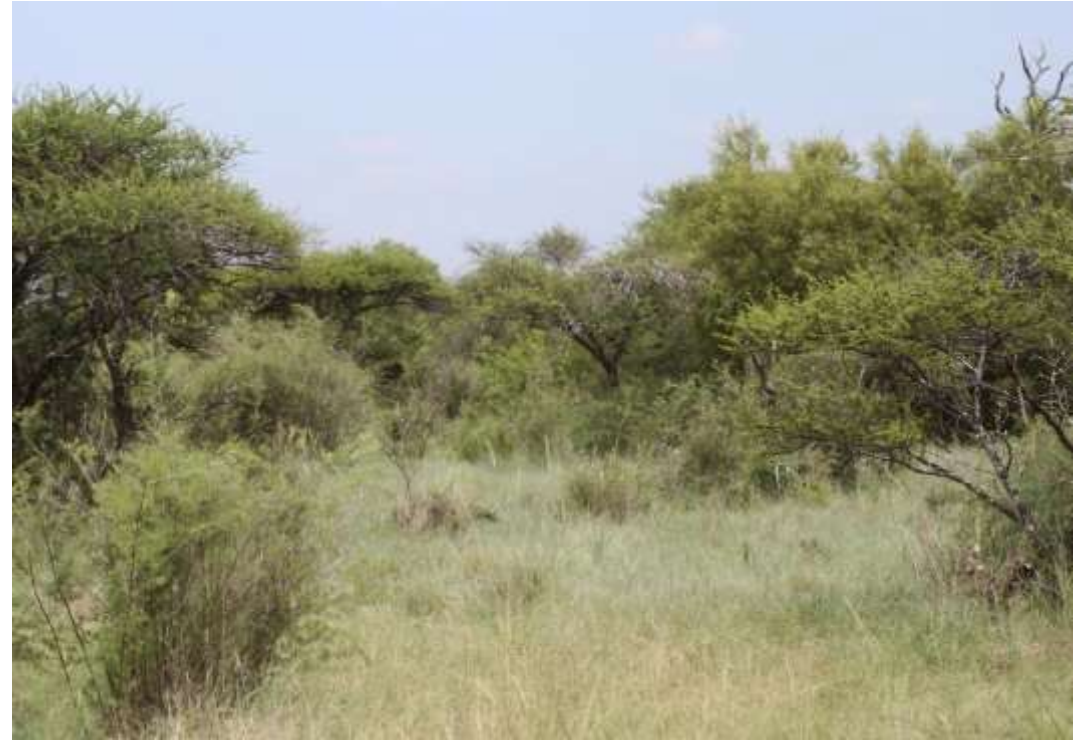
Photo 1 View of part of the eastern section of the site.