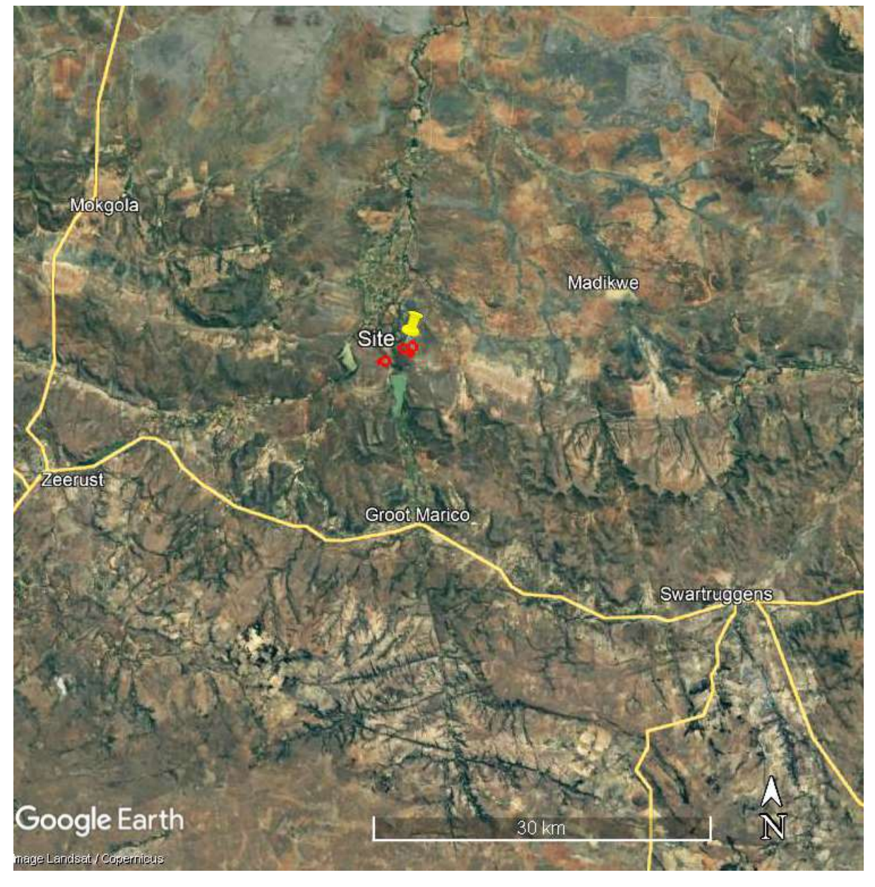
Figure 1 Map with an indication of the location of the site.

Note: Not all of the above listed plant species for the vegetation types occur at the site in the study area.