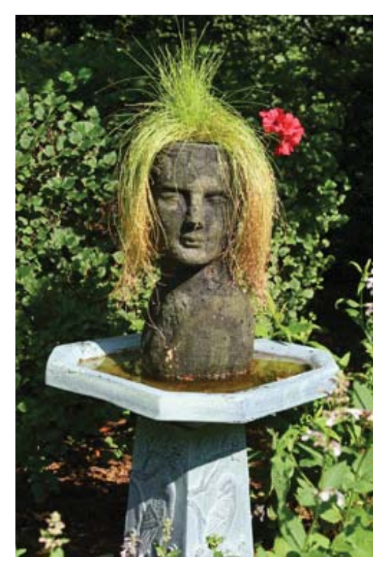
Fiber optic grass is great as a novelty!

Fiber optic grass grows best in full sun with plenty of moisture. Do not allow it to dry out or the foliage will turn brown. It can be planted in containers, in the ground, or kept in a water garden or pond. It will tolerate some shade, but will become lankier under those conditions. Grow these plants as specimens to show their unique character, or plant as accents among other plants grown for foliage or flowers. Combine it with other moisture-loving annuals in boxes or pots, or grow it in its own container in a grouping of potted plants. Try it as an underplanting with dark-leaved elephant ears (Colocasia esculenta 'Black Magic' or other cultivars). Place it on the edge of borders or beds, or between rocks at water's edge drooping over or into the water. For a novelty conversation piece, use it to top a "head" container! The fine texture of this plant is a good contrast to plants with coarse leaves. and its mounded habit is a good foil for upright plants and spiky flowers.