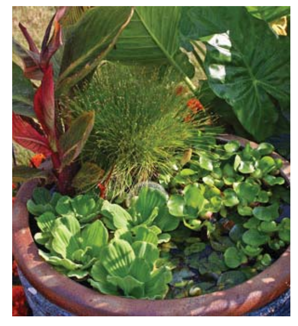
Fiber optic grass is a good addition to container water gardens.

If you plan to use this plant in a water garden, gradually increase the water level it sits in unless you purchased it from an aquatic plants display. This will allow the roots to become accustomed to being submerged. In a water garden it combines well with horsetails (Equisetum), dwarf papyrus, and cannas (but it best to keep each in separate pots). It can be planted on the water's edge or in the shallows of ponds, positioned so that the water level is no more than 2" above the soil. The leaves trailing in the water will provide shelter for frogs and fish.