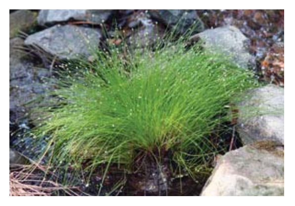
Fiber optic grass, Isolepis cernua.

Fiber optic grass is a fun plant (even though it isn't really a grass), that most people acquire because of its unusual appearance. Isolepis cernua (=Scirpus cernuus), in the sedge family (Cyperaceae), is a variable evergreen species with a mop-like tuft of fine green stems. It is found in wet places, growing as a marginal water plant or in sandy or peaty areas near the sea in its native range of western and southern Europe, the British Isles, North Africa, the west coast of North America (California to British Columbia and Alaska), and Australia and New Zealand.