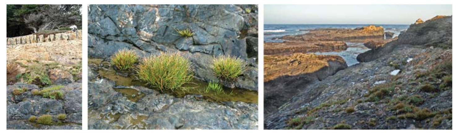
Native Isolepis cernua growing on the rocky coastline near Mendocino, CA.

This bright green, grass-like plant has small flower spikes at the stem tips reminiscent of those fiber optic lamps, hence