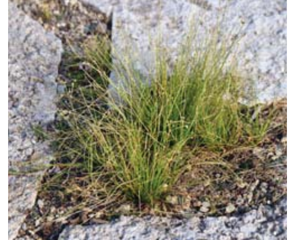
Young self-seeded fiber optic grass plants.

If it gets too long and lanky, give it a haircut and it will grow right back (I found this out after a raccoon or other animal raided the water garden and sheared my plant to the ground;