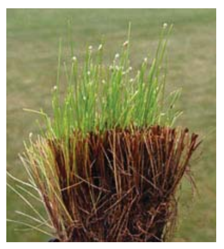
A trimmed fiber optic grass plant shows new growth.