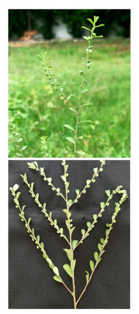
Figure 1: Phyllanthus maderaspatensis Linn.