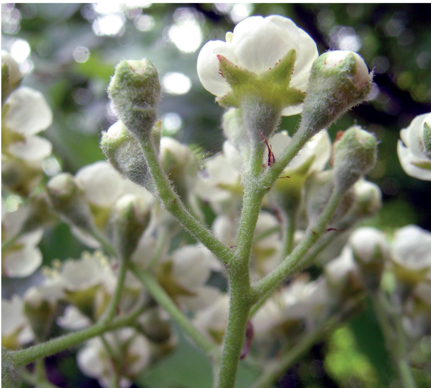
Flowers are arranged in corymbs of 20-30 individual blossoms.