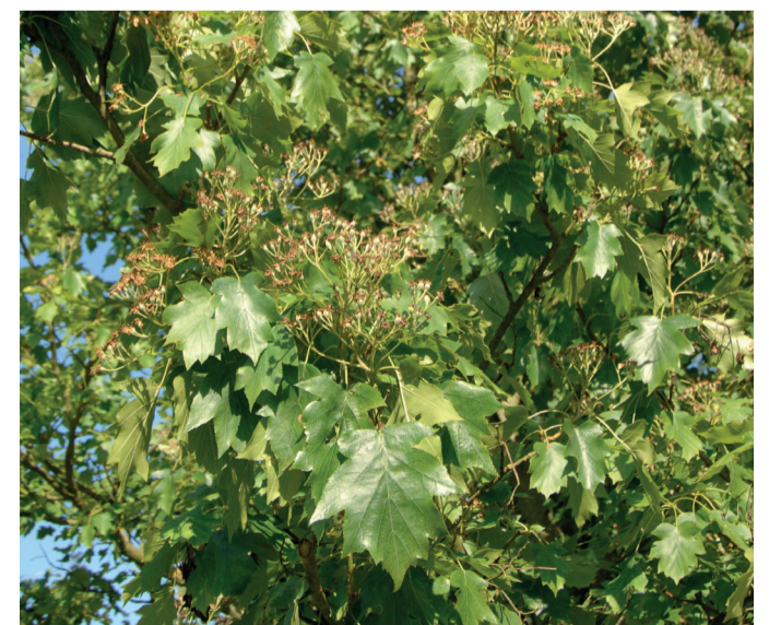
Fruits start to develop in summer.

This is an extended summary of the chapter. The full version of this chapter (revised and peer-reviewed) will be published online at https://w3id.org/mtv/FISE-Comm/v01/e01090d . The purpose of this summary is to provide an accessible dissemination of the related main topics.