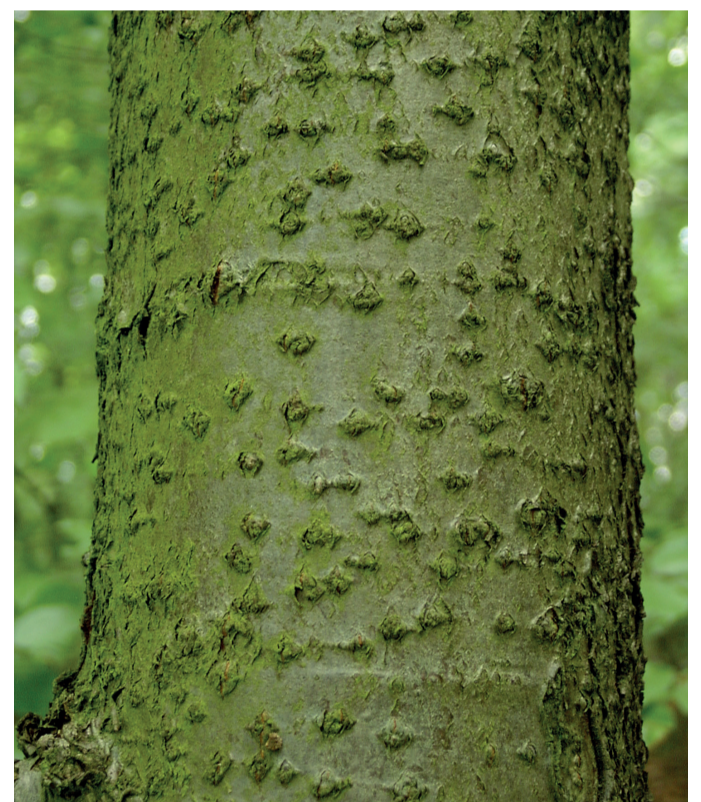
Grey-brown bark of young tree with lenticels, it becomes fissured into scaly plates when mature.

Due to efficient seed dispersal by birds and small mammals, and the ability to spread vegetatively by root suckers, the species can easily colonise appropriate sites, such as larger gaps, clearings, low-density forests and abandoned agricultural land surrounded by forests, thus remaining permanently present in the landscape 8 . Regarding soil characteristics it is a very tolerant species that can grow on both acid and basic soils (from clay to limestone), with a pH ranging from 3.5 to 8 and humus types from dismoder to carbonate mull 2 . It avoids both dry sandy soils and wet or marshy soils and reaches its best growth on warm-dry limestone soils 1, 2 .