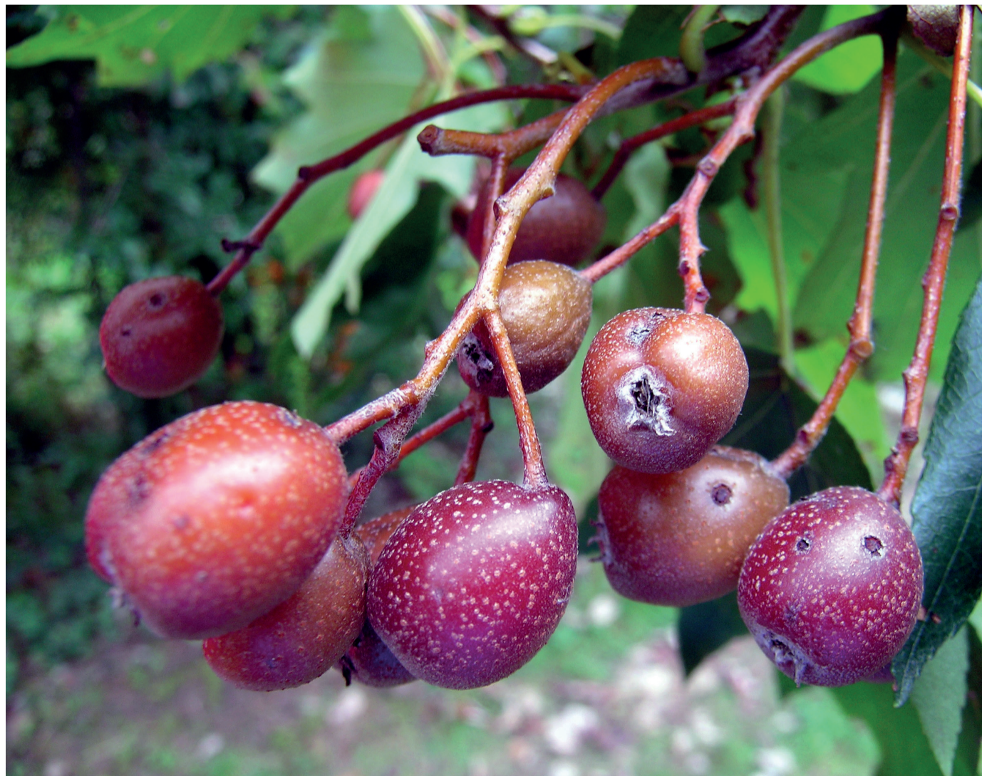
Maturing reddish fruits: these small pomes are edible and very astringent until over-ripe (bletted).

Older trees of the wild service tree can reach a root-depth of 1-2 m, rendering it quite resistant to wind-throw 9 . Young trees are especially susceptible to browsing by deer and other