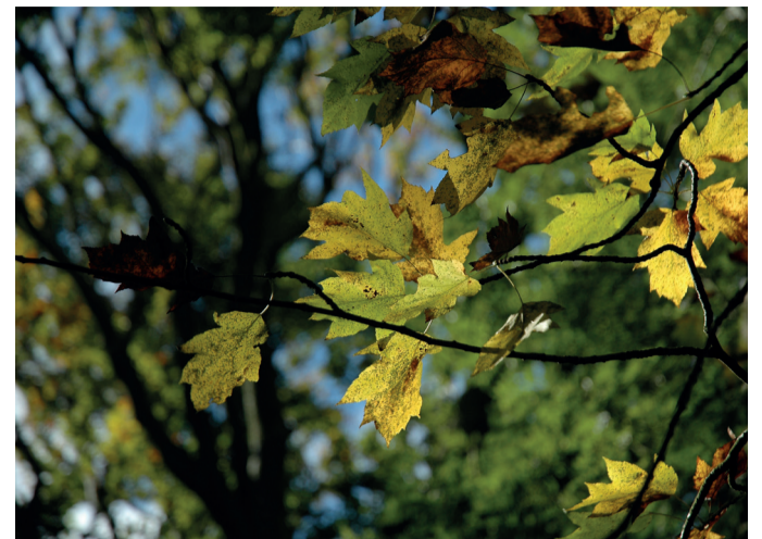
Yellow and red-brown leaves in autumn.

species is getting increasingly scarce in mountain areas towards the north of the distribution range, and is rather uncommon in cool habitats like north-facing slopes or cold valley bottoms 7 . The same lack of summer warmth limits the general vertical distribution. The optimum mean annual temperature is between 10 ° and 17 °C; minimum annual rainfall is about 500mm, while the optimum lies between 700 and 1500mm 3 . The wild service tree is a shade intolerant, post-pioneer (nomadic) species, requiring free-growth for optimal crown development. It is a minor component of woodlands-types dominated by various oaks and less frequently pine or beech, where it is found as single trees or in small groups, and population densities are generally very low 2 .