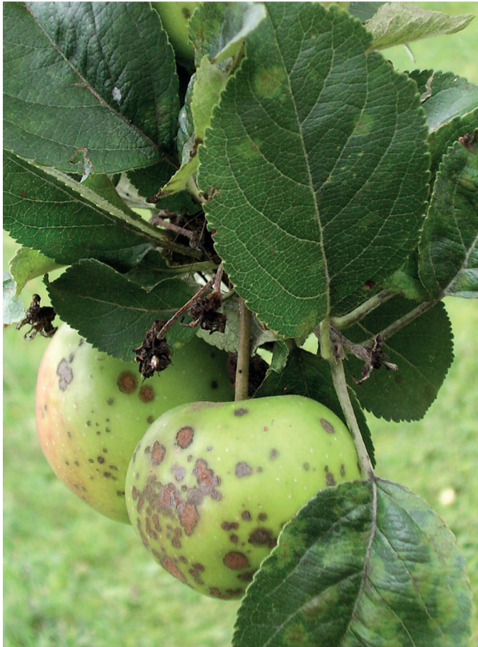
Apples affected by the disease Venturia inaequalis ; this Ascomycete fungus can affect also wild service tree.

The wild service tree is one of the most valuable hardwoods in Europe. The wood is fine-grained, very dense and has good bending strength. In earlier times it was used to make screws for winepresses, billiard queue sticks, musical instruments and turnery. Today, it is mainly used for decorative veneers. Quantitatively, the wild service tree wood is of low importance for the European wood market since only several thousands of cubic metres are harvested yearly 2 .