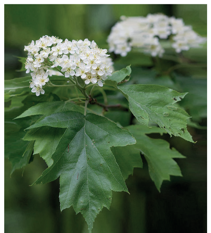
Scented white hermaphrodite flowers: they are insect pollinated.