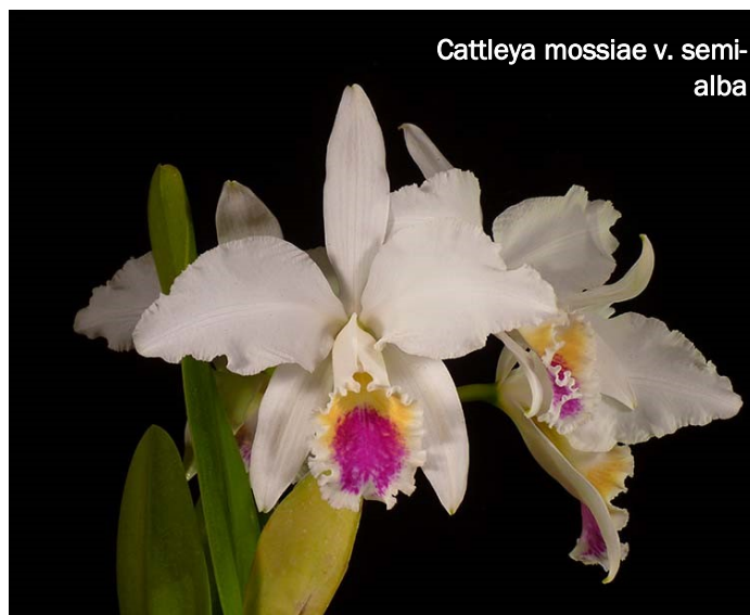
Cattleya mossiae v. semi- alba

lief from the heat that we have experienced. Higher humidity and temperate days make happy plants. Nights are now warm enough that most of the orchids that needed winter protection can go back outside.