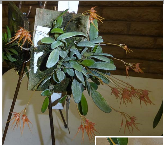
Bulbophyllum (Cirrhopetalum) taiwanense