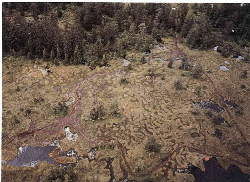
Photo 2. A bird's-eye view of Higashi-Ohnuma pond area of Ukijima mire from a research ballon at a height of ca. 300 m. Bare walk surrounds the regeneration complex composed of the Scheuchzerio-Rhynchosporium albae boreale , the Sphagnetum papillosum , and the Sphagnetum fuscum .