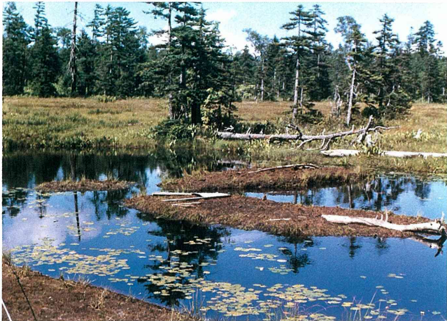
Photo 5. Floating islets on Ohnuma pond, of which vegetation has been completely damaged by the treading. (photo by Ito, 11 Sept. 1985).