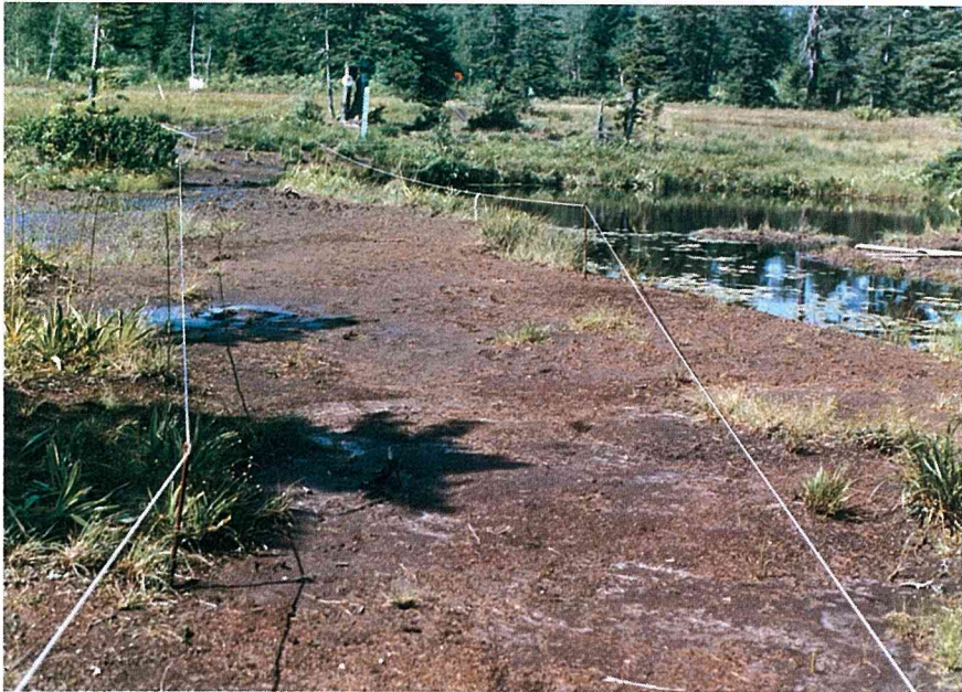
Photo 4. Barren vegetation on the shore of Ohnuma pond. (photo by Ito, 11 Sept. 1985).