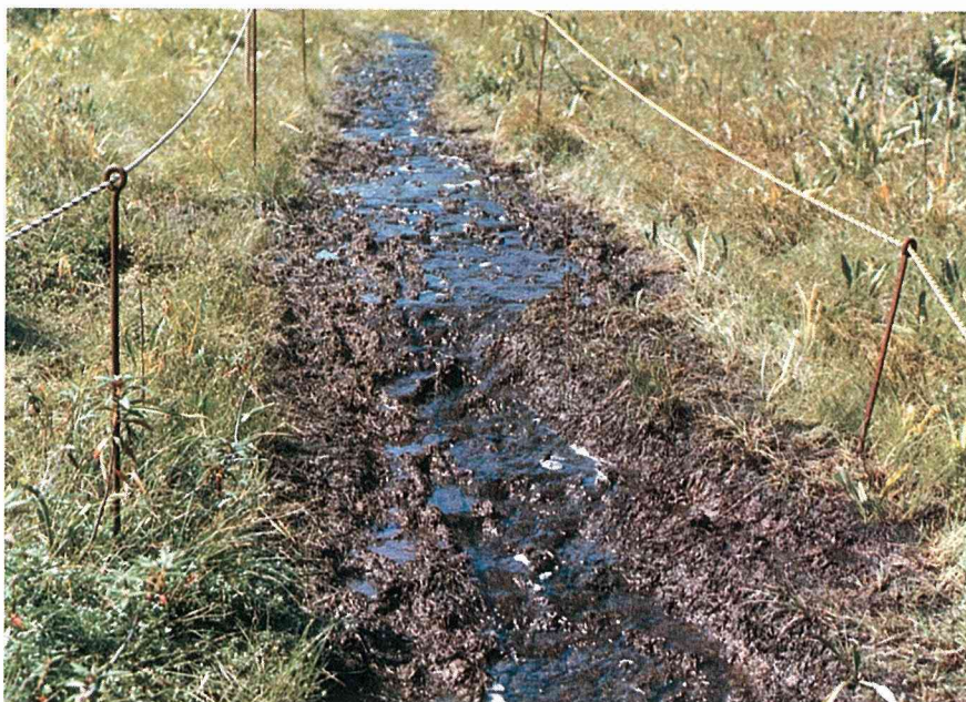
Photo 3. A muddy path becomes the water course after a shower. (photo by Ito, 11 Sept. 1985).