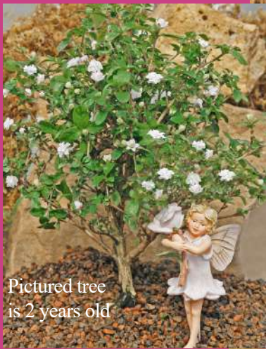
Pictured tree is 2 years old