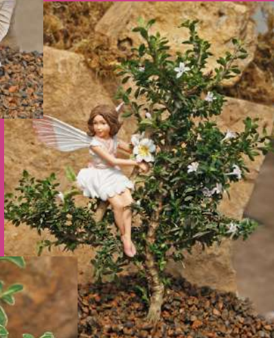
Pictured tree is 3 years old