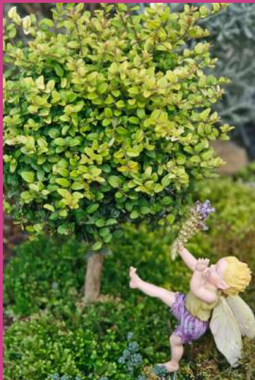
Pictured tree is 2 years old

Provide sun and fertilizer and you'll have non-stop, orange blooms and eventually many pomegranate crops. May lose its leaves if temperature goes below 50°, but greens up again in spring. Great mini tree for bonsai for its twisting trunk.