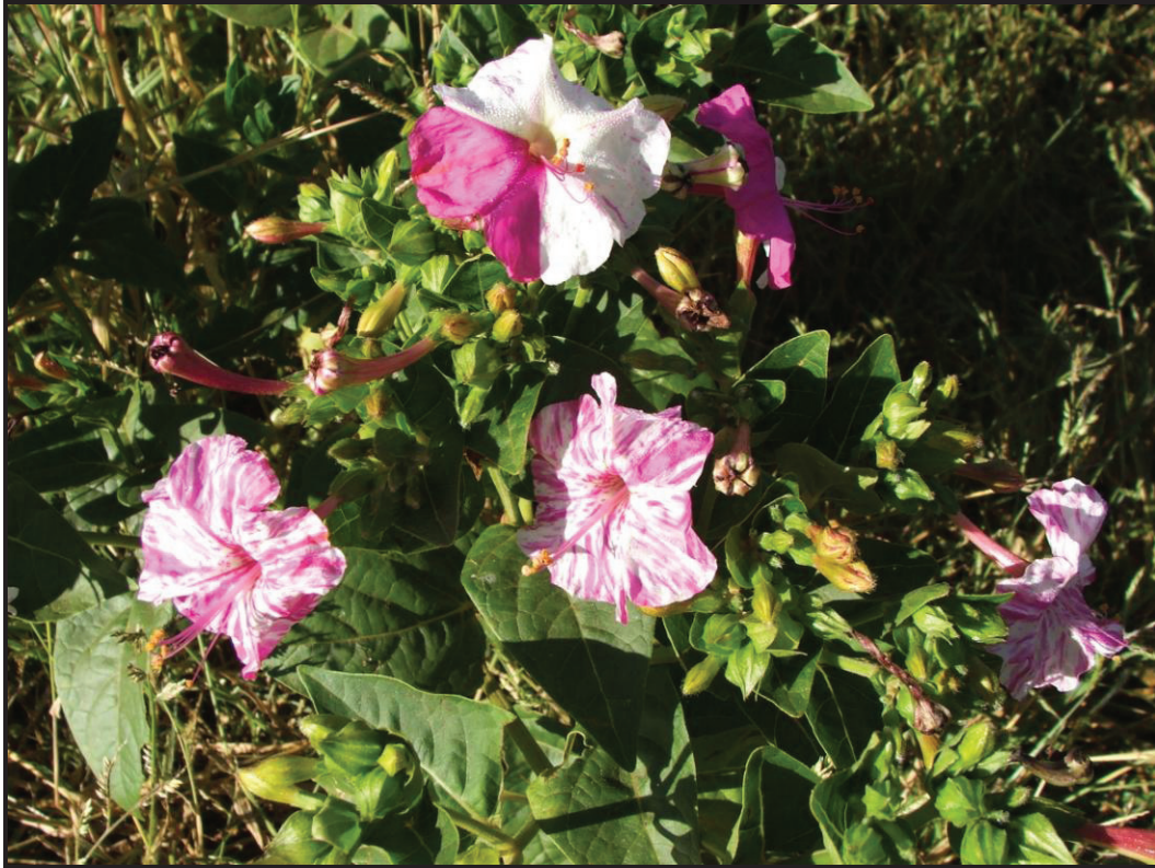
Figure 1.5: Variation in the flower colour of Mirabilis jalapa.