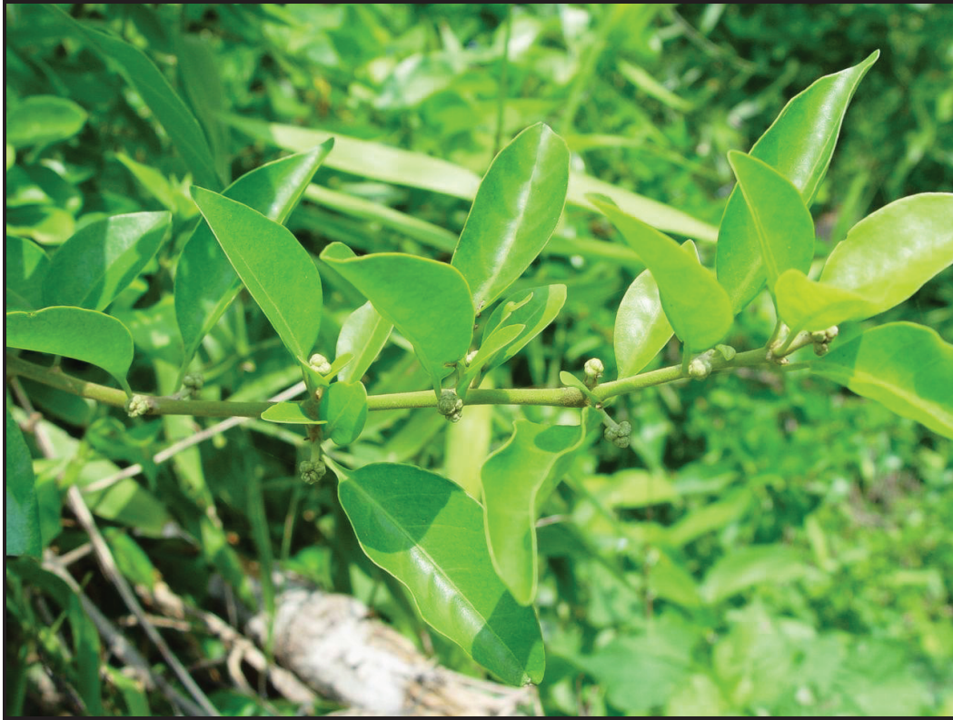
Figure 1.7: Branch of Pisonia aculeata.