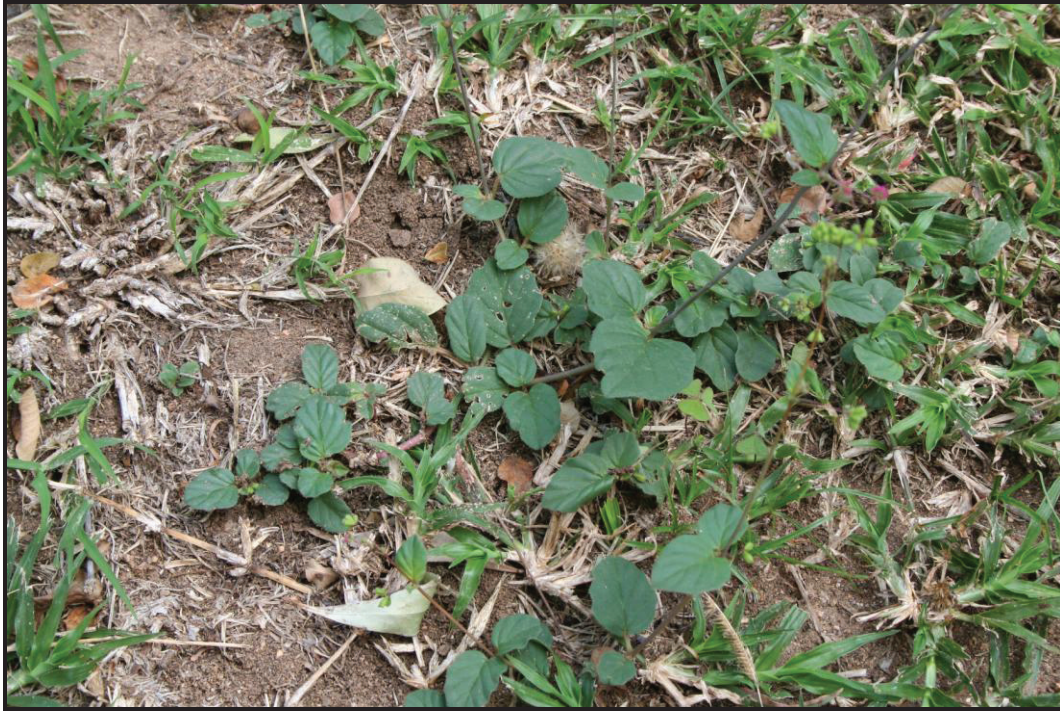
Figure 1.3: Typical growth form of Boerhavia ( B. diffusa var. diffusa ) (Photo: S.J. Siebert).