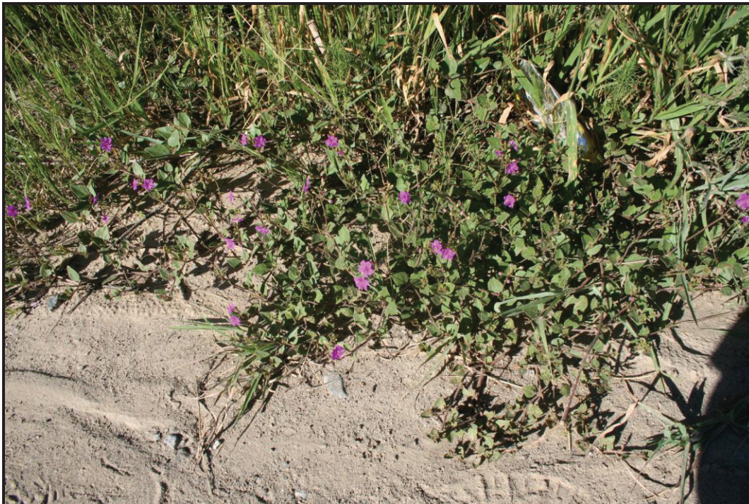
Figure 1.4: Typical growth form of Commicarpus ( C. pentandrus ).