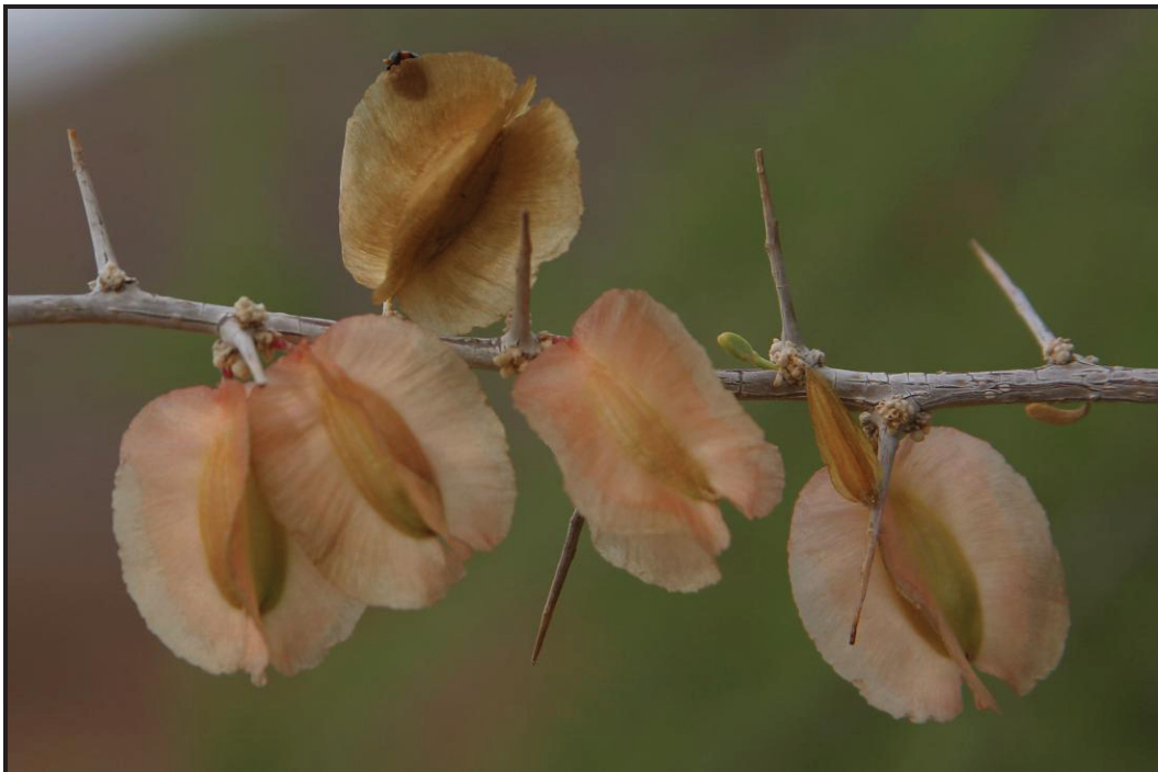
Figure 1.6: Winged fruit of Phaeoptilum spinosum.