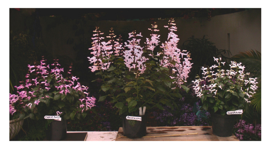
Fig. 1. Triploid '7s' compared with diploid Cape Angels® Pink (left) and White.

which grant this genus its aromatic nature are thought to hold a number of potential treatments (Rabe and Van Staden, 1998).