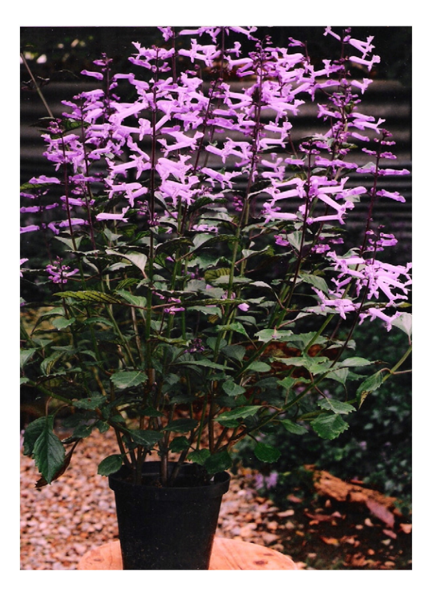
Fig. 3. Triploid '2s' Cape Angels® Purple.

treat all 13 categories of ailments (Lukhoba et al., 2006). The species has low toxicity (Figueiredo et al., 2010) and is the subject of ethnobotanical research (Falé et al., 2009; Figueiredo et al., 2010; Porfirio et al., 2010). It is thought that a tea made from its leaves could be useful in the treatment of dental infections (Figueiredo et al., 2010). Infusions and syrups made from the leaves are used to treat digestive and liver complaints by people of African descent living in South America (Albuquerque, 2001).