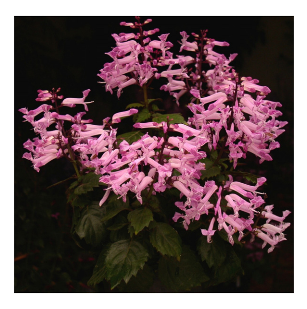
Fig. 4. Pink, suspected triploid '11s'.

Hay fever and headaches are often treated with P. ecklonii (Pooley, 1998). The essential oils from this species show both anti-bacterial and anti-fungal activity useful in the treatment of skin infections (Nyanyiwa and Gundidza, 1999).