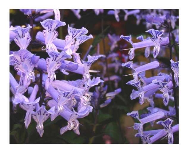
Fig. 2. Blue fertile allotetraploid ( P. hilliardiae x P. saccatus ) '14s' vs. 2n 'Mona Lavender'.

P. barbatus does not originate from southern Africa, rather from north-eastern Africa (Codd, 1985), however it is found in South Africa as an invasive species (Van Jaarsveld, 2006). This species is one of the most widely used Plectranthus species (Alasbahi and Melzig, 2010). It is mentioned here as it is used to